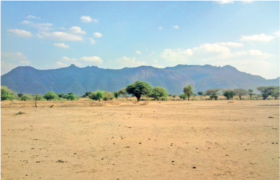
Figure 2: Iramba Plateaus as observed from the Wembere plains.

'Marenga Mkali' were used to geographically differentiate much of what was called Ugogo from the area north of it. To a large extent, they also explain why pastoralism and hunting activities were predominant in this part of Singida.