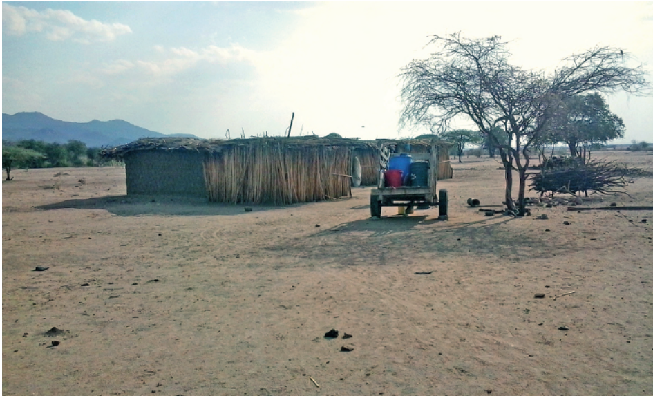
Figure 4: One of the first houses of Mzee Hodi Hodi built in 1988 after the 1984–1987 war.

due to what was considered to be their contravention of government land laws. 366 By 1940 the Datoga were the exceeding majority in the plains. Inter-ethnic interaction existed with less antagonism than was witnessed in the borders between Mbulu and Singida. Hodi Hodi remembers the relative isolation of the Datoga in the Wembere plains, which continued until 1945 when some fishing villages around Kitangiri Dam began expanding and attracting the Nyiramba people from the upper plateau to the lower lands of Wembere. Most of these villages were formed during ujamaa in 1974–1976, which created the first motivation to settle on the plains (Interview Kiula, 18.09.14). With increasing population growth in the upper plateaus of Iramba led to the slow descent of more people onto the plains. While other communities were created in ujamaa villages, most of Hodi Hodi's family continued to live in their old villages.