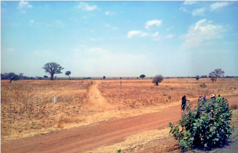
Figure 3: The Wembere plains during dry season.

its extensive lowland grassland and belts of wooded grassland, connects with more wetlands of Ugalla in the western region of Kigoma. Being lowland plain and close to the rift wall, the plain is characterized by extremes – by drought and by flood (Vesey-Fitzgerald 1970: 66). During the rainy season the plain floods, which makes it a favourable space for rice farming and fishing. In contrast, in the dry season the temperatures soar and the valley are scorched with its grass heavily grazed (Figure 3). The migration of pastoralists following the seasonal water sources and grazing spots is therefore a distinguishing feature of Wembere plain (Mpemba 1993: 65).