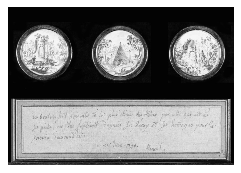
Fig. 2 Grand Duchess Maria Fedorovna, three Imperial buttons comprised of drawings in graphite on vellum of architectural features in the gardens of Pavlovsk Palace and Tsarskoe Selo, mounted in gold frames with rims chased in a laurel leaf design. Part of a set of twenty-two buttons placed in a gilded wooden frame with a hand-written dedicatory inscription and presented to Catherine the Great (1790). Lot no. 424, The Russian Sale, Sotheby's, London, 1 December 2004.

work of Charles Cameron, the Scottish architect employed by the Empress at Tsarskoe Selo and subsequently commissioned to design the palace and many of the garden structures at Pavlovsk.) Its figuration in drawing – an acknowledged and respected component of the fine arts – was the work of another man, as Maria Fedorovna's drawings are copies of originals by the miniaturist François Viollier. In copying one man's drawings of another man's architecture, Maria Fedorovna's work might thus seem derivative, with an inferred deference to the greater originality and artistic prowess of men. Yet she uses her sources to create an entirely new artistic artefact in the form of the buttons which, as part of costume and dress as well as an applied art, speak to interests and pursuits typically associated with women. A process of gradual transformation is under way, negotiating a visual journey from the masculine connotations of the architecture to a highly inventive, feminine art form.