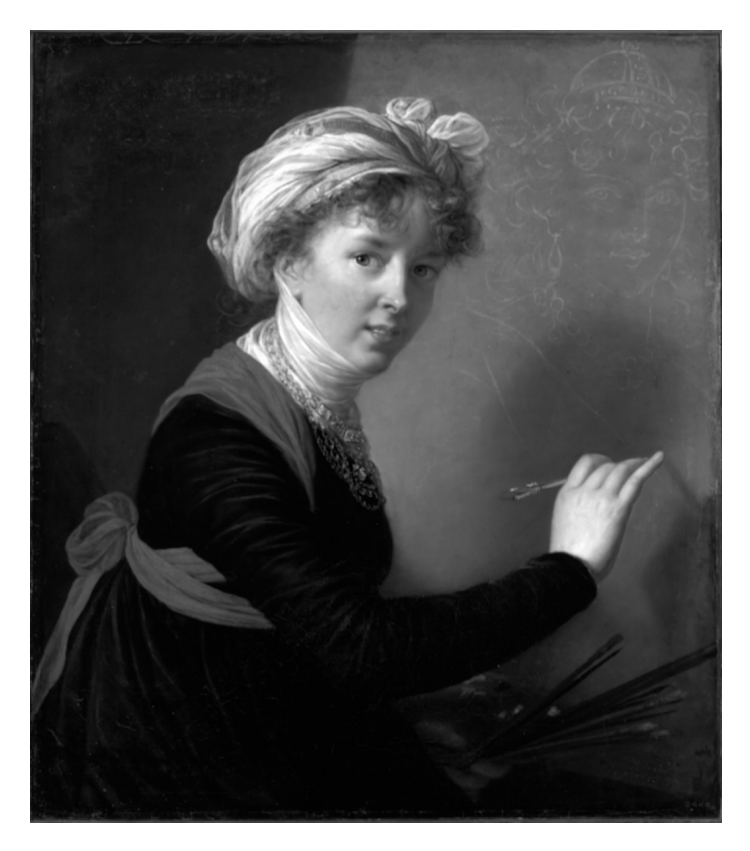
Fig. 1 Marie Louise Elisabeth Vigée-Lebrun, Self-portrait (1800) The State Hermitage Museum, St Petersburg.

Yet any inference from Vigée-Lebrun's painting that women artists were an established part of the cultural fabric of Russia would be misleading. With the exception of the occasional acclaimed foreigner or woman of Imperial status, female practitioners of painting, sculpture, or architecture were practically invisible in Russia at the time. Denied access to the formal artistic education provided by the Academy as well as to any official routes of exhibiting and selling their work, they tended to produce amateur work in media such as watercolour and pastel which was enjoyed in the domestic rather than the public sphere. The same was true of music and theatre, where women tended to focus on those forms of song, instrumental works, or amateur dramatics suitable for performance in the home, as Philip Bullock and Julie Cassiday explore in their chapters here. As far as the upper classes are concerned, it would be simplistic to draw too clear a correlation between gender and amateurism, as throughout the first