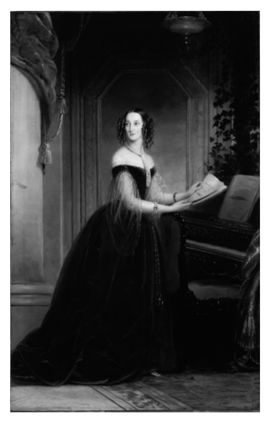
Fig. 5 Christina Robertson, Portrait of Grand Duchess Maria Nikolaevna (1841). The State Hermitage Museum, St Petersburg.