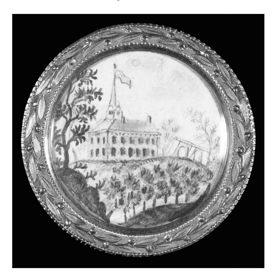
Fig. 3 Detail of Fig. 2

Such visual playfulness apart, the buttons have an important documentary function, as they provide a rare record of the appearance of Pavlovsk before a fire devastated the palace in 1803. They also offer an insight into the dynamic between Maria Fedorovna and her mother-in-law, not least in the inscription which they bear: 'Ces boutons sont presentés à la plus chérie des Mères par celle qui est à ses pieds en vous suppliant d'agreér ses Voeux et ses hommages pour la journée d'aujourd'hui. Le 25, Juin 1790 Marie F.I'. Relations between the two