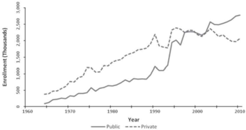
Fig. 1. Nursery school enrollment, 1964–2010. (Data from Current Population Survey.)

The second dimension along which preschool education in the United States differs from that of other countries is its public-sector decentralization. Government programs are administered at the national, state, and local levels. Dozens of national programs provide or support education and care for children under the age of five. They are administered by the Department of Education, the Department of Health and Human Services, and other agencies. In addition, many programs exist at the state level. During the 2009–10 academic year, forty states funded one or more prekindergarten initiatives (Barnett et al. 2010). One scholar characterizes this crowded landscape of governmental activity as a “hodgepodge of federal, state, and local funding streams and regulations” (Finn 2009, 27). This book focuses on national and state initiatives. Decentralization is a defining attribute of preschool education in the United States, whereas countries like France operate more-centralized systems.