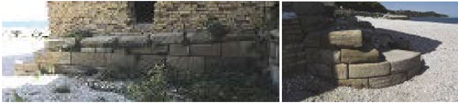
Figure 2 - Pier of ancient harbour at ‘Lo Scalo’ locality in Ortona.

Even in the Bonapartist period of the French decade, under the kingdoms of Joseph Bonaparte first and Joachim Murat then, the site was affected by war episodes, in particular by the cannoning of the port in 1811 by the English fleet [13].