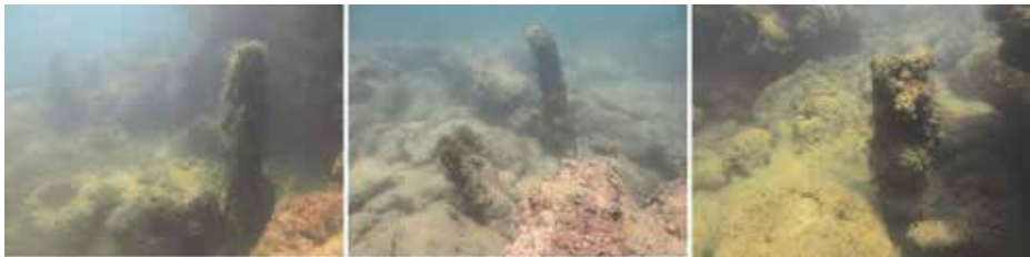
Figure 4 - Rests of the piling of a Trabocco, typical fishery machine.

In the North side of the coast, in the sea in front of Torre Mucchia are presents numerous rocky blocks due to landslides of the promontory over the centuries, with the remains of some metal poles emerging from the bottom for a few tens of centimeters, attributable to the piling of a Trabocco, a local typical fishery machine (Figure 4, 5). The presence of the Trabocchi along the Abruzzo coast is proved since 1700 AD [16].