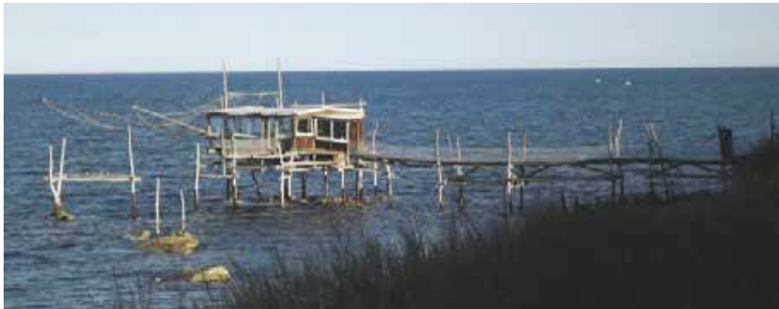
Figure 5 - Trabocco, a typical fishery machine along the Abruzzo and Molise coasts.

In the Ferruccio cape, except the presence of rocks with various size due to landslides for a length of about 80÷100 meters from the current coastline, was found a set of wooden planks lying between the rocks, at a distance that varies from 4 to 10 meters from the coastline, to belong to the plating of a boat or to a wharf collapsed into the water (Figure 6).