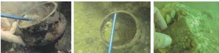
Figure 7 - Archeological finding of a glazed ceramic tube used to channel rainwater.

The internal site of breakwaters and wave barriers is characterized by a low and sandy seaside with a depth of 2÷3 meters, from where sprout large blocks of rock due to the landslides that characterized the castle promontory.