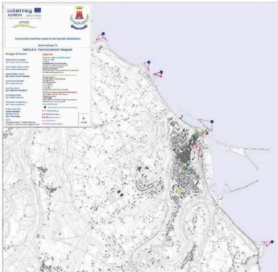
Figure 8 - Integrated Cultural, Geologic/Naturalistic and Touristic map.

This project represents a first step of characterization of archeological and cultural heritage present in the marine-terrestrial naturalistic areas for a valorization strategy. Further analyses are need to find the remains buried at greater depths and perimeter the archaeological areas for a better conservation.