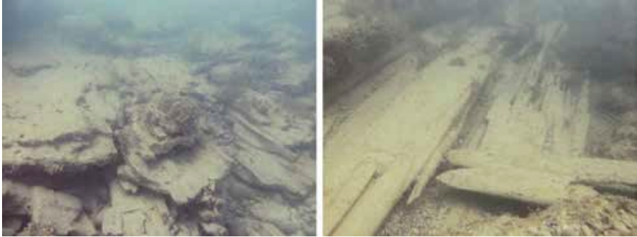
Figure 6 - Wood material from a boat or a wharf (Ferruccio Cape, Regional Natural Reserve of Ripari di Giobbe).

In front of Ortona Promontory, in the external side of breakwaters and wave barriers, until 34÷40 meters and a depth of 5 to 7 meters, the seabed is characterized by river pebbles and big rocky blocks due to landslides of the promontory. The discovery of a glazed ceramic tube of the type of those inserted in the walls and used to channel rainwater, would allow us to interpret the layer of river pebbles as a collapse of portions of the castle or other buildings built on the promontory above (Figure 7).