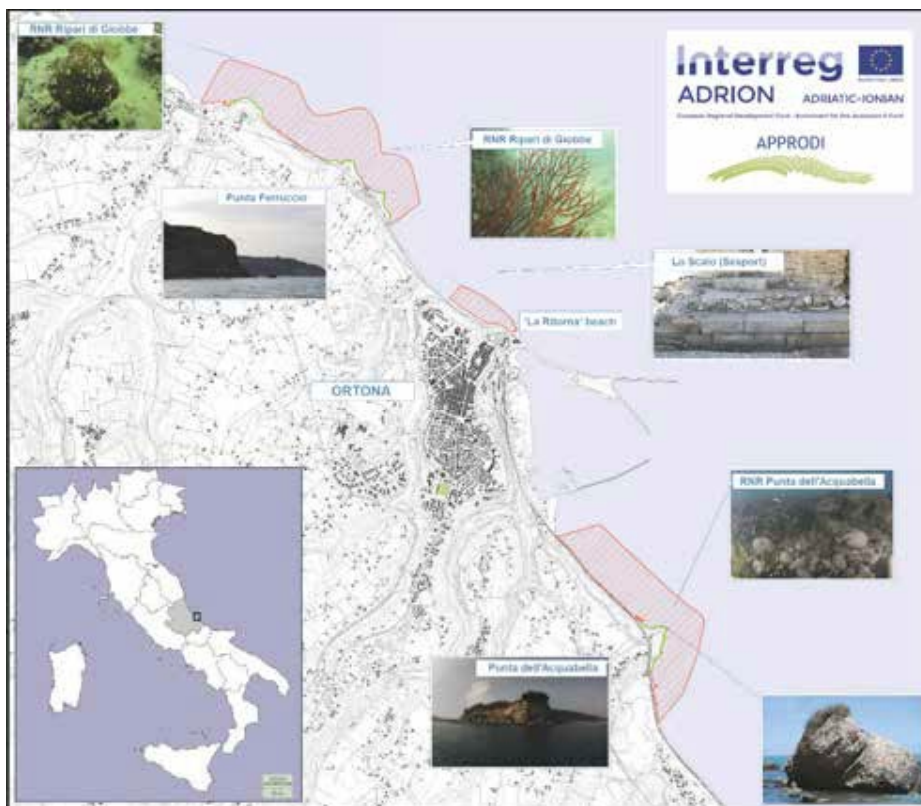
Figure 1 - Location of Interreg ADRION APPRODI in Ortona Municipality.

In the 11 th century on the Abruzzo coast there were shipping companies and businesses serving mercantile trade, which developed in particular towards the Dalmatian coast: the establishment of the Venice-Ancona-Ortona-Slavonia network (State Archives of Venice) is referred in a document of 1200 AD. In the Seaport, current La Ritorna beach (Figure 1), it is possible to identify the traces of the ancient port's pier, composed of six rows of stone blocks, built according to the ancient technique of the opus quadratum , with the root of the old pier divided into three parts (Figure 2). [7, 8, 12, 18, 19].