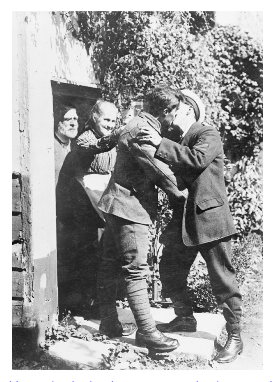
Figure 2 Soldier and sailor brothers greeting each other upon their arrival on leave at their parents' house.

There is a significant absence of the brotherly kiss in these narratives. Brothers' bodily contact on meeting was usually handshaking or hugging. Das's analysis of the 'dying' or 'mothers' kiss suggests that 'friendly' male-to-male kisses saw a revival in the trenches, a reversal of the 'normal tactile codes' which restricted the 'friendly kiss' to ladies. Horace Nicholls, appointed the first full-time Official Photographer of Great Britain in July 1917, captured striking images of a soldier and sailor brother kissing (Figures 2 and 3).