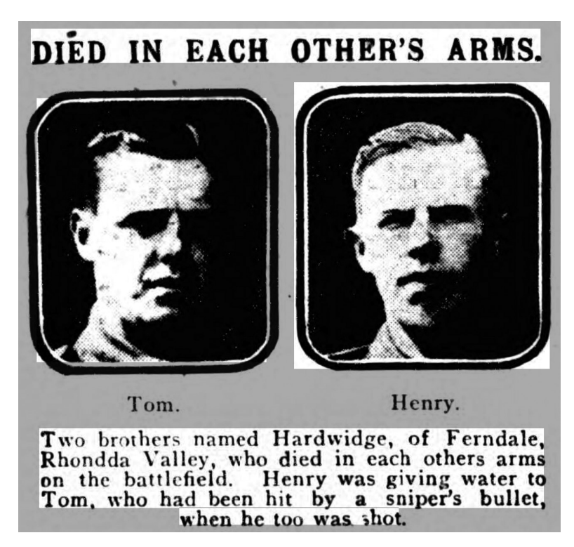
Figure 5 'They died in each other's arms', Daily Mirror, 24 August 1916.