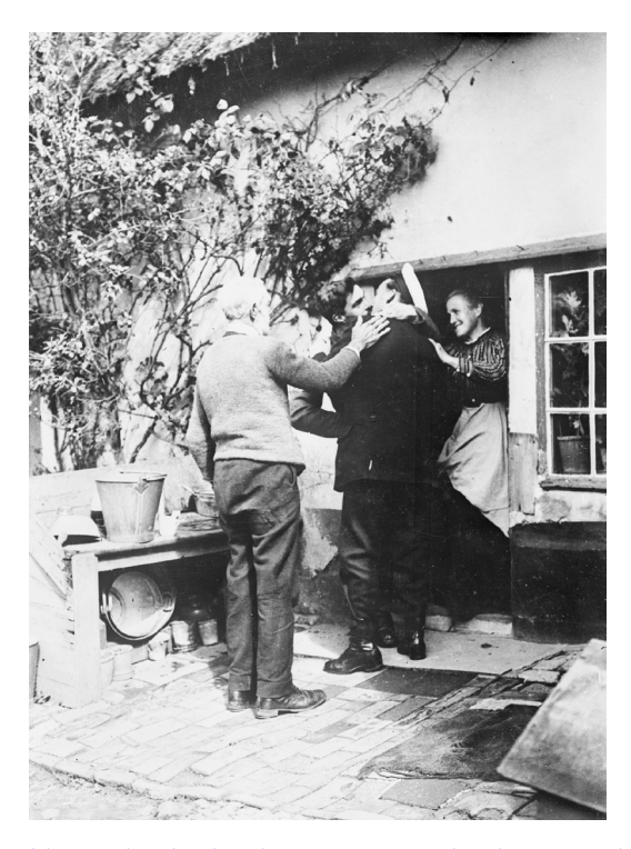
Figure 3 Soldier and sailor brothers greeting each other upon their arrival on leave at their parents' house.

These formed part of Nicholls' series of soldiers on leave, perhaps reflecting his aim to 'build up a "story" around his subjects. 126 The two photographs show that, like many of Nicholls' images, this 'meeting' was carefully posed and looks staged. The story that the image imparts is one of brotherly love and affection. Clearly, the trope of loving brotherhood was one that the official photographer of the home front wanted to propagate.