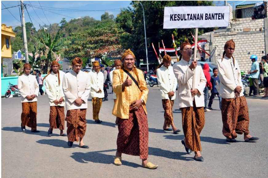
Delegates from Banten Sultanate at the Nusantara Keraton Festival in Buton, 2012.

place on May 19, 2012, at batu popana , the most sacred spot in the palace compound. The election and inauguration of La Ode Muhammad Ja'far as the new sultan of Buton remained controversial. Some Butonese aristocrats refused to acknowledge the sultan, claiming that since the adat council was illegitimate, its decision was, therefore, an unlawful violation of adat . However, the majority of the aristocrats had chosen to remain passive and made no effort to resist the newly appointed sultan.