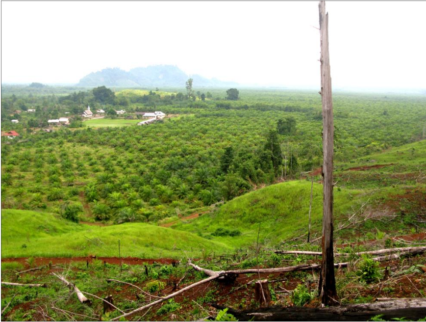
Taronggo is located within an ocean of oil palms.