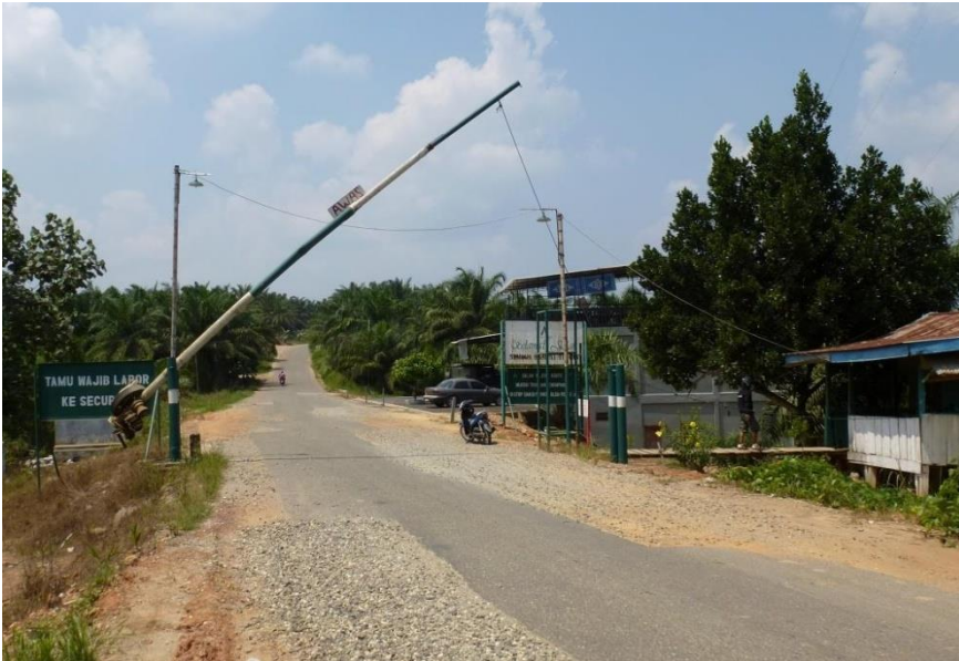
Guarded official entrance of the PT AP concession area.

permit; PT BDU was obliged to deal with this issue. A forest department inventory in 1987 showed, however, that more than 2,000 Batin Sembilan families were living and practiced shifting cultivation on 4,000 ha within the concession area (Colchester et al. 2011:11). As some of these families refused to leave their territory, they were evicted by military force under the repressive New Order regime; they finally withdrew from the concession area. The company was renamed PT Asiatic Persada (PT AP) in 1992. Subsequently, ownership changed several times until it was bought by the Singapore-based international agribusiness group Wilmar in 2006 (Colchester et al. 2011; Setara 2012; TÜV Rheinland 2011).