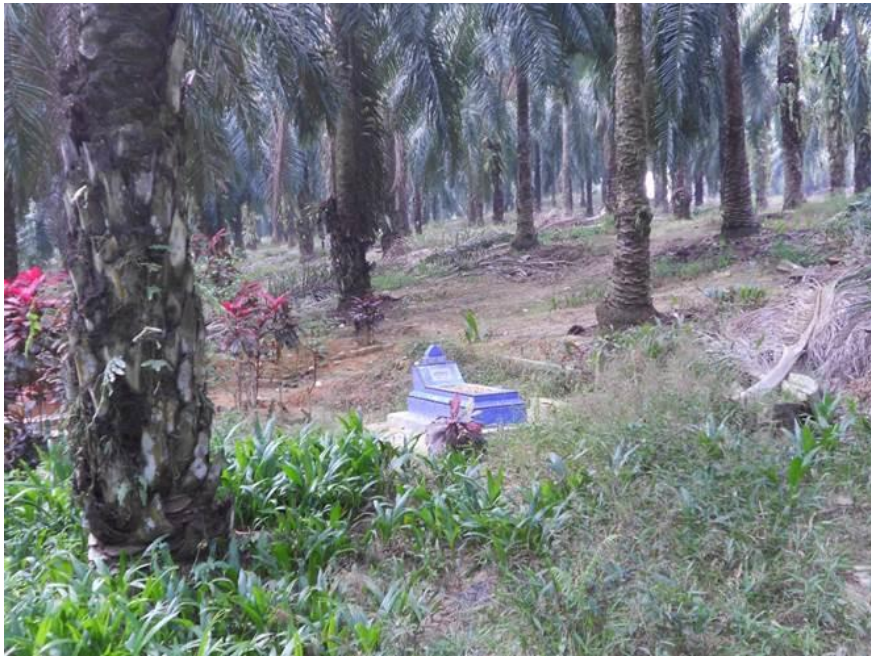
Batin Sembilan graveyard inside PT AP oil palm plantation.