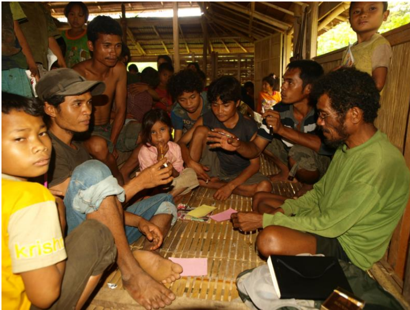
Old and young learners at the sekolah lipu in Salisarao.