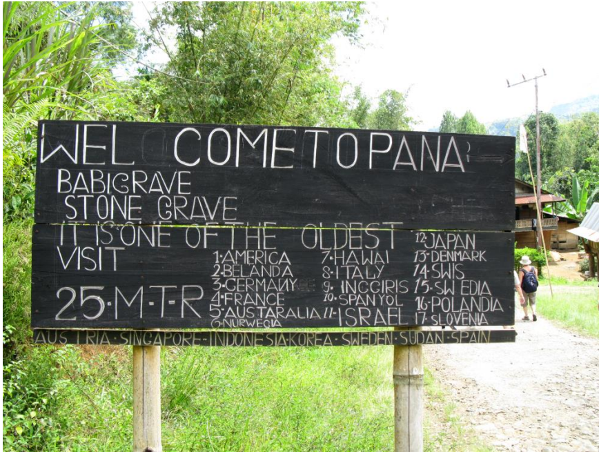
Pana, a hamlet which is not officially recognised as a “tourist object”, boasts of the global tourist attention it nevertheless attracts.

1984b:191). It was the economic promise of tourism which brought new recognition to these “backward” structures and practices.