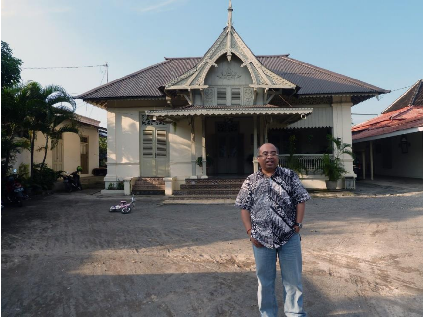
The author in front of a house of a prince in Kasunanan Palace in Surakarta.

extends to shape different affiliations of the keraton to existing palace organisations or networks.