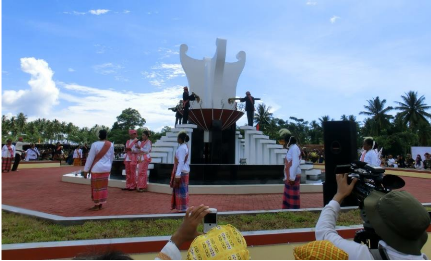
The monument Air Nusantara in Tobelo. Holy water from all over Indonesia was merged in the monument during the opening ceremony of KMAN IV in April 2012. Tobelo activists borrowed from Hibua Lamo philosophy in its construction, especially the importance of the number eight and the cardinal points.

he classifies as traditional. 10 As it is constructed around a big open space, it can be used for meetings, such as workshops during KMAN IV. The position as an adat activist is complemented by his membership of North Halmahera's parliament. 11