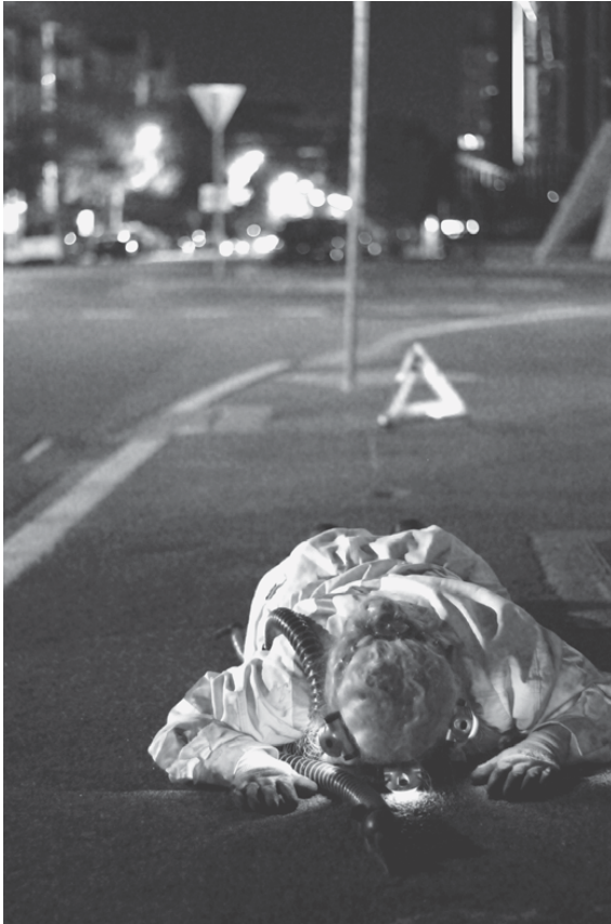
Figure 6.2 Desiré, a tangled pile on the pavement, face-to-face with bitumen

positioning affective material labours as performances of care that maintain and repair our world.