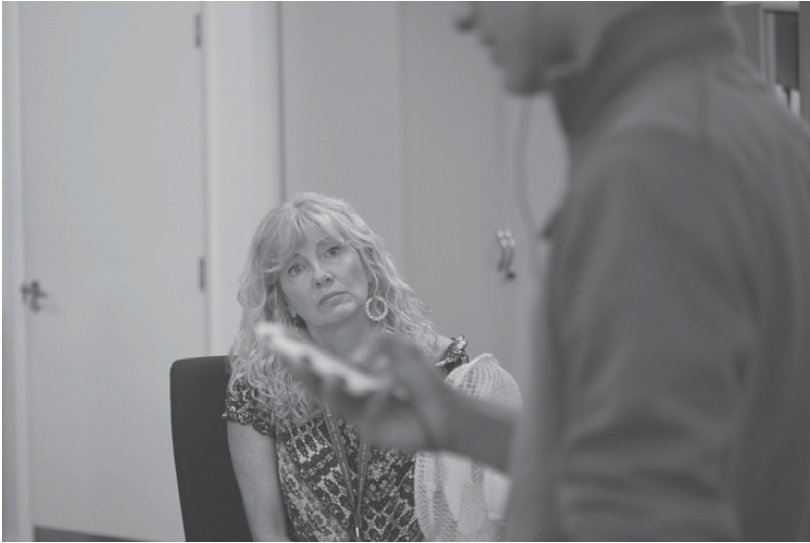
Figure 10.3 Sharing verbatim

to share and, during events, actively participate in extending discussion. This has often revolved around issues of representation, pertaining not only to the testimonies, but also to the meetings that young people must undergo as they enter care and the ways that their care identities are documented. In this sense, the performances of TVF establishes a new ground of representation under different terms, giving young people and adults the opportunity to discuss the extent to which the experiences that emerge in the testimonial material could lead to changes in areas of professional practice. By adopting an aesthetic process of caring, TVF establishes a dialogic opportunity for exchange between the young people and adults that feels very different from the confrontational exchanges that often occur in care settings. Feelings that are challenging and that might otherwise accrue blame are allowed to emerge and are mediated by the performance process itself. The caring, participatory, performative processes the project opens up generates spaces of communication that are far removed from the more transactional encounters of which young people have complained. The project's events can become an opportunity for professionals to reflect on how their own daily working practices can exacerbate the reasons why young people find it difficult to accept the care that they are offered. The young people themselves report feeling that their voices are being heard on more equal terms.