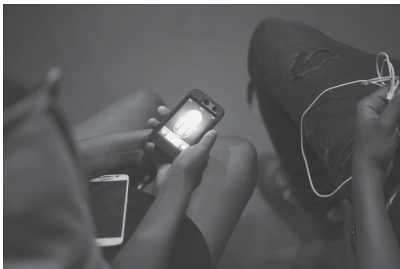
Figure 10.2 Making verbatim

in the structures that represent them and to support adults to honour their experiences and needs. It is important to note that we use the word 'honour' here, both in the sense of respect or esteem, but also as a fulfilment of an obligation – to act on what has been agreed.