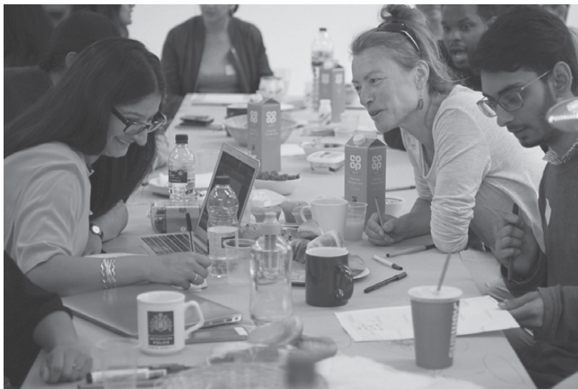
Figure 10.1 TVF welcome breakfast

participant or adult care professional. We find that the shifting of the testimony into the ‘mouth’ of another can heighten the engagement with which our audiences listen to the testimonies. This is particularly so if the identity of the person sharing the testimony is different in some way, such as with respect to age, race or gender, to that of the giver of the testimony. While the headphone form that we will discuss further below has been previously used to create plays by verbatim playwrights for theatre, we have adapted its approach in ways that we argue facilitates forms of caring, participatory practice and performance. The shift enables a ‘care-full’ and caring form of speaking and listening to be part of an ethical encounter between adult carers and young people. This palpably demonstrates that the latter have substantive contributions to make in the ongoing debate around practices of care, while allowing us to frame dialogue in spaces and contexts where they feel they are being heard.