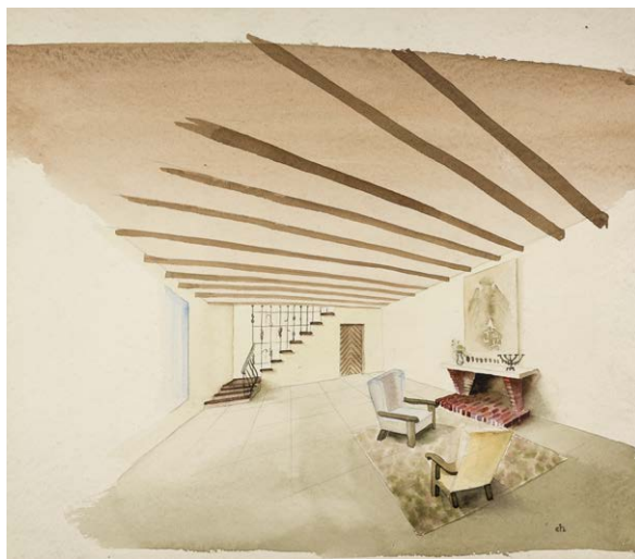
Fig. 3. Franz Ehrlich: Design for a representative hallway with fireplace and staircase for the villa of a SS leader in the Buchenwald concentration camp, undated, 1938–1941; pencil and watercolour on watercolour paper, 38.0 x 41.0 cm

In the construction office, Ehrlich designed, among other things, representative villas for the SS leaders and smaller residential buildings, a commandant's casino, a forest restaurant, an SS home, an animal enclosure, and a falconry for the concentration camp, which was only finished in July 1937, and its ambitious commandant, SS-Standartenführer (Oberst) Karl Otto Koch. The falconer's house of the falconry, a simple half-timbered house with a gable roof, was relocated after the end of the Second World War and now stands as a privately used residential building not far from Weimar in Nohra, district of Ulla. 28