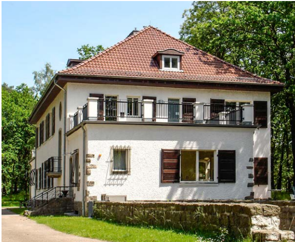
Fig. 5. Franz Ehrlich: Oranienburg, youth hostel Sachsenhausen “House Szczypiorski” (former Villa Eicke) from the west, 1938/39

In 1941, he was transferred to the SS-Hauptamt Haushalt und Bauten, Abteilung C II – Sonderbauaufgaben in Berlin. 34 Ehrlich designed, among other buildings, the conversion of the Comthurey mansion for the head of the SS-Hauptamt Haushalt und Bauten, SS-Gruppenführer (General-leutnant) Oswald Ludwig Pohl.