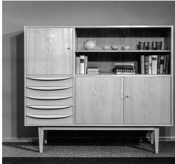
Fig. 6. Franz Ehrlich: Cabinet from furniture programme 602, Volkseigener Betrieb (People's Owned Enterprise) Deutsche Werkstätten Hellerau, 1957

designed furniture for the VEB Vereinigte Werkstätten Hellerau, including the type furniture program 602, which was produced from 1957 and was very successful.