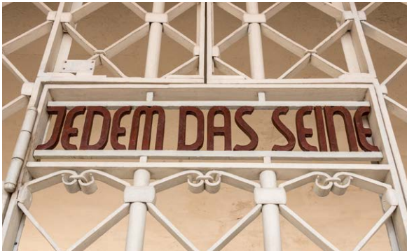
Fig. 4. Franz Ehrlich: Weimar, Buchenwald Memorial, Gate, 1937/38

The construction office at Buchenwald concentration camp is also active for other SS offices. Among other things, Ehrlich designed a restaurant in the SS settlement near Sachsenhausen concentration camp, an SS training home near the Wartburg, and villas and flats for SS leaders in and around Berlin. Among them was the official villa for the head of the Inspectorate of Concentration Camps, 32 the then SS-Gruppenführer (Generalleutnant) Theodor Eicke. 33 Today the building is used as a youth hostel, named House Szczypioski, after a former Polish prisoner of the Sachsenhausen concentration camp.