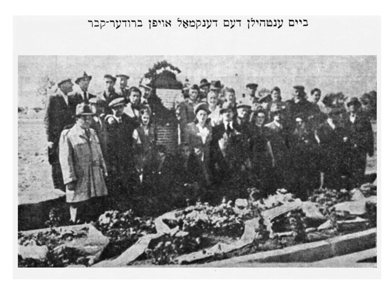
Figure 2.2 Survivors from Skierniewice surround the collective grave of the town's Jewish victims and the monument erected in their memory during its unveiling in August 1947.

liquidated the ghetto on 27 October 1942, deporting some 4,000 Jews to their death in Treblinka, murdering sixty to eighty Jews on the spot, and sending 1,600 Jews to three factory slave-labour camps in nearby Starachowice. At the end of July 1944, the Germans liquidated the Starachowice camps, deporting roughly 1,200 to 1,400 Starachowice Jews to Auschwitz-Birkenau. About sixty Jews were killed trying to escape; many were killed on the periphery of the main camp during a breakout attempt on the eve of the deportation. Others were killed when the Germans discovered them hiding in bunkers below the barracks. Some 600 to 700 Jews who were deported from Starachowice to Birkenau survived to see the end of the war. No Jewish community was re-established in Wierzbnik after the war.