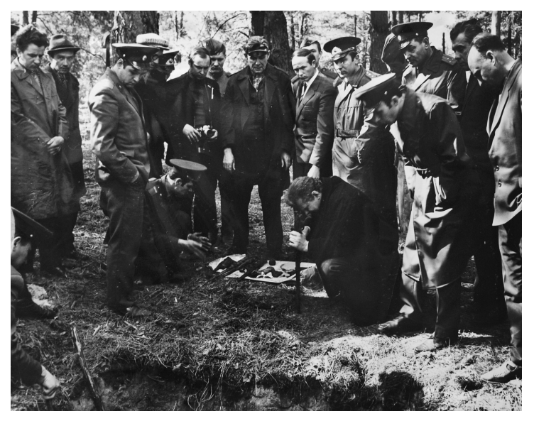
Figure 3.1 KGB officers look on as a forensic expert examines human bones extracted from the Bykivnia mass graves. April 1971.

of the Polish identity of many of the victims. A man called Feodosii Riaboshtan worked at a furnace at the Ninth Forest Factory on the Left Bank. One night two uniformed men visited him and ordered him to burn the contents of six or seven bags that had a stench of corpses. Riaboshtan saw they were old passports, birth certificates, and similar documents, and refused – until he was promised a bottle of liquor. He died in unusual circumstances shortly thereafter.<sup>39</sup>