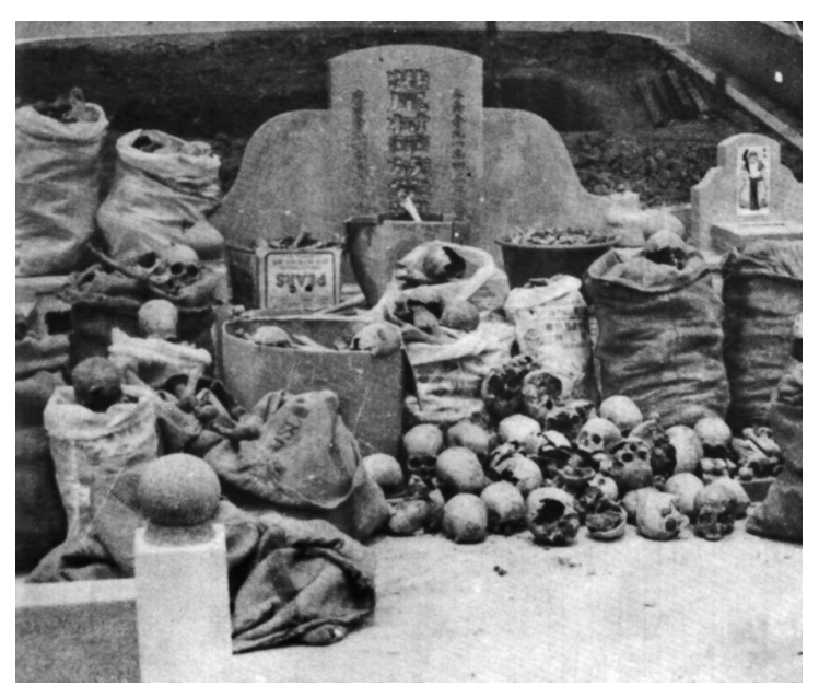
Figure 10.2 Excavated remains from the Parit Tinggi mass grave are placed at a temporary tomb awaiting burial at Kuala Pilah Chinese Cemetery.