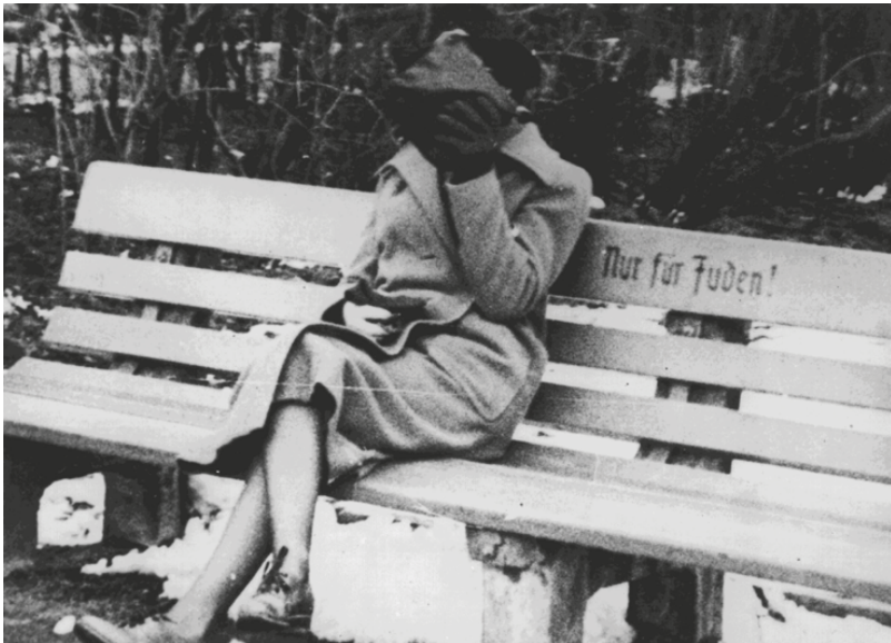
Figure 10.5 Bench 'for Jews only' (courtesy of the Wiener Library, London).