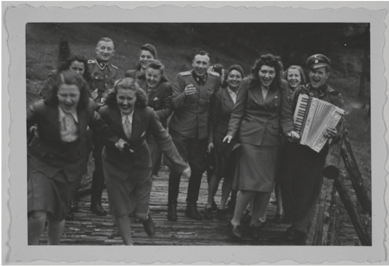
Figure 10.3 Nazi officers and female auxiliaries ( Helferinnen ) run down a wooden bridge in Solahuette. The man on the right carries an accordion.

knew perfectly well of the imminent fate of the Jews he or she was photographing and that we are now looking through their lens – so to speak.