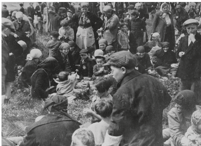
Figure 10.2 Hungarian Jews 1944 waiting in a clearing at Auschwitz Birkenau.

For those who remain uncertain that the educational potential in allowing students this opportunity outweighs the risks of causing trauma, a further consideration is worth our attention here. For the notion of omitting imagery on the basis of avoiding upset is not as straightforward as it may at first seem. The line between ‘appropriate’ and ‘inappropriate’ in classroom settings is not always easily determined and many images of the Holocaust have the potential to shock or distress students without depicting depravity. The atrocity element can be deceptive, its disturbing elements obscured. Horror may lurk beneath the surface, revealed only through contextual knowledge. For example, consider the image of Hungarian Jewish men, women and children gathered in a clearing at Auschwitz-Birkenau in 1944 (Figure 10.2). No one in this image is stripped naked, bloodied, or beaten down; there is nothing that will obviously upset. Only a sense of displacement appears visible on the faces of the crowd. Yet, unbeknown to individuals pictured, they are being held there awaiting their murder in the nearby gas chambers. The horrific nature of the image is revealed through access to this important provenance. This is compounded by our sense that the photographer likely