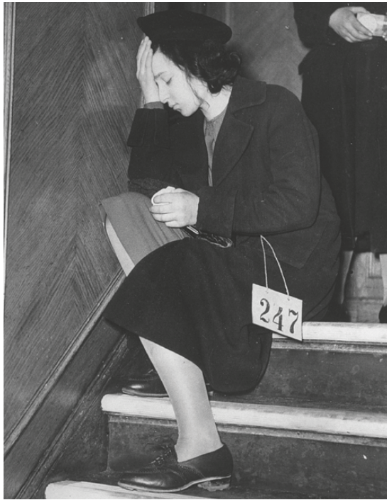
Figure 10.4 A Jewish youth, wearing a numbered tag, sits on a staircase with her head in her hands after her arrival in England with the second Kindertransport (United States Holocaust Memorial Museum, courtesy of National Archives and Records Administration, College Park).