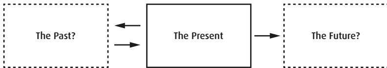
Fig 3.2 Barriers to ‘Lessons’ – uncertain knowledge of both past and future (drawn by author, based on Marrus 2016, 29–51)

variable and shaped by a range of considerations linked to the subjectivity of the historian enquiring into the past. Marrus argues that to draw lessons is to take significant intellectual risks, by making claims about things that it is very hard to know with any certainty – the past and the future (Figure 3.2).