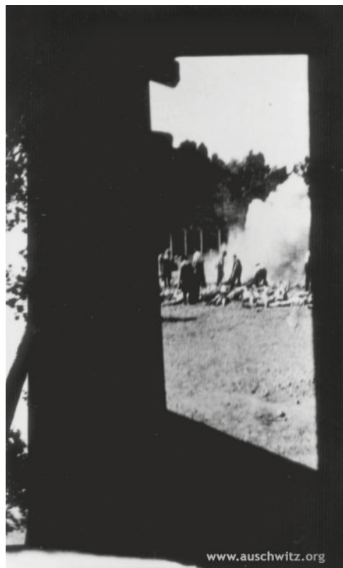
Figure 10.6 Burning bodies of recently murdered victims, in a photograph taken furtively through a doorway.

Historian Dan Stone describes the image as having 'an emergency' and 'an immediacy', which bears 'full frontal atrocity'. He states that to even theorise about its representation is almost offensive (Stone 2001, 131).