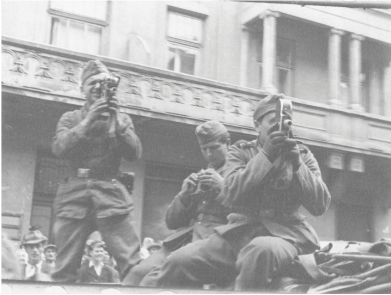
Figure 10.1 German soldiers taking pictures during the Lvov pogrom of 30 June to 3 July 1941.

that abuse makes the actual photograph an instrument of genocide and therefore ethically too morally problematic to view (Crane 2008, 315).