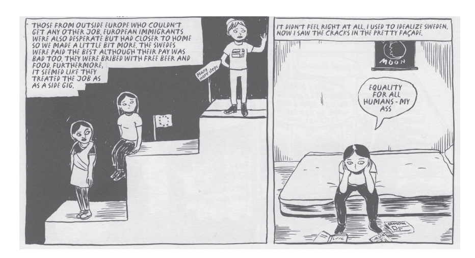
FIGURE 3.3 Daria Bogdanska, Wage Slaves , trans. Aleksander Linskog, Centrala, 2019, p. 37.