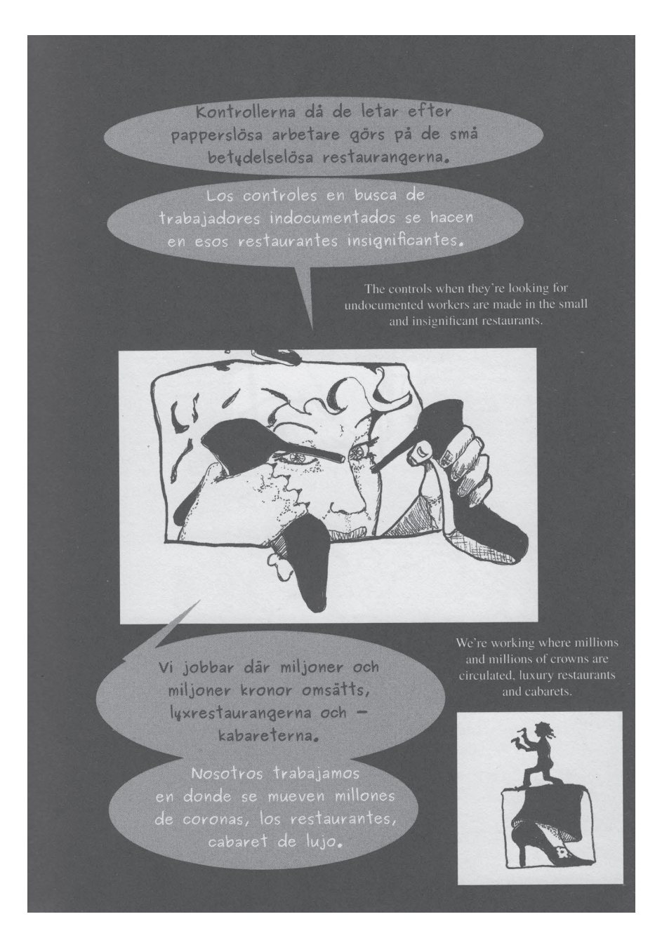
FIGURE 3.2 Amalia Alvarez, The Stories of Five Undocumented Women, Tusen Serier, 2013, n.p.