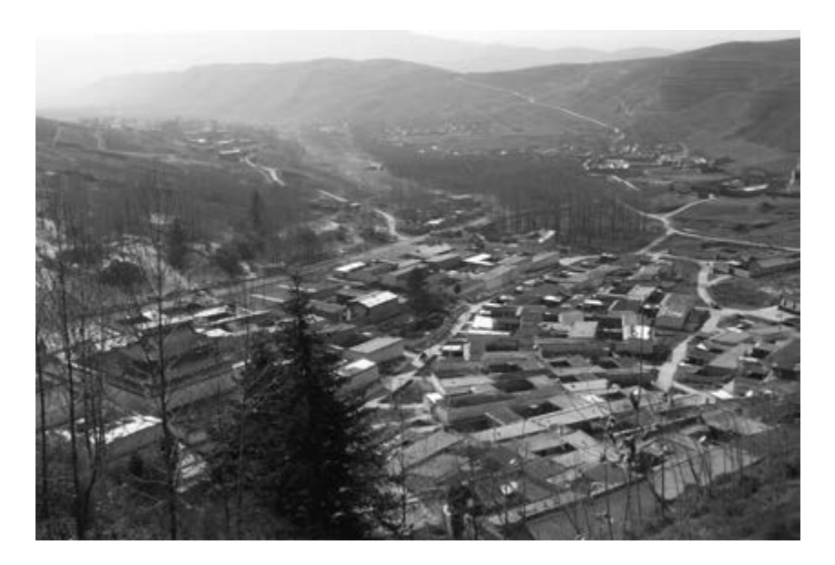
Rgulang Monastery (2010).

Beyond marriage, a second significant venue of plurilingualism was the monastery. This context primarily involved males and, for the most part, did not involve alternating languages according to different stages in the life cycle.<sup>5</sup> Mongghul participation in formal institutions of Tibetan Buddhism was significant. Rgulang Monastery was a large and politically significant institution at the heart of the Seven Valleys and, at its peak, probably housed around 2,000 monks, mostly from the Seven Valleys (Sullivan 2013, 2015).