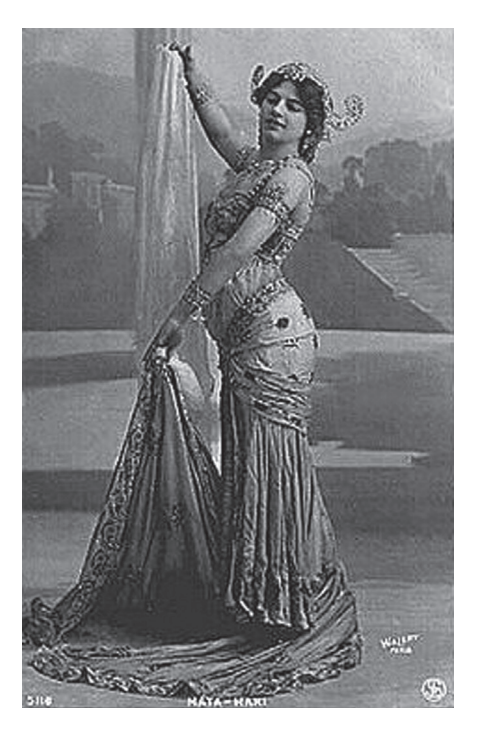
Figure 9.3 Mata Hari, photograph c. 1910. Picture from Kitty's collection. Digital inkjet print, 10" x 8".