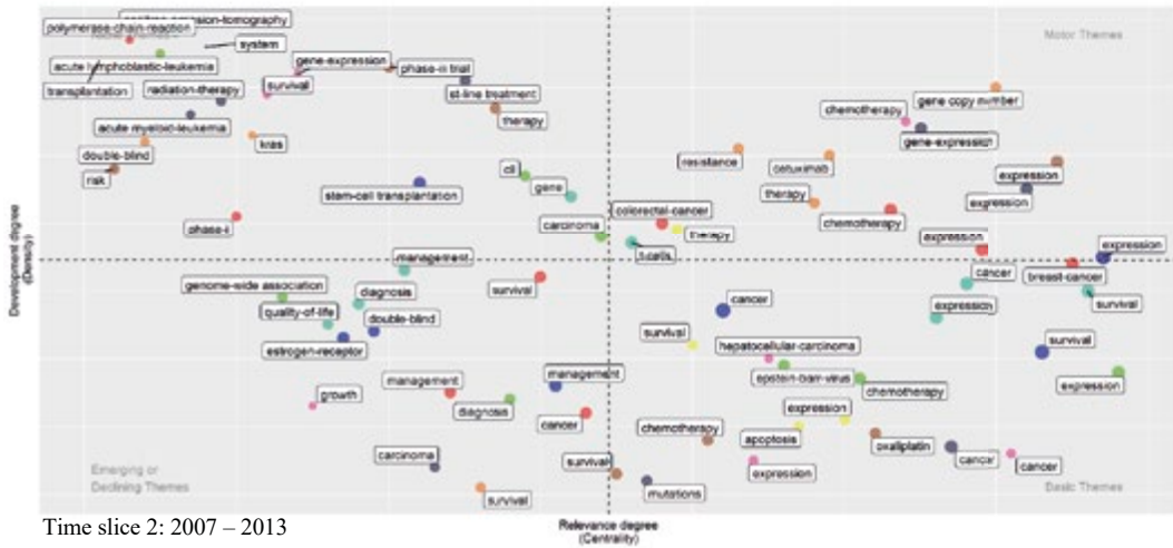
Time slice 2: 2007 – 2013