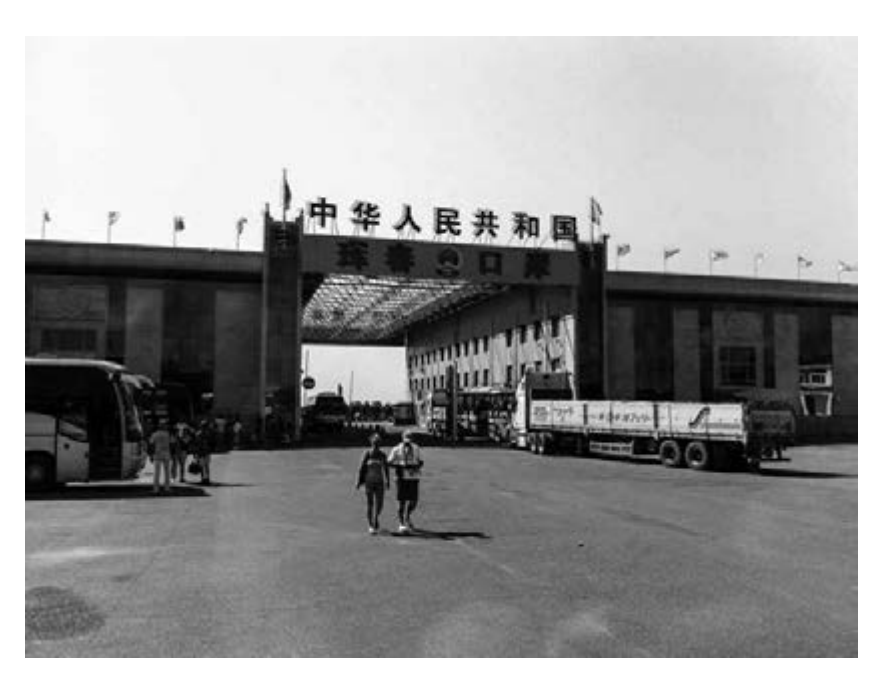
Figure 5 The border crossing at Hunchun-Kraskino