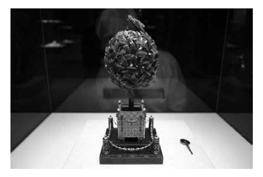
Figure 15 Carl Fabergé's Easter egg, made predominantly of jade from a private collection of Viktor Vekselberg, the fourth richest person in Russia. The object is on display at special private museum in Saint-Petersburg, Russia

was part of an elitist lifestyle and jade was never reconfigured as a Russian stone in a democratic sense: it did not become popular or recognizable, and no artisan craft arose to work the stone into objects of value. This situation was in some ways similar to the heyday of jade in Chinese history, when only the members of royal family and those close to it were permitted to own jade. Even though jade objects like imperial eggs are of Russian origin, their price now is determined at auctions abroad, and foreign experts play important roles in the process. In this respect Russian buyers are similar to Chinese ones: they buy these objects because of the emotional ties they feel towards them.