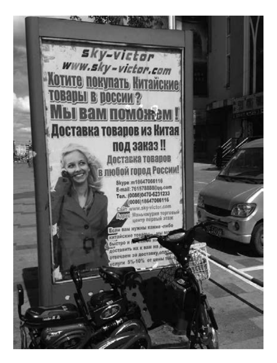
Figure 17 Advertisement for a company offering help with on-line purchases in Manzhouli, China

to the brothers' invention (i.e. they are mediators between Russian purchasers and the Chinese bazaar), but some are more similar to the technical architecture of Taobao itself. For example, the company 'Russian Bridge' simultaneously offers online shopping on Taobao and other means and