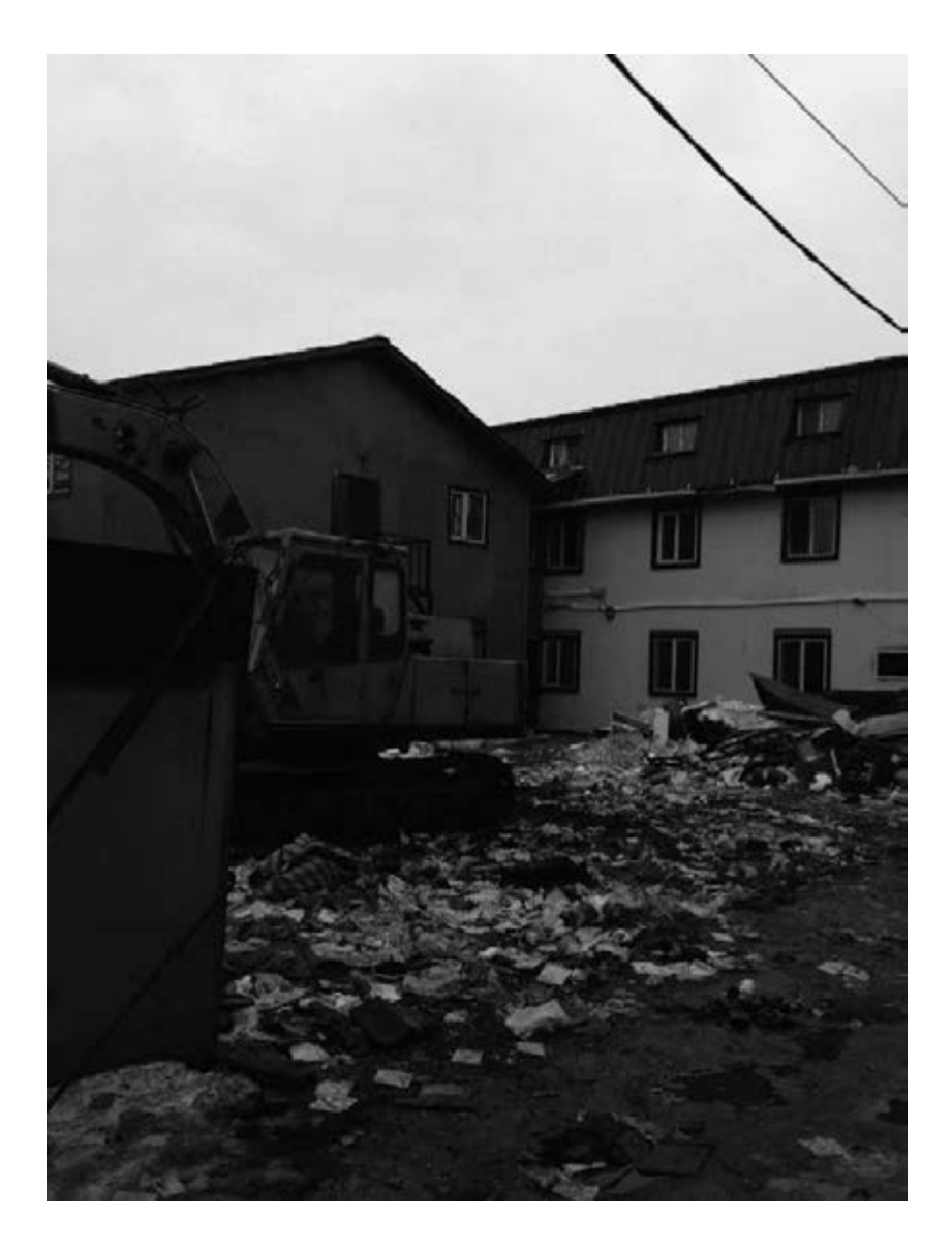
Figure 9 Chinese market in Ussuriisk, 2016

Earlier, it had been the precarious balance of the mutuality of two parties across the border that had enabled the frontier market economy to be sustained and flourish. In accounting for what happened next, it is useful to refer to Gellner. According to him (1988, 143), it is often the state 'that destroys trust', replacing the delicate equilibrium of social cohesion with