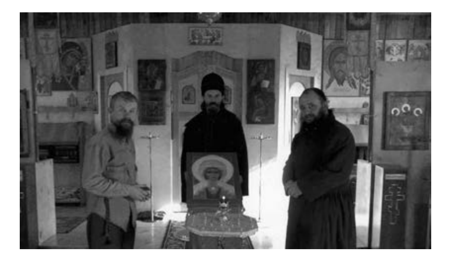
Figure 11 A s"ezd ('congress') of Far Eastern Old Believers in the mid-1990s held in Bolshoi Kamen'