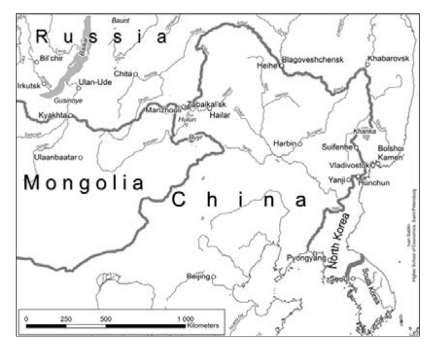
Figure 1 Map of north-eastern Russia-China borderland