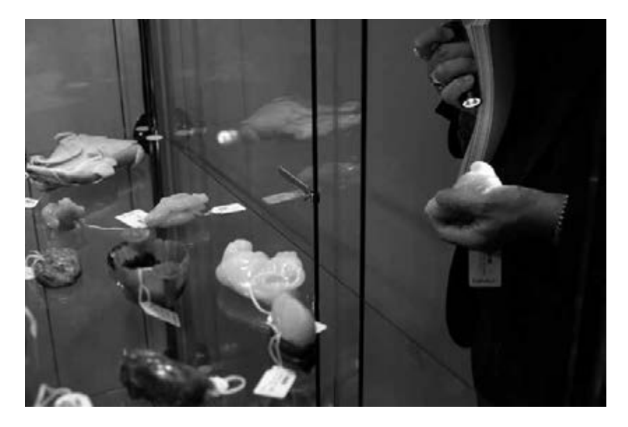
Figure 14 Chinese buyers scrupulously explore an old Chinese object put on sale at Sotheby's auction house in London, UK

auction houses such as Christie's, Sotheby's, and Bonhams (see Figure 14). There are various scientific procedures that can help estimate whether a jade object is authentic, but there are several obstacles to this, so no analysis can provide absolute certainty.<sup>3</sup> Recently produced fakes are the easiest to detect, because the activity embodies the contextual features of its time: a different attitude to the speed of production and stone quality.<sup>4</sup> Experts and object retailers are usually more educated and experienced than forgers and can detect what shapes and patterns refer to which periods. Forgers often replicate objects that they have never seen in real life, guided only by illustrations. Sometimes they wrongly interpret these illustrations and