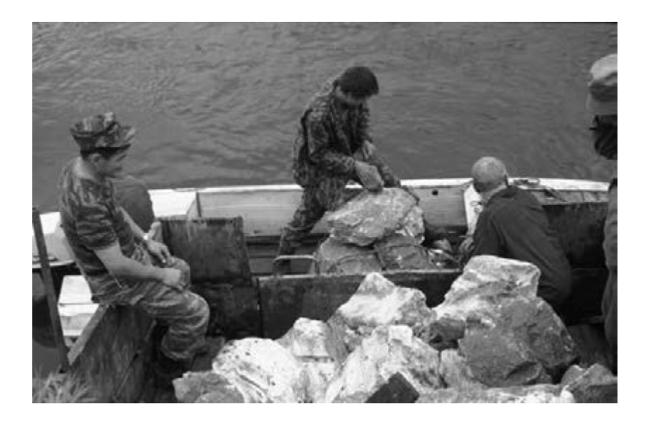
Figure 16 One of the Sunshine's operations. Guards reload raw jade to transport it across a river. Jade is on its way from mine to warehouse

through the reindeer farm, which was simultaneously used as a storage place, watch post, and canteen. All of these changes were also very much in favour of the reindeer herders, who had often suffered from the lack of supplies before.