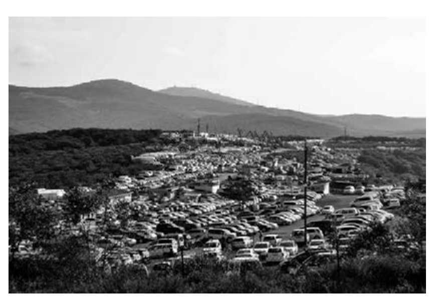
Figure 6 The 'Green Corner' market for used Japanese cars, Vladivostok

The first event took place in 2008, when Vladivostok witnessed one of the largest public demonstrations since the dissolution of the Soviet Union. 40,000 people amassed on the streets, holding anti-Putin placards for the first time, to protest the newly introduced customs duties on the import of used Japanese cars. The port city still houses one of the largest open-air used car markets in Russia. Locally known as 'Green Corner' and perched on a series of hilltops above the city, the market operates as a central hub for customers from across the Russian Far East and Siberia. For years, this business represented one of the main staples of Vladivostok and Primorsky Krai, with tens of thousands of people directly and indirectly involved (Kalachinsky 2010, 3). In response to the new taxes, the local anger and resentment spilled over. Not trusting the local police, Moscow had to send