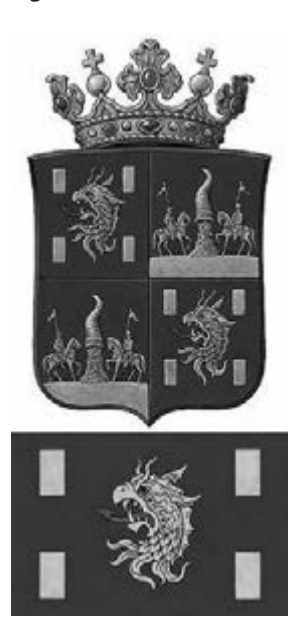
Figure 2 The Coat of Arms and official flag of Kyakhta, Russia

this is not just a head of a dragon: as an 1861 document states, it was meant to depict 'a severed head ( otorvannaya golova ) with red eyes and red tongue';<sup>9</sup> when the dragon as a whole signified China itself. The same symbol of the guillotined dragon became the official flag of Kyakhta town, which is still in use.<sup>10</sup> It should be noted that a beheaded and vanquished dragon is one of the most popular motifs of Russian orthodox iconography, depicting Saint George's victory over pagans. Indeed, the newly established border was perceived by Russians as the front line of the confrontation between European Christianity and Asian pagans. Perhaps this is one reason why Kyakhta was so rich in large Orthodox churches; it has the most outstanding and impressive ecclesiastical architecture in all of Asiatic Russia east of the Urals. The largest and most monumental, the Church of the Resurrection ( Voskreseniya ),<sup>11</sup> was built just a few meters from the border next to the