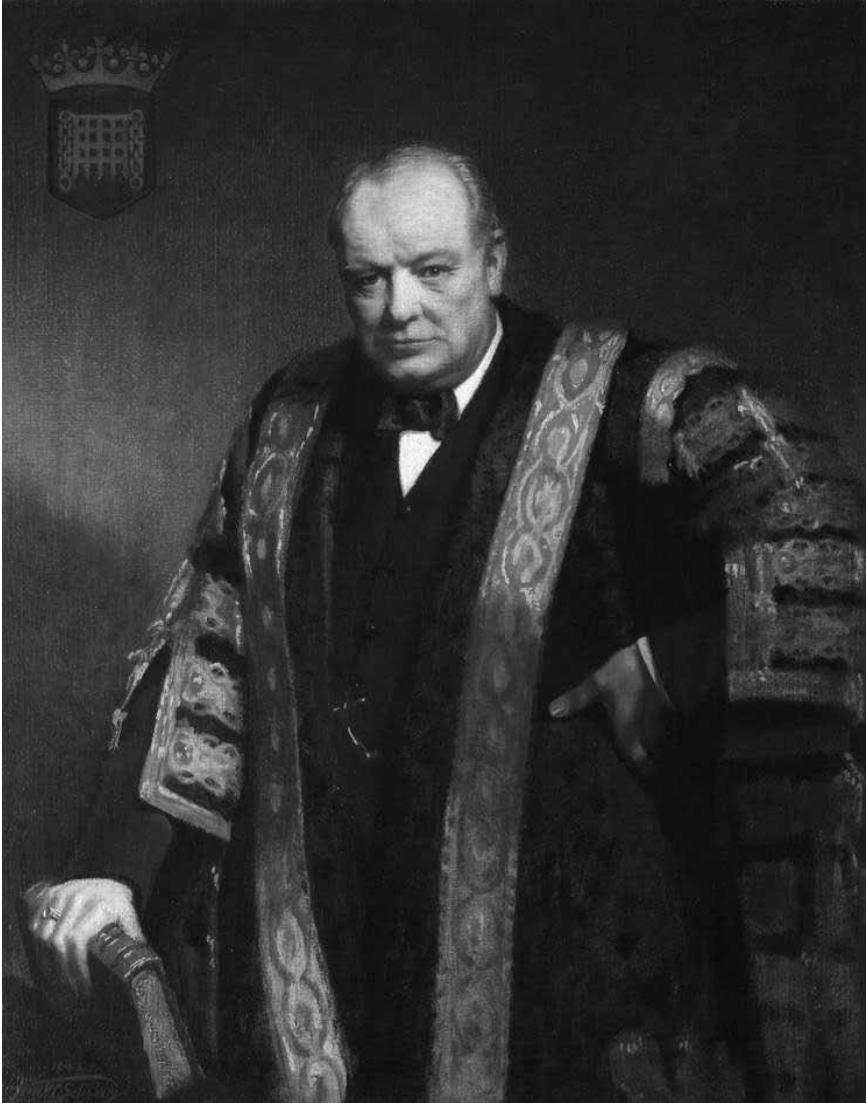
Figure 16. Churchill in his Chancellor's robes, painted by Sir Frank Salisbury, c.1943.