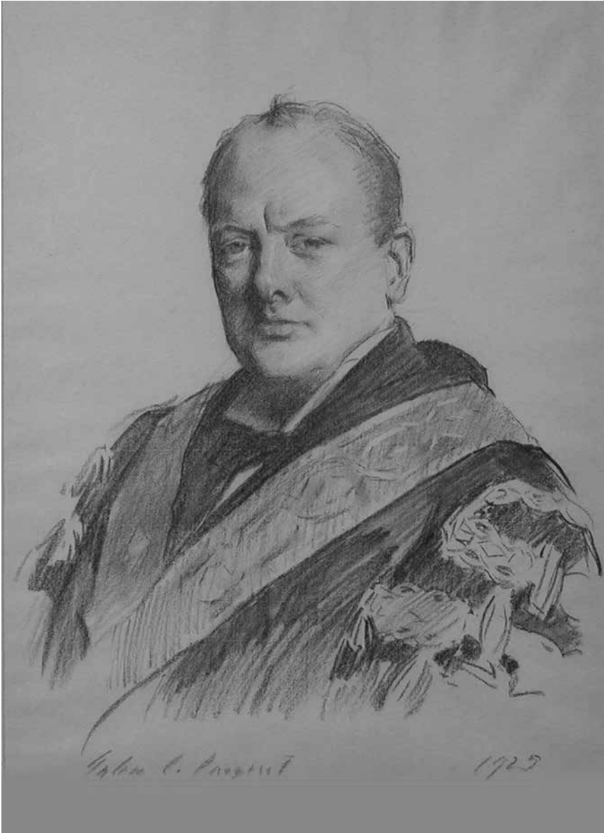
Figure 2. Churchill wearing his robes as Chancellor of the Exchequer, drawn by John Singer Sargent, c.1925.