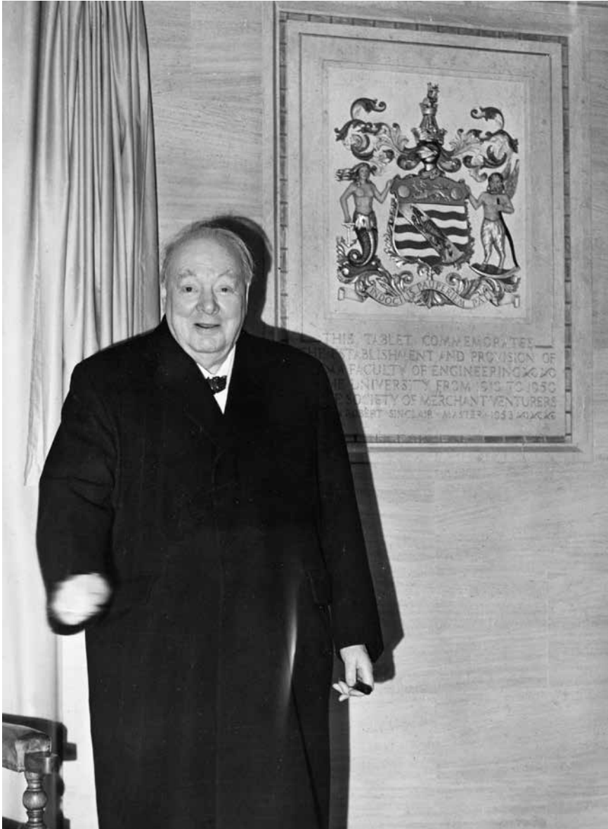
Figure 15. Churchill unveiling a plaque in the Queen's Building, November 1954.