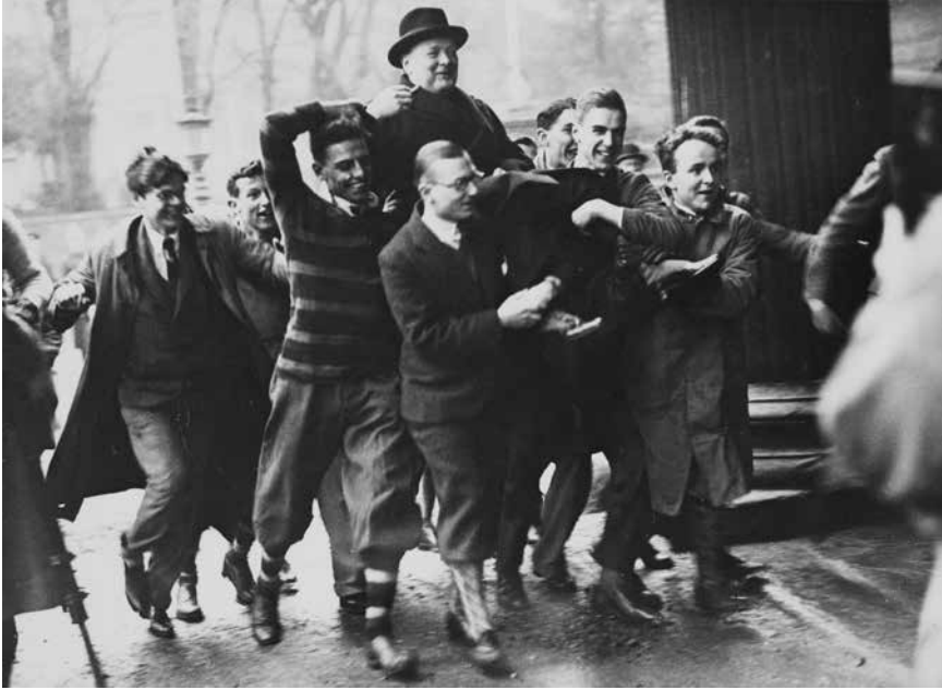
Figure 4. Churchill borne shoulder-high by undergraduates on his first visit to Bristol as Chancellor, December 1929.

when the ‘challenges’ and ‘responsibilities’ facing the University of Bristol’s new graduates might indeed be balanced by possibilities and opportunities. But during the next few years, as the Wall Street Crash morphed into the global Great Depression, the ‘opportunities’ of which Churchill had spoken at the time of his installation would rapidly diminish and effectively disappear, which meant that for many young people, Bristol graduates included, the 1930s would offer little prospect except unemployment for most of the decade, followed by compulsory wartime military service at the very end of it. Thus regarded, 1929 was not only a significant and conjoined year in Churchill’s biography and in the history of the University of Bristol: it was also the year in which the attempt to put the clock back to the pre-1914 world of European and global stability, based on the Gold Standard, was effectively given up. 13 Although he could not have known it at the time, Churchill was not only assuming the Chancellorship of the University when his own political career seemed to be winding down: he was also taking it on as one of the most dismal and disorienting decades of the twentieth century