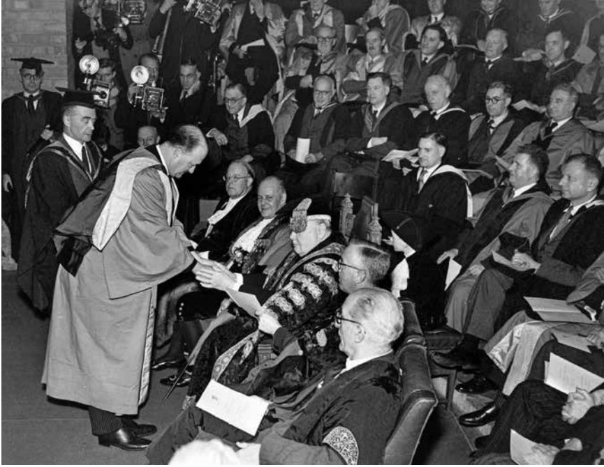
Figure 14. Churchill conferring an honorary degree on R. A. Butler during his last visit as Chancellor, November 1954.