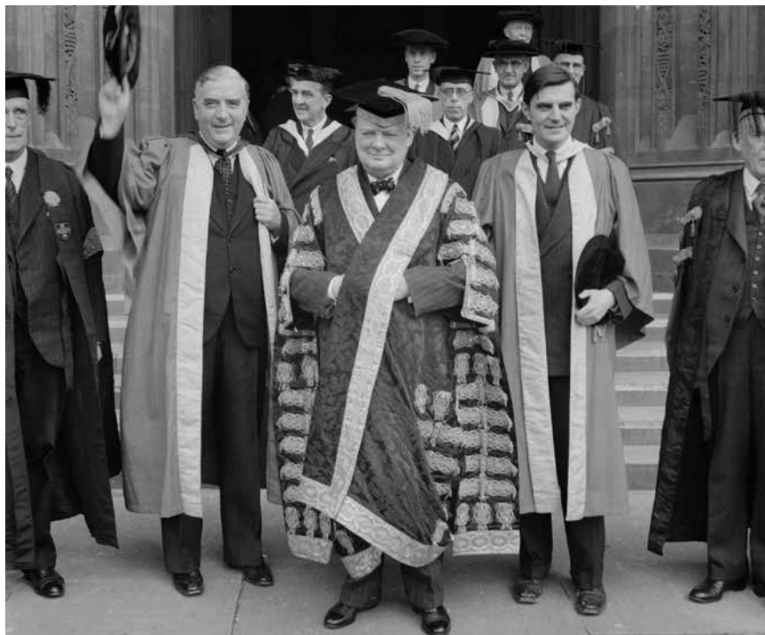
Figure 7. The Chancellor with Robert Menzies and Gil Winant, having conferred honorary degrees on them, April 1941