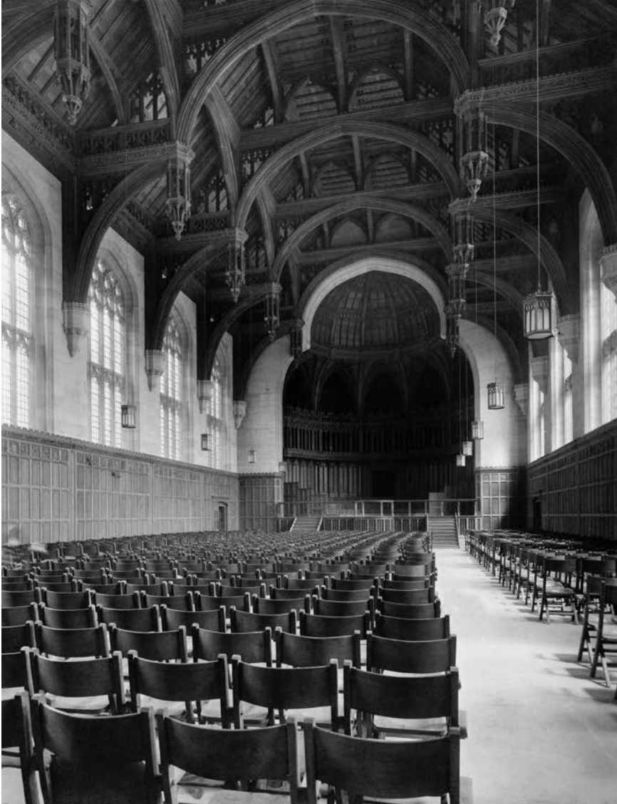
Figure 5. The Great Hall of the Wills Memorial Building before bomb damage.