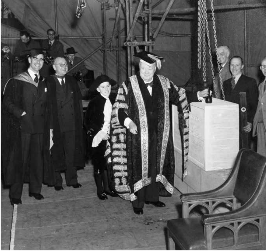
Figure 13. The Chancellor laying the foundation stone of the Queen's Building, December 1951.

the new government to concern itself with', but he also insisted that this was an 'all party occasion'. There were, he noted, fifty million people in Britain, who 'have got to earn their livings and they have got to purchase two fifths of the food they are not able to grow'. But the great advantage the country possessed was its unique, three-fold involvement with the wider world: with the Commonwealth and Empire, with the United States, and with Europe. Once again, Churchill recalled his wartime visit of 1941, and thanked Lord Dulverton (another member of the Wills family) for his donation towards the cost of the restoration of the Wills Memorial Building. 6 Thereafter, he laid the foundation stone of the new engineering block, a task for which he