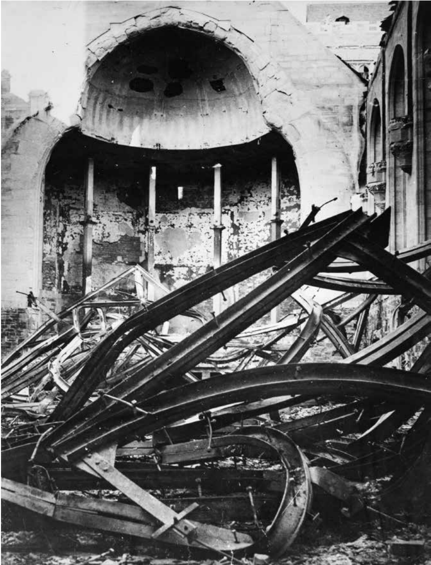
Figure 6. The Great Hall after bomb damage in December 1940.