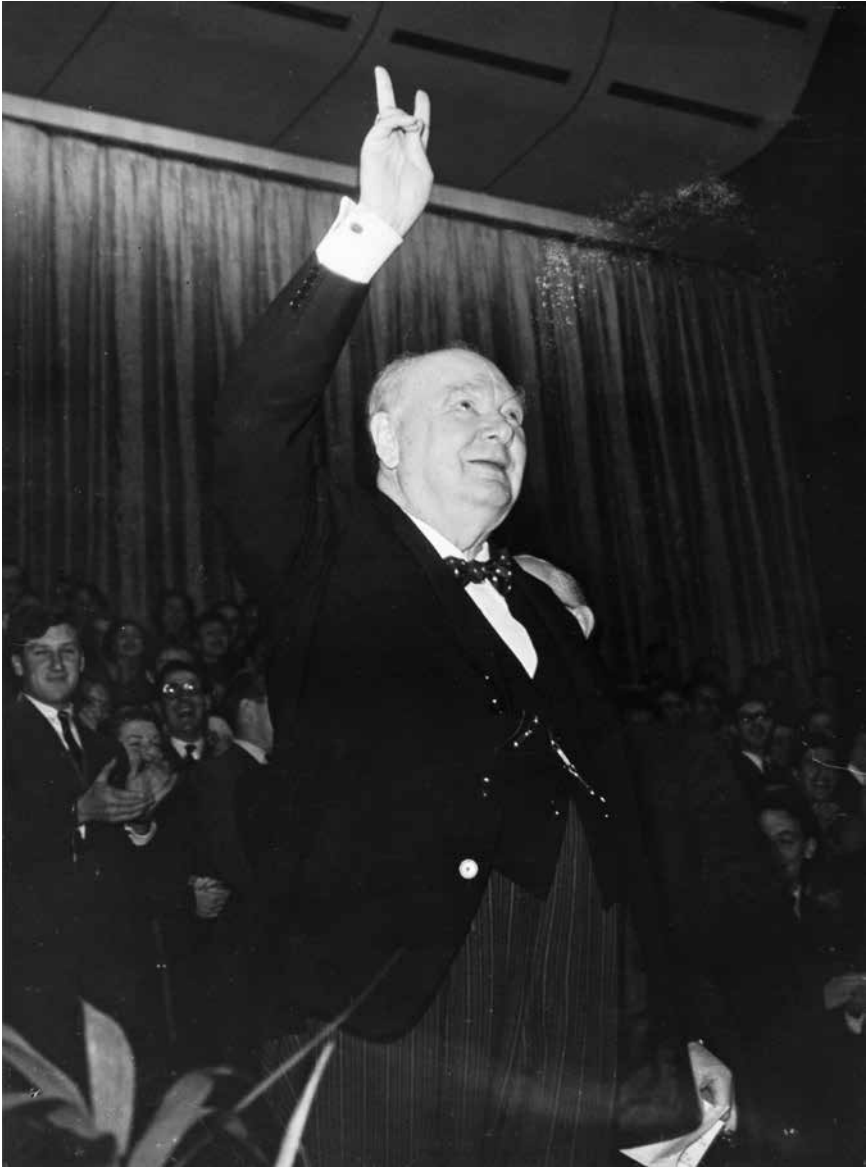
Figure 12. Churchill after addressing students in Colston Hall, November 1954.