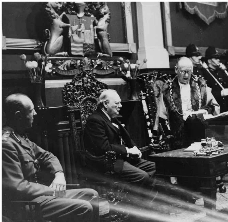
Figure 8. Churchill receiving the Freedom of Bristol at the Council Chambers, April 1945.

twenty years, retiring the year after Churchill's death. 17