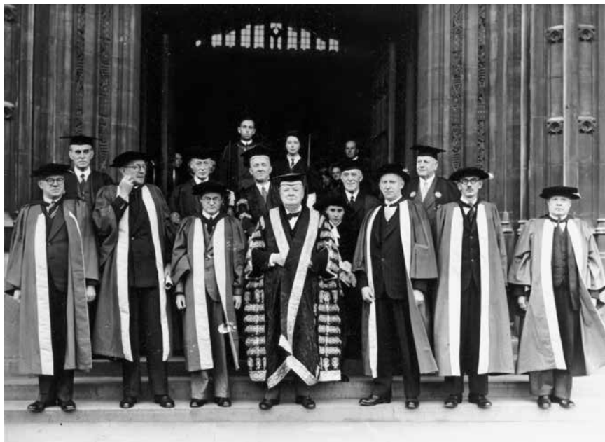
Figure 11. The Chancellor with leading figures from the universities of the British Empire and Commonwealth, having conferred honorary degrees on them, July 1948.

to you and their appreciation of all the trouble you took to come and meet and address them'. 12