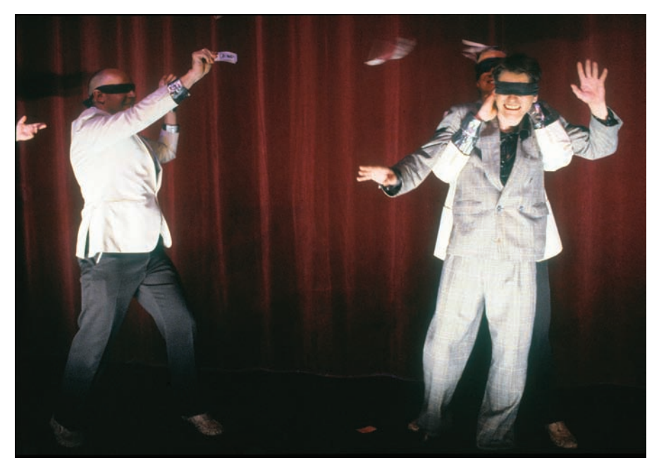
Figure 4. Fortune-telling scene, First Night , by Forced Entertainment, The Place, 2001.

sure. This much we can agree on, as we look back on the nearly four-decade history of this iconic experimental group, which began making theater in Sheffield in 1984. First-time spectators, who may have expected to watch the show in the comfortable privacy of a darkened seat, may find themselves suddenly and unnervingly in the spotlight. Indecorous by mainstream theater standards, the group's methods have understandably divided critics. While some have praised their work for "investigating a new political ethics in the dying days of [the twentieth] century,"<sup>2</sup> others have described it as indulging in a futile postmodern play with signifiers that turns others' pain into spectacle.<sup>3</sup> At issue, for both their admirers and for skeptics, is Forced Entertainment's definition of political theater. As Tim Etchells, the group's artistic director, wrote in 1999,