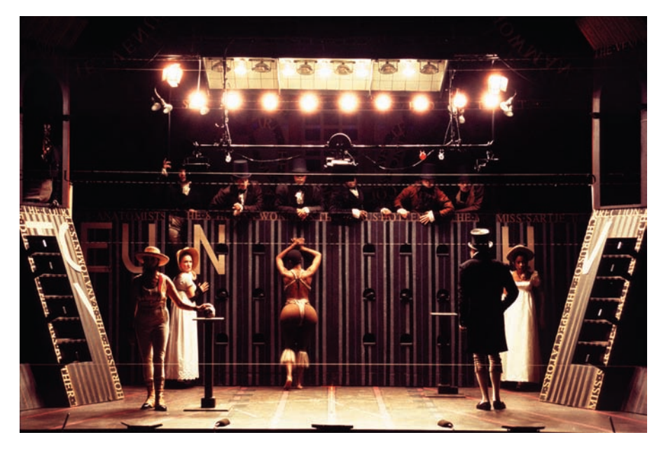
Figure 1. The Venus Hottentot, the Chorus of the Anatomists, and the Chorus of the Spectators. Scene from Venus, by Suzan-Lori Parks, directed by Richard Foreman.