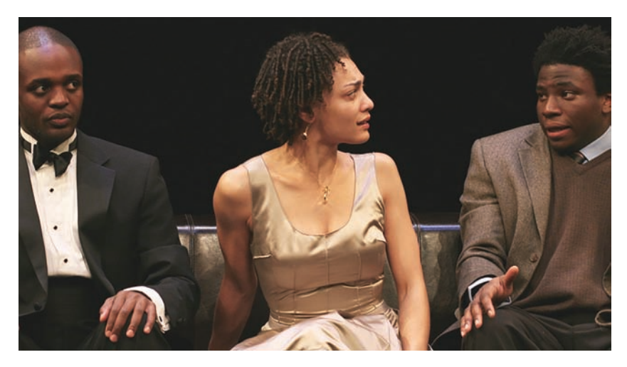
Figure 8. Scene from The Shipment , by Young Jean Lee, The Kitchen , 2009.

suave Tomasina (Workman), who, Thomas callously reveals, suffers from incontinence. None of the characters appears capable of forming lasting relationships, and even a party seems to tax their psychological endurance. One can imagine them looking at Albee's dysfunctional couples with wistful yearning.