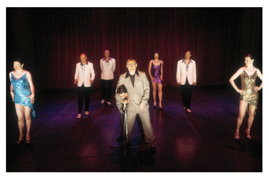
Figure 3. Opening scene of First Night , by Forced Entertainment, at The Place, 2001.

Somewhere in the back . . . I sense a deep well of bitterness and despair. Somewhere in the front, I sense joy and happiness. Somewhere in the middle, there is an overwhelming sense of indifference.