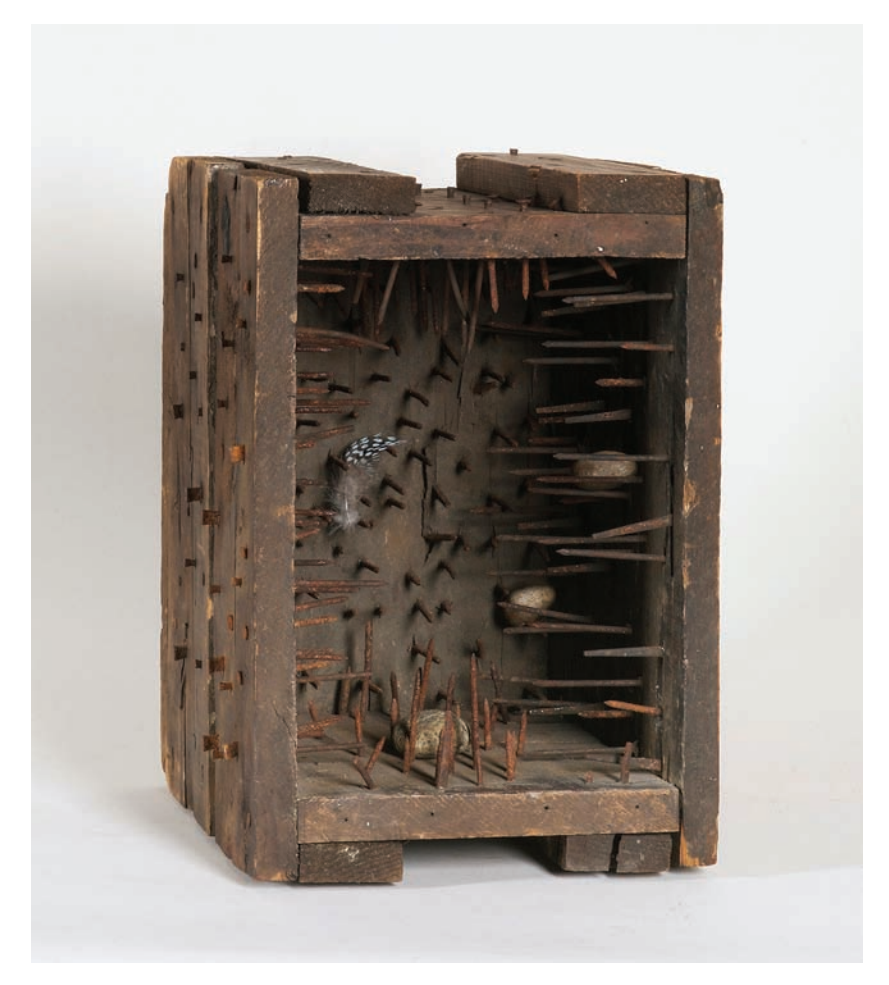
Figure 5. Robert Rauschenberg, Music Box (Elemental Sculpture) , ca. 1955. Wood crate with traces of metallic paint, nails, three unattached stones, and feathers, 11 x 7 1/2 x 9 1/4 inches (27.9 x 19.1 x 23.5 cm). Collection of Jasper Johns. ©Robert Rauschenberg Foundation. RRF Registration# 53.027.

(ca. 1955) (whose protruding spikes also suggest the Procrustean bed), as representative examples of this aesthetic. First Night signals the same preoccupation with torturous manipulation through the mandate to consume in its final scene, where Robin, unable to escape his victimhood status, gets stuck into a rectangular, box-like shopping bag with only his head visible at the top.