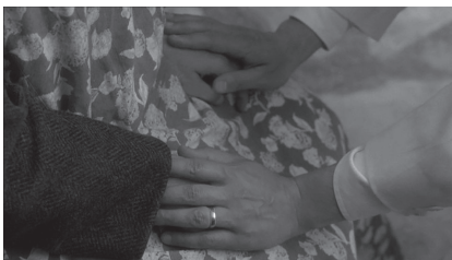
Figure 4.2 The photographer touching Gorky’s mother’s hands in Ararat (dir. Atom Egoyan; from Miramax, 2002).