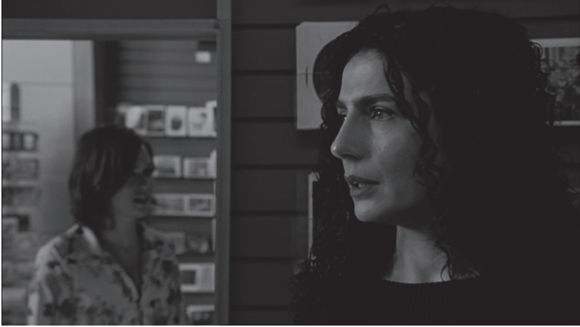
Figure 4.4 Ararat (dir. Atom Egoyan; from Miramax, 2002). Ani is challenged by Celia, about her father's death.

located, the images visible to the spectator as well as to David serve neither to prove nor to disprove his story.