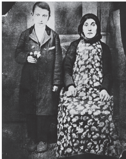
Figure 4.1 A photograph of the painter, Arshile Gorky, and his mother, in Van, 1912. Uncredited. The painting based on this photograph can be viewed at the Whitney Museum website: http://collection.whitney.org/object/2171 .

Laura Marks, when discussing the ways in which intercultural cinema communicates embodied knowledge, asserts that “cinema itself appeals to contact—to embodied knowledge, and to sense of touch in particular—in order to recreate memories” (Marks 2000: 129). She calls these images “haptic images,” images that create a visual experience that asks the eyes to temporarily function as organs of touch. 13 These images suspend an unproblematic engagement with the narrative, and asking for an engagement which forces the spectator to relate to his/her own knowledge and memory in addition to the knowledge (re)presented on the screen. Moreover, “haptic visuality, in its efforts to touch the image, may represent the difficulty of remembering the loved one, be it a person or a homeland” (Marks 2000: 193), and it is precisely this difficulty, the difficulty of remembering a loved one, no matter how many photographs and