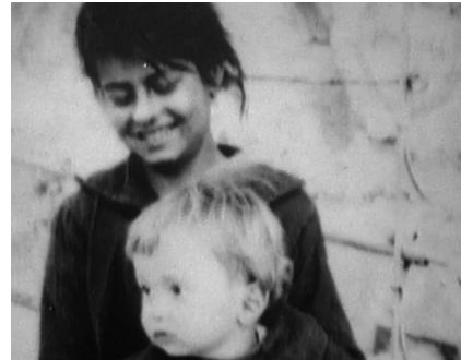
Figure 3.2 Waiting for the Clouds (dir. Yeşim Ustaoglu, from Silkroad Productions, 2003). The closing image.