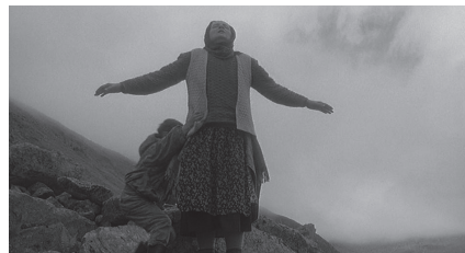
Figure 3.4 Waiting for the Clouds (dir. Yeşim Ustaoglu, from Silkroad Productions, 2003). Ayşe/Eleni experiencing a flashback.