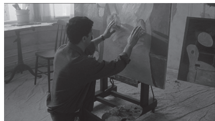
Figure 4.3 Gorky touching his mother’s painted hands in Ararat (dir. Atom Egoyan; from Miramax, 2002).