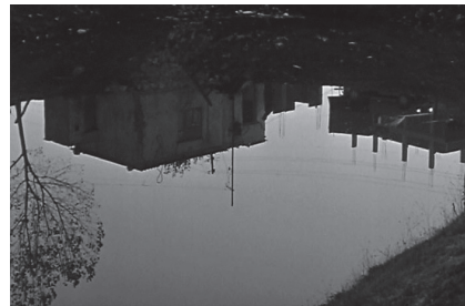
Figure 5.3 Journey to the Sun (dir. Yeşim Ustaoglu; IFR Production, released 1999). The house reflected on water.