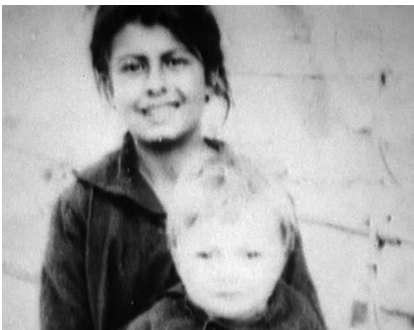
Figure 3.1 Waiting for the Clouds (dir. Yeşim Ustaoglu, from Silkroad Productions, 2003). The opening image.

A striking example of this occurs when the census takes place, which allows the audience to find out about Ayşe's/Eleni's identity very early on in the film. In this early sequence, the television news (which plays an important role throughout the film) informs both the citizens of Turkey at the time, and the audience of the film, about the census that will determine statistics on language and religion (it also happens to be the first census that includes questions on these issues). When the census officials arrive, they ask questions about Ayşe's/Eleni's “identity,” such as her family name, and so on. These questions, seemingly insignificant, cause a momentary silence to fall between her and her sister. Ayşe's/Eleni's answers to these questions are based on what is written on her official identity card, rather than what is reality. Although this sequence supplies