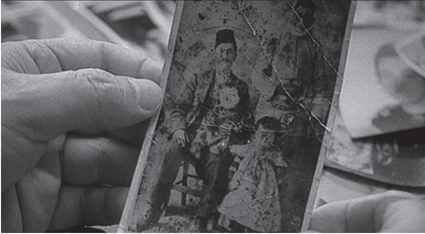
Figure 3.5 Waiting for the Clouds (dir. Yeşim Ustaoglu, from Silkroad Productions, 2003). Nico and Eleni together as children.

reminiscent of Benjamin's Jetztzeit , in which the image of the past creates recognition in the present. What is also remarkable here is how photographs are used to mark the narrative time. While the film itself is perceived as representing the present, photographs come to represent the past. Interestingly enough this tendency can be found in many films dealing with characters who have experienced a personal loss and developed a feeling of nostalgia. As nostalgia is longing for a specific time, the nostalgic usually hangs on to a photograph, which is frequently a picture of a person or a place. What these photographs are representing is, in fact, a time that is captured in the form of a photograph, a slice of the past that the nostalgic is longing for: a picture of how s/he remembers herself/himself. Peter Wollen writes that still photographs "cannot be seen as narratives themselves but as elements of narrative" (Wollen 2007: 110). Niko's remark about how the photographs represent his life, his past, is in fact about how he narrates his life through these photographs. However, from a different perspective and with an additional photograph they narrate a different story, that of Ayşe's/Eleni's.