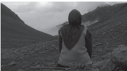
Figure 3.3 Waiting for the Clouds (dir. Yeşim Ustaoglu, from Silkroad Productions, 2003). Ayşe/Eleni in the highlands.

The decision not to recreate these moments of flashback is also in accordance with Ustaoglu's general approach to narrative and how she positions the