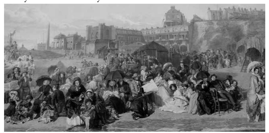
FIGURE 2 C. W. Sharpe, after William Powell Frith, Life at the Seaside , steel engraving on paper, issued by the AUL in 1859, British Museum.

However unenthusiastic the press's critical reaction to the prints, they were evidently a popular and successful aspect of AUL membership. The AUL continued to issue annual engravings to its subscribers until it ceased operation in 1912, adopting new printing technologies such as chromolithographs and Goupil gravures to keep pace with changing expectations about and the increasing availability of reproduced images. By the mid-1840s, the AUL had abandoned its attempts to choose a picture, commission, and distribute a print in under a year and instead selected images for reproduction several years in advance. This alleviated many of the time pressures incumbent on the engraver and in many cases resulted in images that were far more detailed and carefully executed than the earliest prints had been. Engravings such as C. W. Sharpe's Life at the Seaside (fig. 2), which was issued to the AUL's subscribers in 1859, are truly impressive examples of mid-nineteenth-century printmaking. Irrespective of the artistic merits of the annual engravings, however, the guarantee of subscribers receiving a print in exchange for their membership fee secured the idea that the art unions provided something more than a simple lottery gamble. By the middle of the nineteenth century, the major art unions had established themselves as a legitimate cultural activity, whose lottery element was merely one facet of their activities.