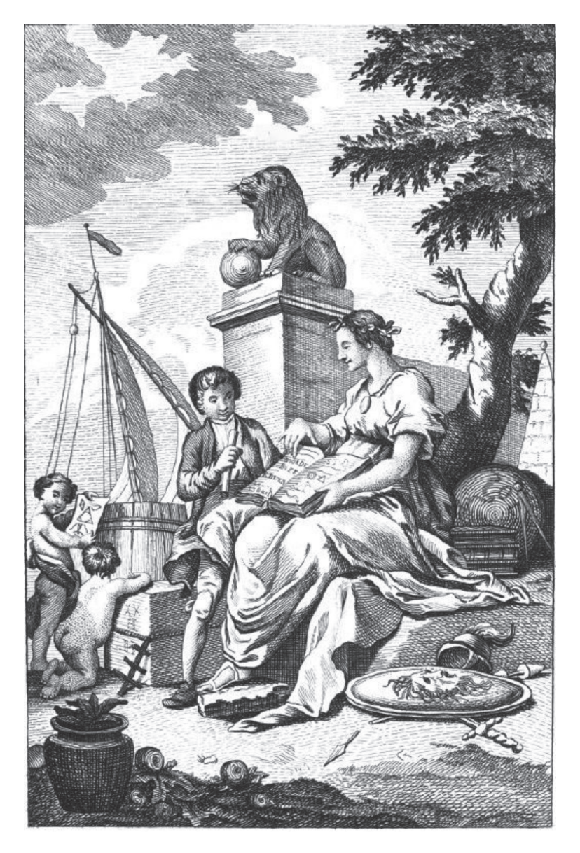
3.3. Frontispiece of Buys's Nieuw en Volkomen Woordenboek . engraving, artist unknown. De Digitale Bibliotheek voor de Nederlandse Letteren (DBNL): www.dbnl.org/tekst/buys003nieu01_01/index.php.