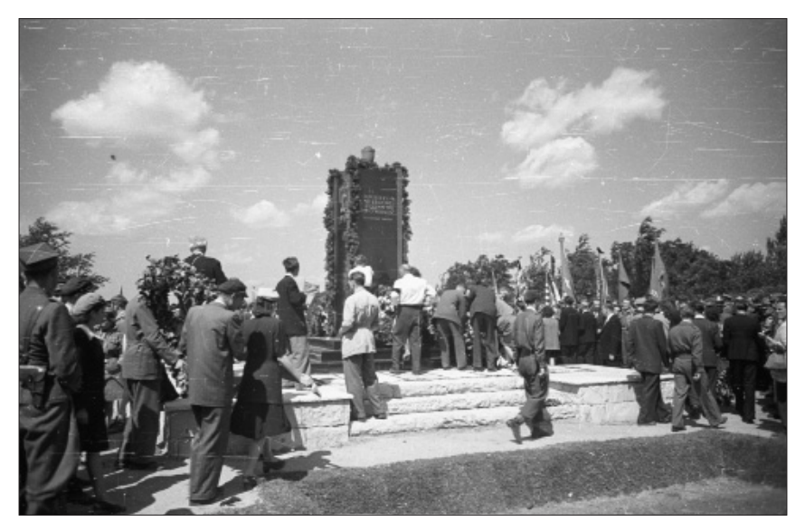
2.6 Unveiling of the 'Gloria Victis' Memorial dedicated to the Home Army, the second anniversary of the Warsaw Uprising, Powązki Military Cemetery, Warsaw, 1 August 1946.