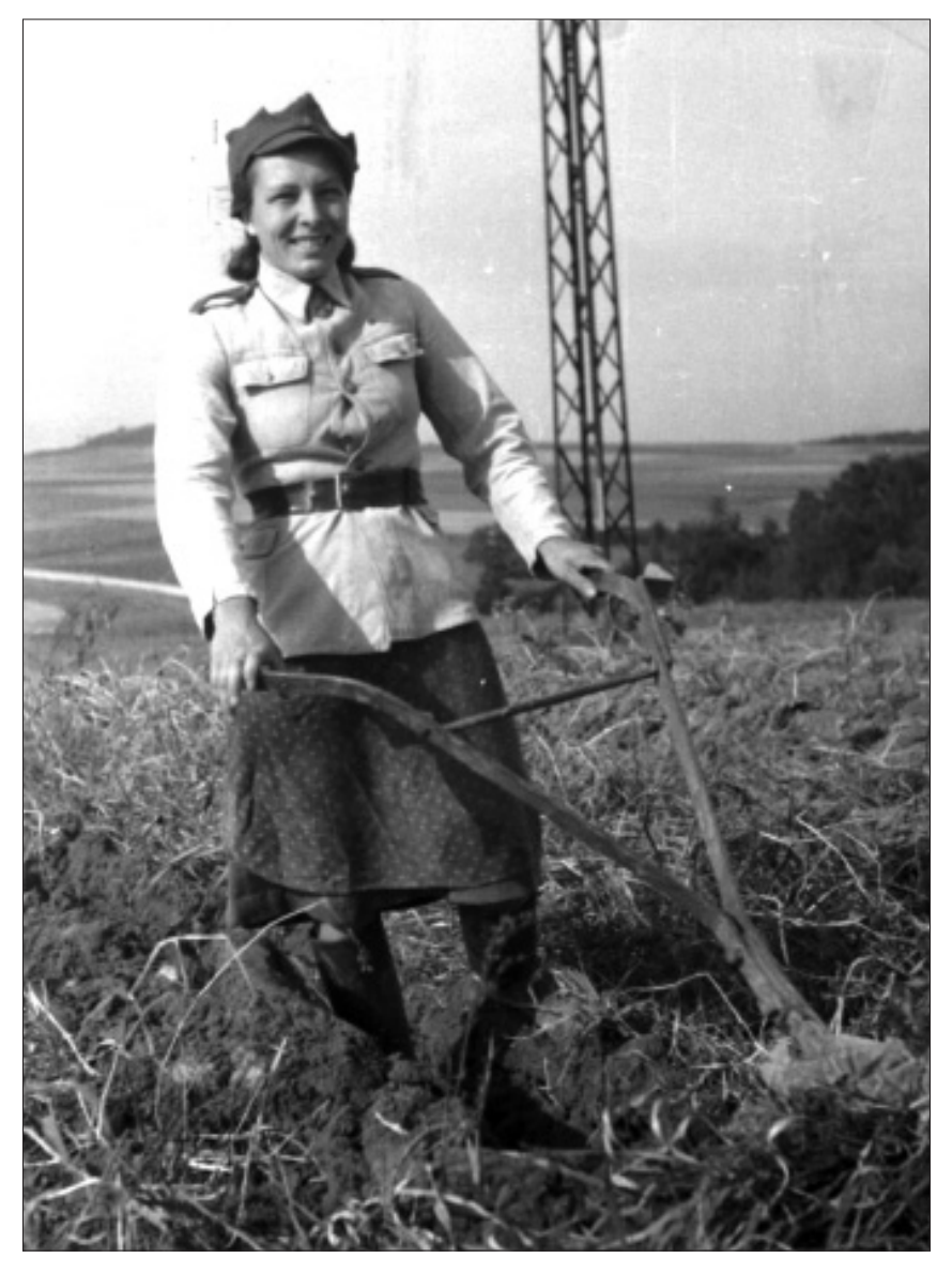
2.7 Propaganda picture of a former soldier of a female brigade of Polish Armed Forces ploughing the post-German territories, Platerowo, 1946.

Joanna Wawrzyniak - 978-3-653-99681-4 Downloaded from PubFactory at 01/11/2019 11:05:35AM via free access