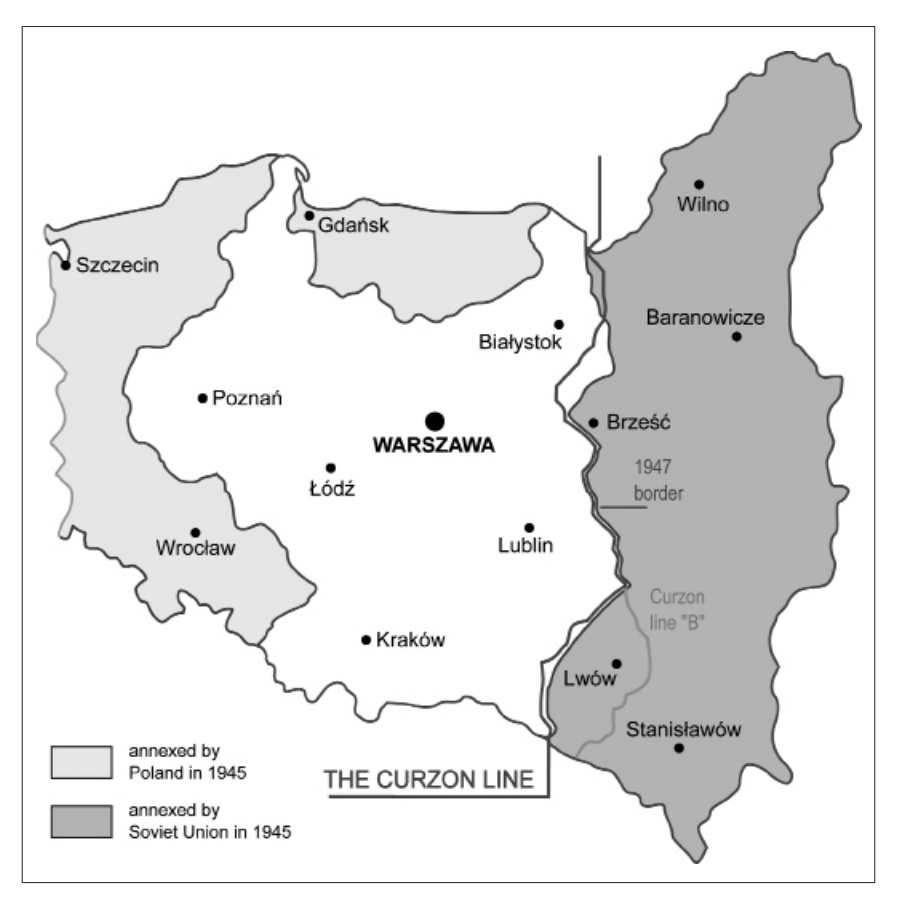
2.1 Map of post-war shifts of borders. Wikimedia Commons.