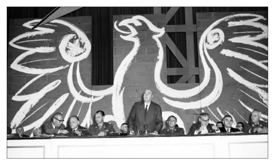
4.3 Second Congress of ZBoWiD, a view of the presidium: Józef Cyrankiewicz is addressing the audience; to his right: Janusz Zarzycki. Palace of Culture and Science, Warsaw, 1959.

The Congress took place on 1-3 September 1959, similarly to the Unification Congress, i.e. on the anniversary of the invasion of Poland by Nazi Germany.<sup>133</sup> However, this time it was not commemorated as a defeat, but as the beginning of a successful struggle for independence. The official event poster and the iconography of the presidium contained the national symbol, the white eagle, and the words 'the Polish people were victorious'. Three exhibitions added to the ideological packaging of the Congress. The biggest, on the main square in front of the Palace of Culture and Science, was entitled 'Poland under Hitlerite Occupation' and showed war crimes against the civilian population and the activities of the resistance movement. It also reminded viewers that there were still Nazi criminals at large in the FRG. ZBoWiD published an album to accompany the exhibition, bearing the title 'We Remember' and featuring similar material. The Museum of the Polish Armed Forces in Warsaw had a display which recounted the history of 'the September Campaign', whilst the International Press and Book Club ran an exhibition on the history of Warsaw in the years 1939-45. A Resistance Movement Film Week complemented the Congress, and anti-war demonstrations were held