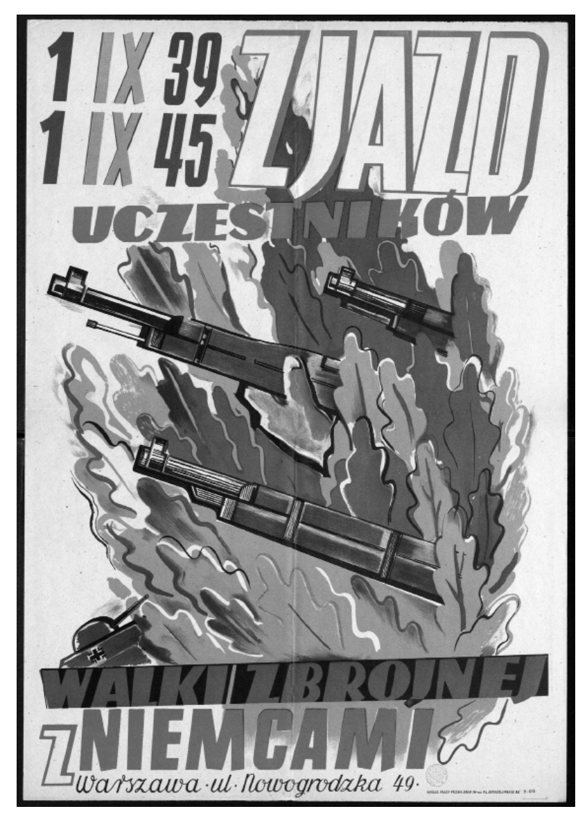
2.2 Poster of the Congress of ZUWZoNiD in Warsaw, 1945. National Library of Poland.

vectors of memory were in dynamic relation to each other, with the politicians reacting to the initiative of the masses and vice versa.