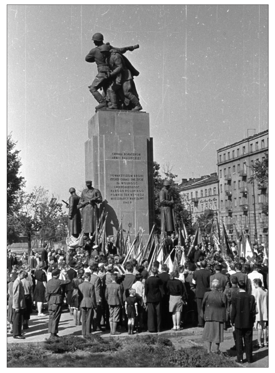
3.1 Ceremony at the Monument to Brotherhood in Arms, on the fourth anniversary of the liberation of Warsaw's Praga district. September, 1948, Warsaw.

Joanna Wawrzyniak - 978-3-653-99681-4 Downloaded from PubFactory at 01/11/2019 11:05:35AM via free access