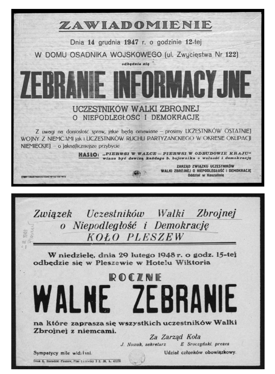
2.8 Announcements of meetings of ZUWZoNiD concerning the planned merger of veteran organizations, 1947/1948. National Library of Poland.