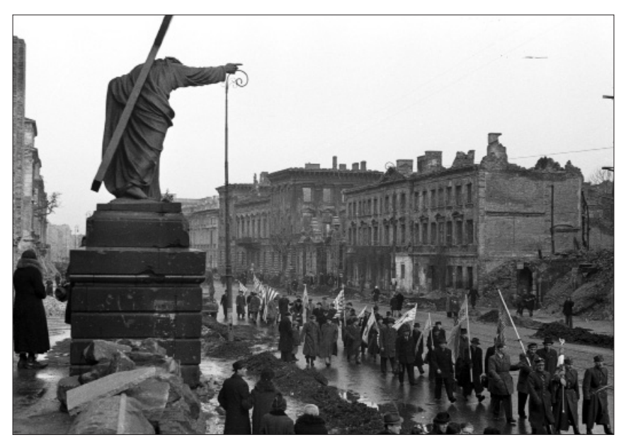
2.5 March organized by Polish Union of Former Political Prisoners, Krakowskie Przedmieście Street, Warsaw, March 1947.

For people returning to Warsaw, the sight of lifeless bodies became something familiar – as quotidian as the sight of ruins or the necessity of finding the means for survival in a destroyed city. Hundreds of descriptions of Warsaw are available in the documentary collections of the Polish Red Cross for 1945, e.g.:<sup>52</sup> 'a grave without a cross, a leg protruding, unidentified. A grave by the stadium covered only by a net, three unburied persons in a pile of tomatoes' (Myśliwiecka Street, March 1945); 'site of execution of 28 people. In the vestibule of a stairwell leading from a courtyard, charred bones and the remains of a person, supposedly a man called Stefan, who lived on the fourth floor of this building, tall, broad-shouldered, a fruit-seller ... In a shop on the corner, covered in rubble, unidentified corpses. In the shop in the courtyard, two corpses, one of them had a prosthesis (stolen)' (17 Grójecka Street); 'the university gardens, left of the gate, the remains of a woman in full decomposition' (7 Browarna Street); 'in the watchman's apartment, the charred remains of a newborn infant lie on the window sill' (5 Skolimowska