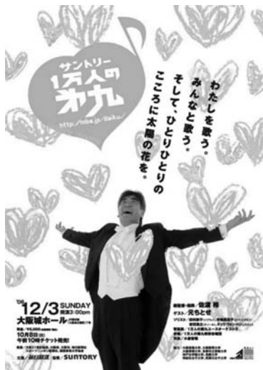
Plate 10.2 Five-thousand-singer daiku in 2008 (KSDUK 2008) [figures in white and those in between are choir singers]