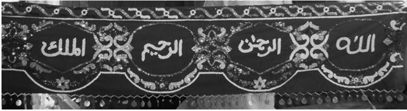
Plate 12.6 Ninety Nine Names of Allah