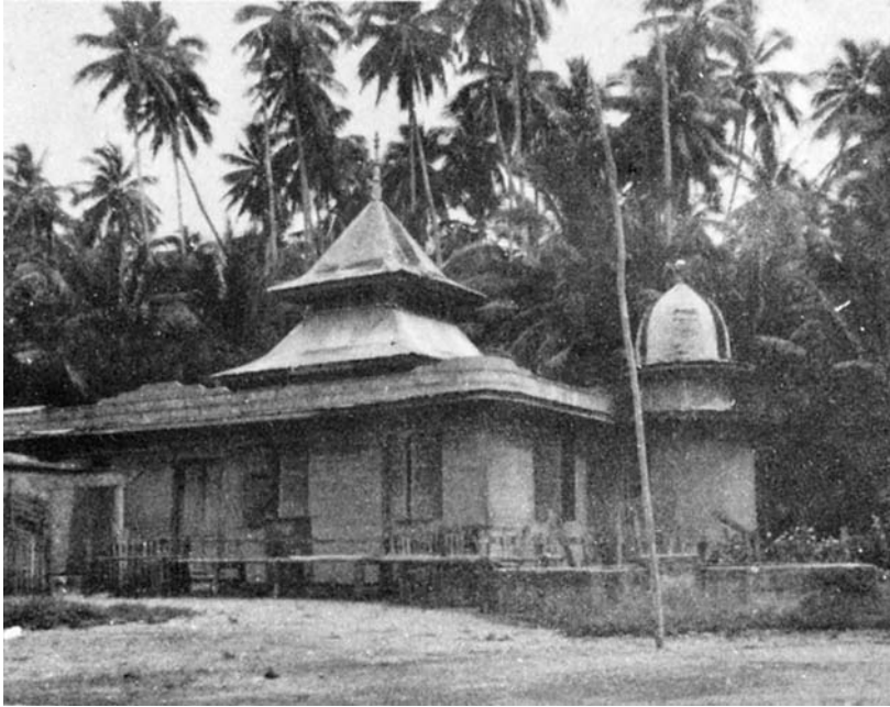
Plate 12.2 Tubig Indangan mosque in the 1960s

The Islamic City of Marawi 18 has the greatest number of mosques in the Philippines. Muslims in this city generally belong to the Maranao ethnic tribe and constitute about 92% of the city's population. Travel brochures boast of Marawi as the Islamic cultural centre of the Philippines. It has many Islamic schools where Arabic, Islam and the Qur'an are taught. The city's Mindanao State University houses the King Faisal Institute of Islamic Studies and the Zayd Ibn Thabit Qur'anic Studies Center. Mindanao State University is a public institution, but the presence of a mosque and the Qur'anic centre visually express the university's Islamic identity in this Islamic city. Most of the mosques in Marawi feature multi-domes and minarets. In keeping with the colours of the mosque of Medina, several mosques are painted white/cream and green, like the Bacolod Grande, Bacolod Chico, King Faisal and Gnassi