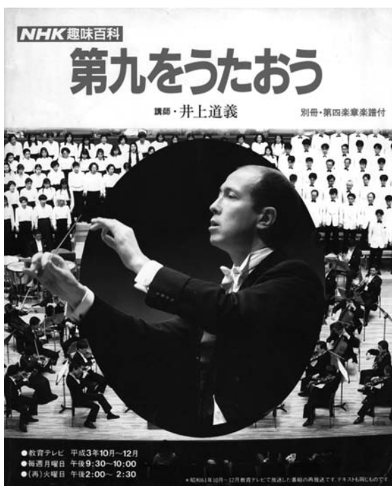
Plate 10.3 NHK's guide to the Ninth : Let's Sing Daiku

The term daiku also features on websites that introduce Japanese seasonal events, such as in Web Japan's NIPPONIA . The no. 34 edition of the web magazine introduced December events in Japan, featuring daiku as a major annual event (Web Japan 2005). 50 Another example is the site Japan Market Intelligence , which provides a report on Christmas time in Japan, describing the Ninth as the 'unofficial seasonal anthem' of Japan. 51 Meanwhile, Trends In Japan , part of Web Japan , goes further to give more details about the amplitude of the phenomenon with its Roll Over Beethoven: Japan Can't Get Enough of the Ode to Joy article in 2000. It is a comprehensive summary for anyone who wishes to get a quick glimpse of the phenomenon (Trends in Japan 2000). Such references to daiku or the Ninth are a clear indication that the phenomenon has become an indispensable socio-cultural element in modern Japan.