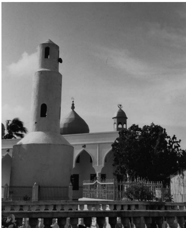
Plate 12.3 Tubig Indangan mosque in 2004

To Maranao Muslims, constructing a mosque is pious work and prominent Muslims feel they have an obligation to build a mosque for the community (Abbahil 1980: 97). Once established, even if largely unfinished, the mosque is not only a constant reminder of the religion 19 but also serves as an anchor for the community and as a symbol of Muslim presence in the area. The mosque is a gendered space. Islam does not require women to go to the mosque, but when they do, they are expected to conform to prescribed gender-based use of mosque space. Men occupy the front section of the prayer area while women are either behind the male congregation or in balconies overlooking the