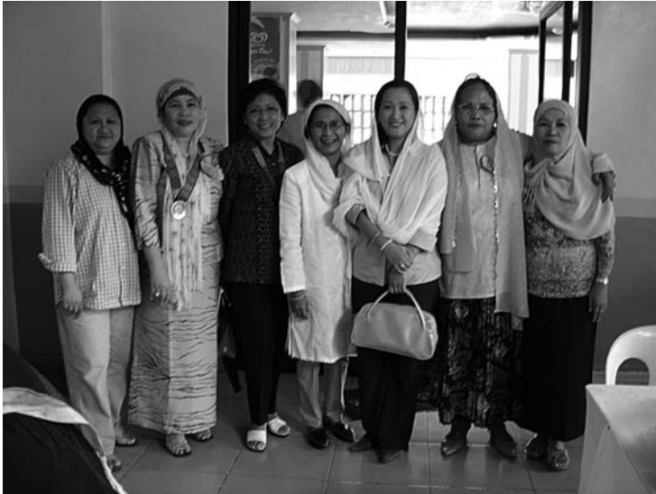
Plate 12.7 BangsaMoro women

The increased use of a head cover in the Philippines was particularly noticeable in the mid-1970s. This was the time when the war in Mindanao was at its height, and Muslims, particularly the Moro National Liberation Front (MNLF), wished to emphasise that the Philippine Muslims had never been colonized. They wanted to assert their separate identity as an independent people who had been oppressed and deprived of their rights in recent times. The MNLF encouraged its women members to wear a head cover and required it during their meetings. An MNLF woman member said that this was a way of asserting their identity as Muslims, and they were inspired in this by the worldwide Islamic resurgence. When President Marcos issued presidential decrees acknowledging Islam as part of Philippine heritage, many MNLF women members felt that the decrees gave long-overdue recognition to Islam and the Muslims. Although the decrees did not really end the conflict in the south, the official recognition paved the way for a more open expression of their identity as Muslims and made them feel empowered. Other Muslim women also started wearing a head cover to show their solidarity with the cause of the MNLF. The head cover then became a symbol not only of the identity of Muslims asserting their rights in a predominantly Christian country, but also of a growing and intensifying Islamic consciousness.