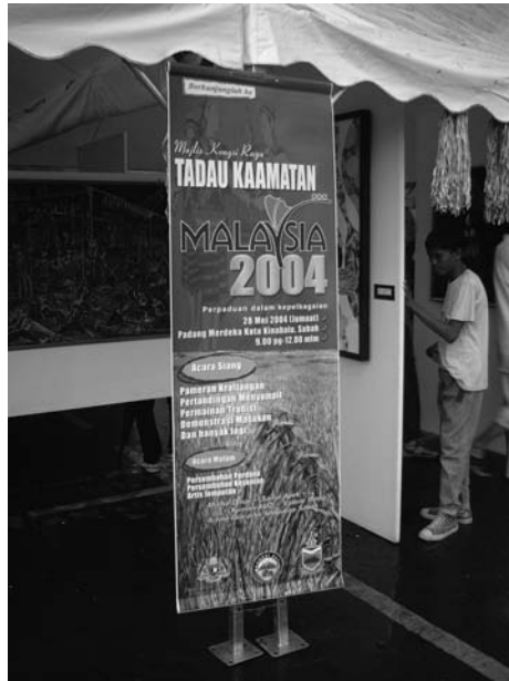
Plate 3.2 Notice board about Kaamatan organised at the national level

As the ‘Open House’ implies, the core of the national Malaysian culture has been reconfigured. That is to say, the cultures of the five ethnic groups have been upgraded to be part of the national culture and juxtaposed as equals in the official discourse. This upgrading of ethnic cultures to the national culture is worth considering. In the section that follows, we will consider the way one of the national cultures in the official discourse is practised within the actual social context, with special attention to Kaamatan representing the Kadazandusun of Sabah.