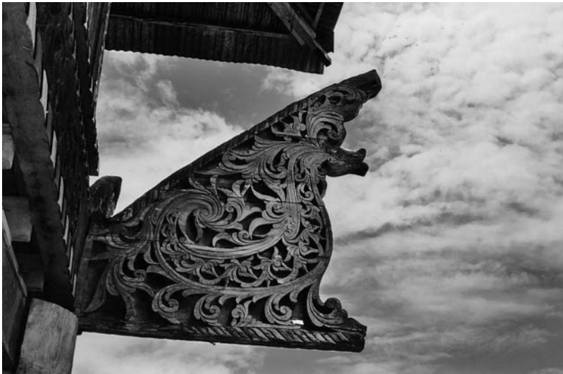
Plate 12.5 Okkir art on protruding beam of a torogan (home of royalty) in Marawi area