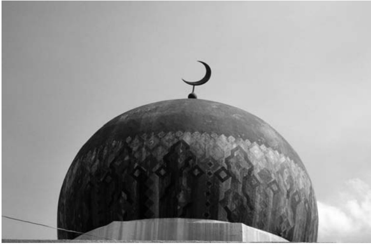
Plate 12.4 Dome of Globo de Oro Mosque, Manila

There has been an unprecedented growth in the number of mosques in the Philippines since the 1970s. Many were built by private individuals either for their own use or for the community, while others were constructed with Middle Eastern financial help. Even the government was involved in building or repairing several mosques, which were damaged in the course of the war in the mid-1970s. 20 Where before 1970 there was no mosque or Muslim community on the island of Luzon where Manila is located, now there are mosques in every province, with major communities in Baguio City, Pangasinan province and Manila. The widely visible minarets and domes readily point to the presence of Muslim communities.