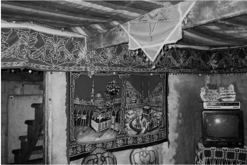
Plate 12.9 Muslim home in the outskirts of Marawi City