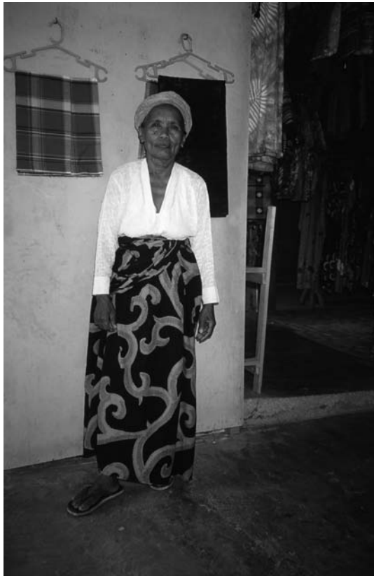
Plate 12.8 Maguindanao Muslim woman in traditional attire but with modern skirt design

idea that the head cover is prescribed by Islam. The men and women of the group called Islamic Studies Call and Guidance (ISCAG) believe they must conform to the dress requirement of Islam described as: 'loose but not tight, long but not short, thick but not thin and with a veil'. 29 The abaya fits this description since it is loose, thick and long. This also reflects the orientation of the ISCAG organisers who encountered Islam in the course of their employment in Saudi Arabia. They are converts from Catholicism, from the traditionally Christian areas in the Philippines, and did not share the ethnic characteristics and heritage of southern Philippine Muslims. Other Muslim women also took to the abaya since, as Mrs. Alonto, wife of former Senator and Muslim leader Domocao Alonto, said, it is more comfortable and easier to wear than the malong . ISCAG women, however, emphasised that their dress conforms to the Qur'anic verses that call for modesty.