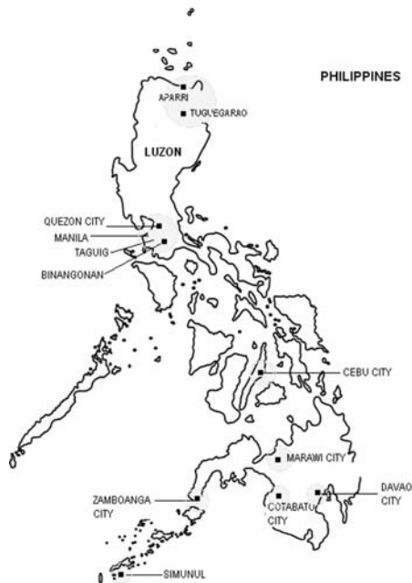
Plate 12.1 Map of the Philippines. Highlighted areas indicate places visited

The Philippines comprises about 7,100 islands with a total land area of 117,000 square miles. Muslims are concentrated in the largest southern island of Mindanao, particularly in the southwestern region, which is closer to Malaysia and Indonesia than to the capital city, Manila. My choice of research locations was dictated by the need to visit communities that are representative of the northern, middle and southern parts of the country. The intention was to see how far North Muslims have settled and also observe how Islam continues to be expressed visually in one of the first places to which it was introduced: Simunul Island.