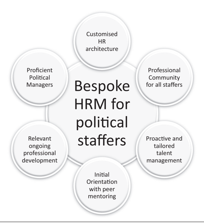
Figure 9.1 Core concepts for a bespoke HRM for political staffers.