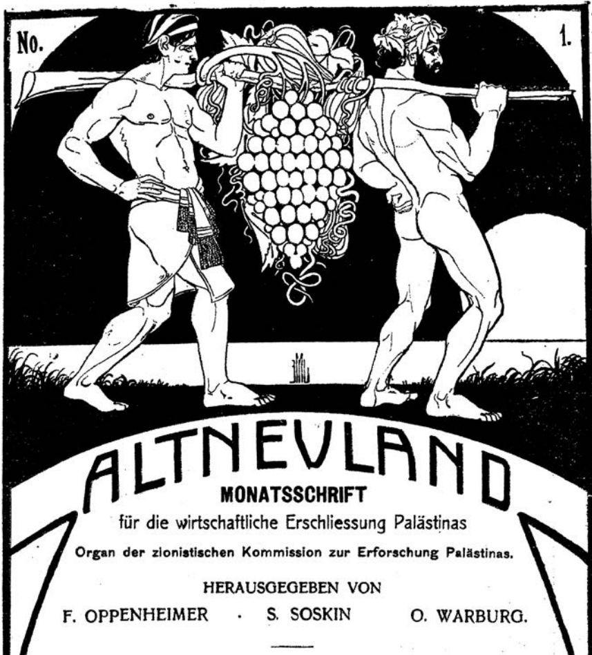
Fig. 2: Altneuland cover illustration

iconography by conveying a feeling of uniformity to the expanding number of Zionist publications. 165 Lilien depicted biblical scouts sent out by Moses returning with a massive cluster of grapes. Wine, grapes and grapevines were perceived by contemporaries as the main symbol of Jewish agricultural prowess, referenc-