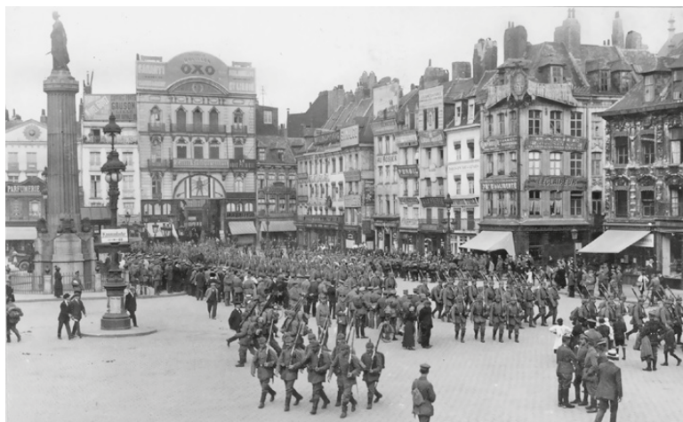
Figure 5 Columns of German infantry moving through the main square of Lille.