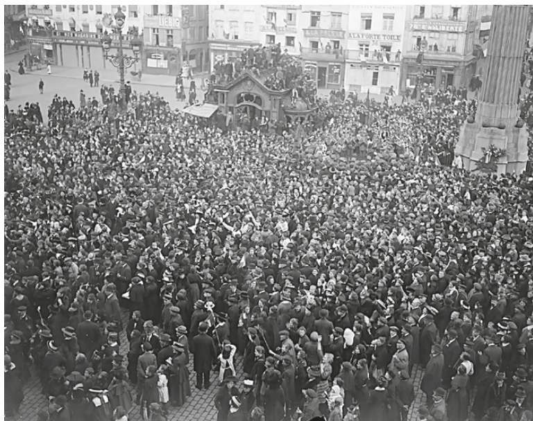
Figure 10 French civilians listening to a British regimental band playing in the Grande Place of Lille, 18 October 1918.