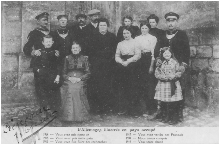
Figure 3 Postcard of the Mayor of Crèvecœur-sur-l'Escaut and his family with German gendarmes (front), sent to Préfet du Nord, 31 July 1919. Archives Départementales du Nord, Lille, France, 9R1193.