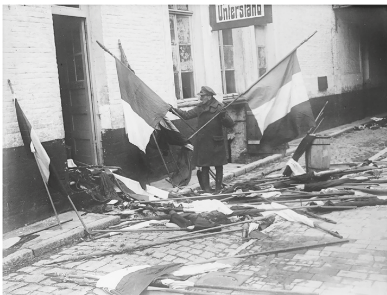
Figure 6 British soldier checking a store of French flags confiscated from the inhabitants of Douai by the Germans, 25 October 1918.