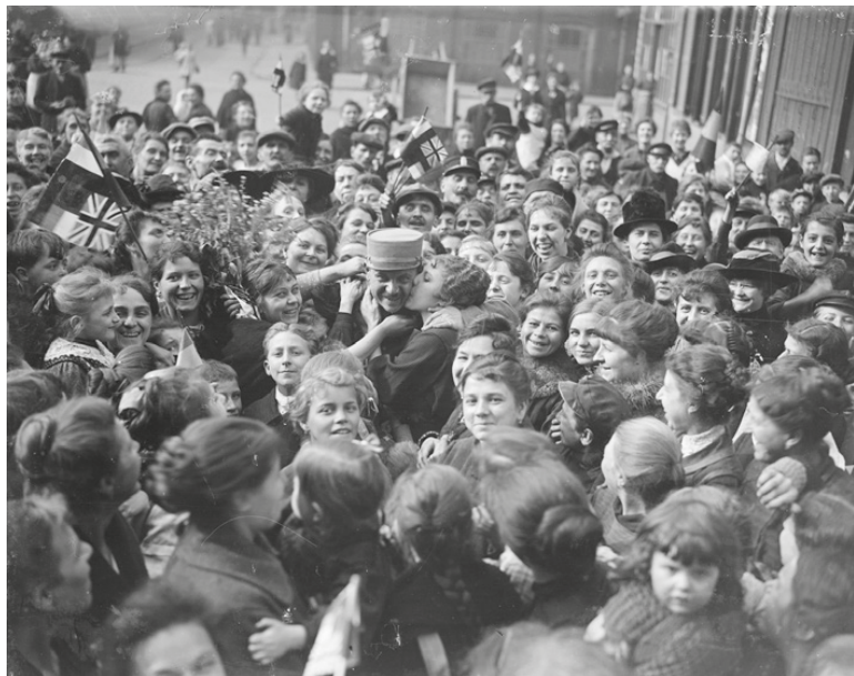
Figure 8 Girls kissing the first French soldier to enter Lille, 18 October 1918.

Official celebrations began straight away, including military parades by the liberating armies, exchanging honours and celebratory discourses, and visits to key towns by the President and Prime Minister, such as those mentioned in the opening lines of this book. Marshalls Pétain and Foch, and King George V also visited the liberated regions. 24 However,