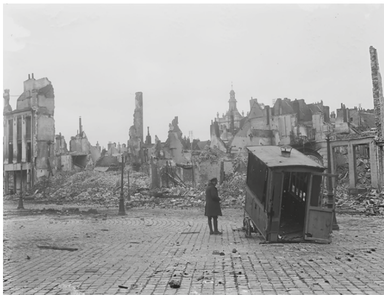
Figure 12 British soldier checking a wreck of a tram in the ruined Grande Place at Douai, 25 October 1918.