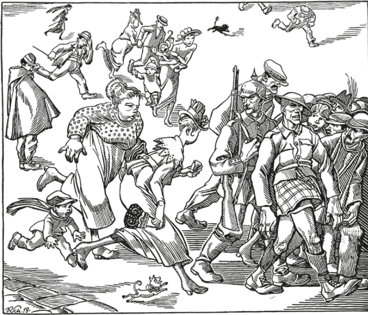
Ein grosser Tag fuer die Liller.