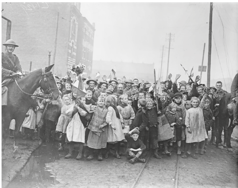
Figure 9 Frenchwomen and children cheering the arrival of the men of the British 57th Division at Lille, 18 October 1918.

this was not the end of military occupation: Allied armies remained in the liberated Nord for months, initially carrying out humanitarian work. A French military report underlined that for the period up to 25 November 1918 the British army provided considerable transport, food and health care to the destitute, hungry population, including transporting tens of thousands of refugees and saving the 790,000 inhabitants (450,000 of whom were in Lille-Roubaix-Tourcoing) from famine. The report's author described this as 'a marvellous act of systematic and ingenious charity' and concluded, 'For this beautiful work, [British] army heads and soldiers have the right to the most profound gratitude of France.' 25 However, eventually the British presence and regulations led to discontentment among locals, who complained of a second occupation. 26 Further, lack of provisions continued to plague the area despite the fact that on 31 December 1918 the CANF was abolished and the Ministry of Liberated Regions henceforth oversaw food provisioning and attendant controls. 27