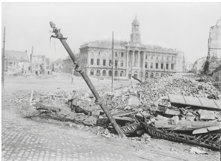
Figure 11 View of the main square in Cambrai, showing damaged buildings and the town hall, 23 October 1918.