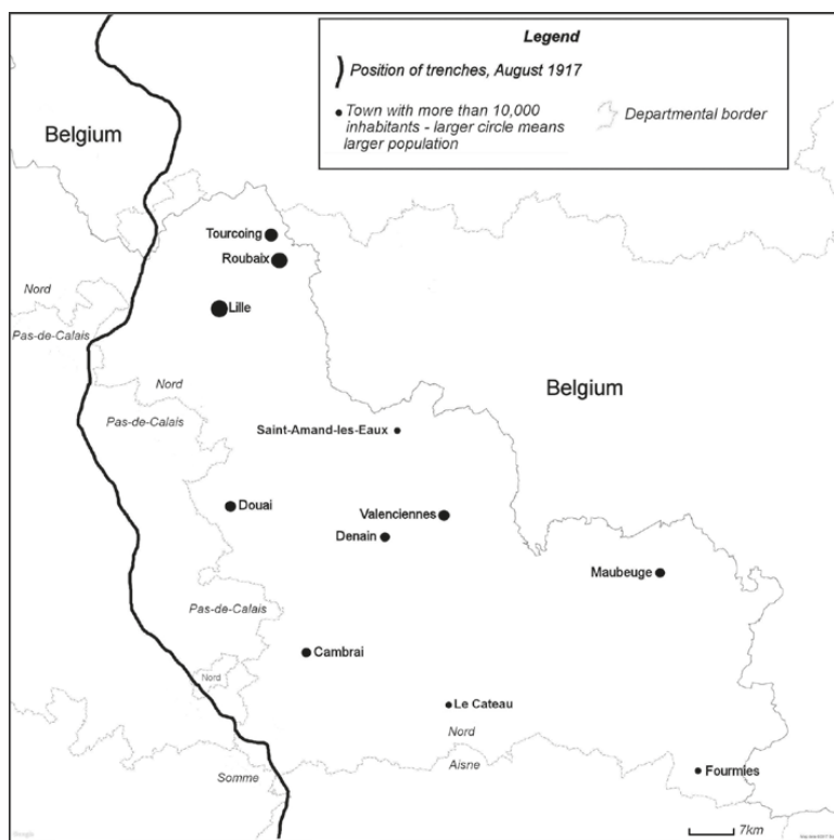
Figure 1 Map of the occupied Nord, August 1917.

By November 1914, the Germans partially occupied nine French departments and fully occupied one (see Figure 1 ), representing about