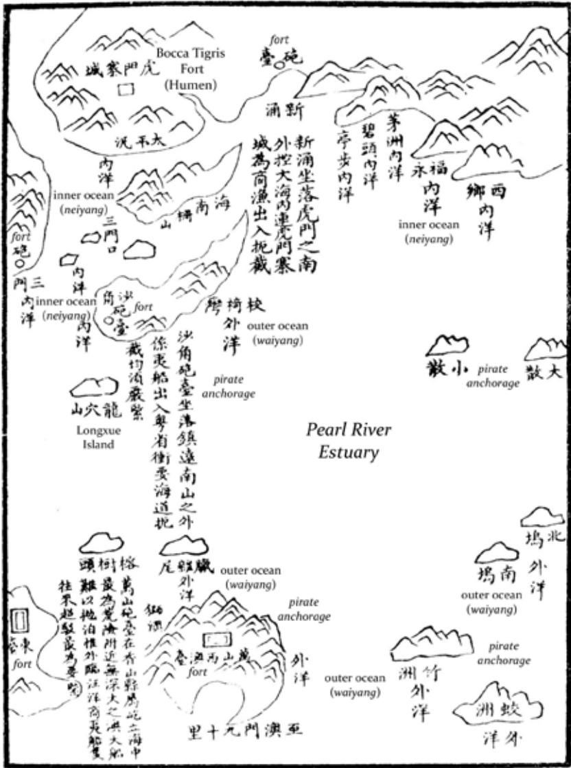
Map 4. Pirate Anchorages in the Pearl River Estuary, c. 1809

( haidao ). At the start of the eighteenth century, both in Europe and in China, respective central governments began transforming their judicial systems to protect private property in general and maritime trade in particular. 23