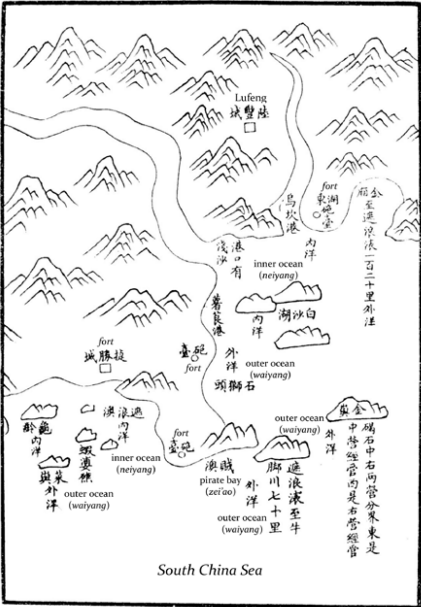
Map 2. Inner and Outer Oceans on the Lufeng Coast, Guangdong Province, c. 1820 Source: Guangdong tongzhi . [Gazetteer of Guangdong province], comp by Ruan Yuan. (Canton, 1822).

to set limits on the reach and responsibilities of the state and to regulate government operations across the sea space.” As the Qianlong and Jiaqing emperors repeatedly mentioned, officials in coastal areas dared not to