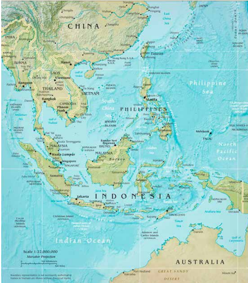
Map 1. Political Southeast Asia

Pires' time, his work illustrates that a vigorous slave trade predated European involvement in Southeast Asia.