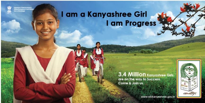
FIGURE 1. I am a Kanyashree Girl. I am Progress.

“These days, girls are saying, ‘I’m going to study. Then I’m going to work. I’m not going to get married now.’” I was chatting with a group of men and women from a mixed-class and -caste neighborhood of a Birbhum District village I had been visiting for thirty years. Learning of my current project on women who do not marry, they wanted to catch me up on the marriage and gender trends they are now witnessing.