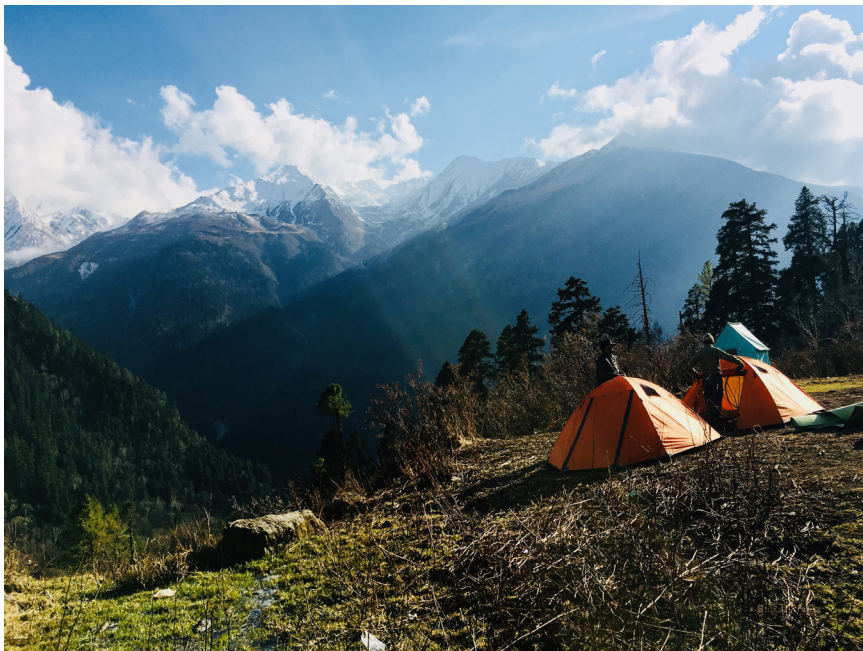
FIGURE 5. Pleasure, friendship, and fun in the Himalayas.