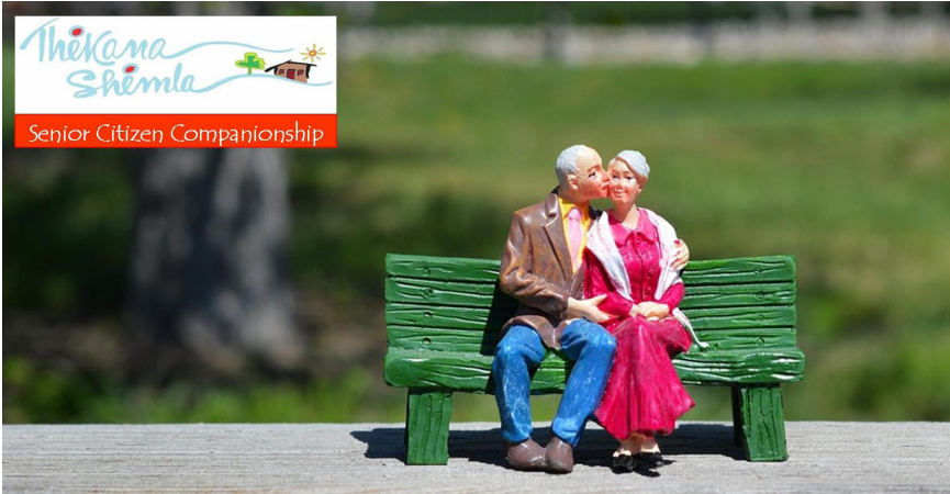
FIGURE 4. Why should not single elderly people fall in love?