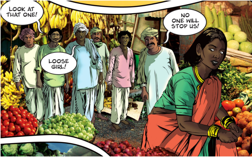
FIGURE 3. Priya's Shakti: "Loose girl! No one will stop us!"

most dangerous country (see note 13), and US women practice many of these same measures to stay safe.