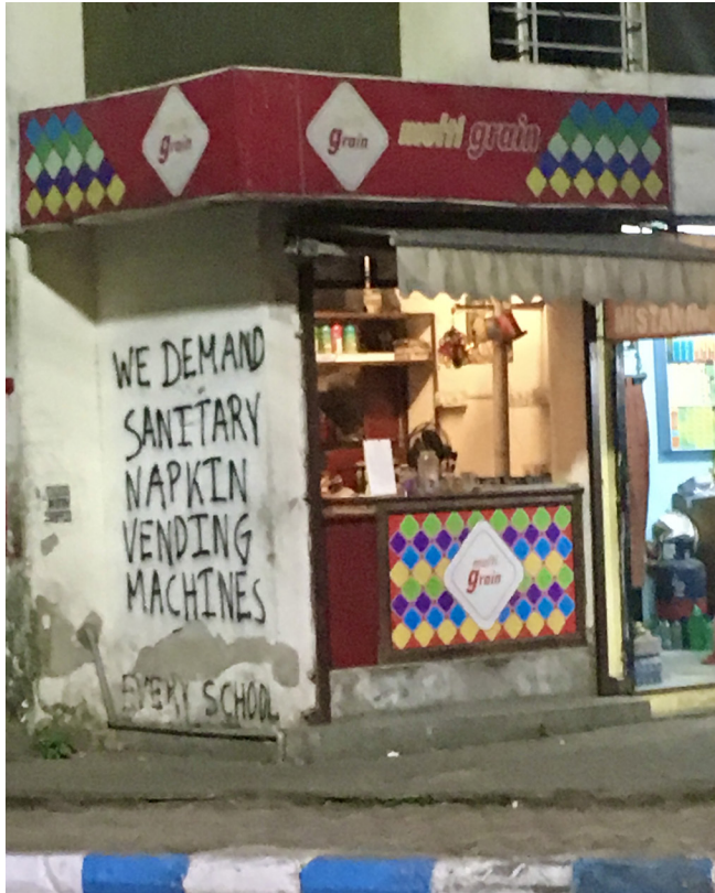
FIGURE 2. We demand sanitary napkin vending machines in every school.

that it is not menstrual hygiene but housework demands that keep girls above age 14 out of school (e.g., Time 2019). But I feel that both arguments miss the point of sexuality—the pervasiveness of social-cultural ideologies that girls and young women after puberty are sexually vulnerable to being assaulted, mixing inappropriately with boys out of wedlock, getting pregnant, and threatening their own and their family’s respectability. Such attitudes are also evident in the “anti-Romeo” squads active since 2017 in the northern Indian state of Uttar Pradesh, ostensibly to protect women from sexual harassment in public spaces. Women’s rights activists have criticized the squads, which involve both plainclothes and uniformed police officers and police-sanctioned vigilante groups, for their heavy-handed tactics and moral policing, as they target and publicly shame young couples in parks, colleges, and markets.