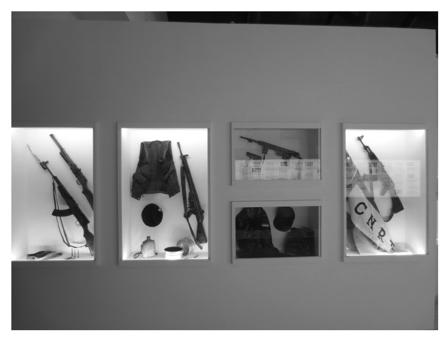
5.1: Display from Archives and Museum of the Timorese Resistance, Dili, Timor-Leste.