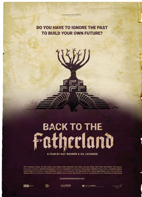
Film poster, Back to the Fatherland .

Below is the emblem of the title of the film with “fatherland” in pseudo-gothic script, a script widely used by the Nazis, while at the top poster asks: “Do you have to ignore the past to build your own future?” It is not only my contention that doing so is a nonoption, but even more that it is outright dangerous. An attempt to ignore, ignores factual history. It ignores the fraught and complex past and present. It oversimplifies human relationships. The before and the after remain separated by the middle sequence, the traumatized time that thwarts the notion of “normalcy” and which, supported by mythical memories, feeds into the creation of mythical time in which past, present, and future congeal. While “normalcy” is a construct, the construction of this specific abnormality needs to be unraveled and its various nuances need to be unpacked, as these impact on individuals, families, but also the questions we tackle in research. We enter the past, present, future mythical time matrix of which we, as researchers, are also part. A future task of German-Jewish history and also of Jews in Germany, including Israelis in Germany, is to unpick this mythical time creation from their perspectives, as it cannot be escaped. Israelis who remain in Germany might find this time in their faces in the shape of their own children who beg the questions that cannot be