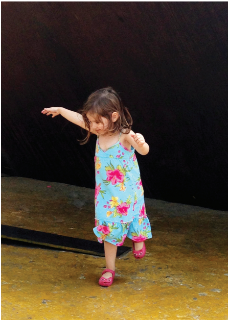
Child running through the Shoah Memorial, Rabin Square, Tel Aviv, Israel.

“This train really goes to Wannsee? To the Wannsee?” As a German born and raised, native German-speaking, German Israeli this question surprised me during fieldwork in Berlin. Where else would this train go, is there a different Wannsee? I wondered—a thought that was cut short by the utterance: “So this is where it really happened.” Place names and spatialities triggered specific conceptualizations for the newly arrived Israelis, living up to the “mnemonic agencies” of Maurice Halbwachs. Spatialities or memorials caused them to react differently, sometimes less than me, sometimes more. “The trains, when I see these trains [cargo trains, D.K.], they just remind me . . .” was an admission at the train station in a suburb of Cologne that I had been using my whole life and which mainly annoyed me as a commuter. The Shoah had never before crossed my mind at my train station. Contrary to this “trite trauma memoryscape” memorials barely created harrowing thoughts, as their scope was clear so that one could avoid them at will; they were spatially limited and detached from everyday routines. Trains seemed to be frozen in time. They were experienced as a generalized epitome of terror and genocide, an abject object of the everyday, directly connected to Israeli memoryscapes of the Shoah. 37