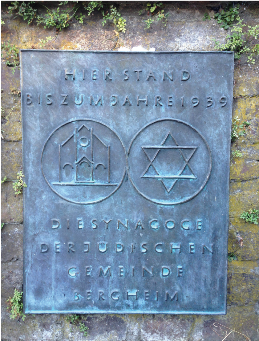
Memorial plaque, Bergheim/Erft, Germany.

the Everyday and Their NS-Past). 36 Time, memories, and space form a triad in Germany that cannot be escaped—the triad hangs in the air, it is on the ground, in the ground, in buildings, in artifacts, in personal memories, and embodied in praxes of the everyday. To inhibit it all would not only take significant willpower; as Ilany stated: “I argue that the inhibited comes out in uncanny, unforeseen ways—it is impossible to inhibit.”