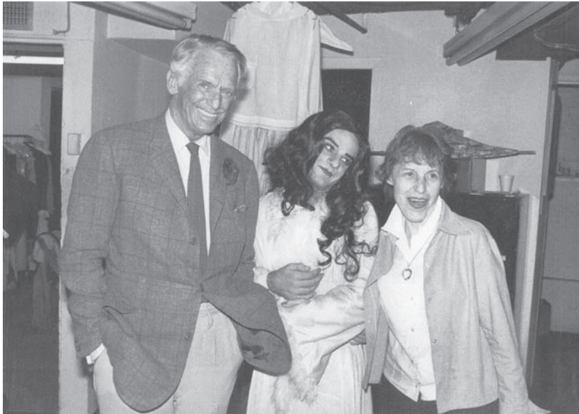
Figure 1: Charles Ludlam after a performance of Camille with Douglas Fairbanks Jr. and Lotte Lenya (c. 1976).

I longed to become a part of what I realized was a secret, elusive, and exclusive club—the Ridiculous tradition. I was even more surprised to find that so little scholarly work was available on Ludlam and his plays, but also understood how his work could be difficult to access and understand. Thus, my relationship with Ludlam required a certain queer approach to move through time critically, necessitating queer methods to figure out how my present might be linked to Ludlam's past.