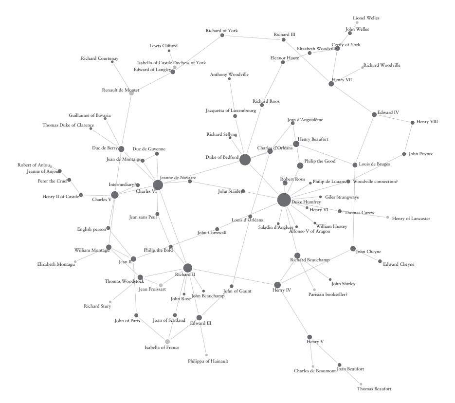
Figure 12.3 Network of givers and recipients of French books associated with other owners of French books