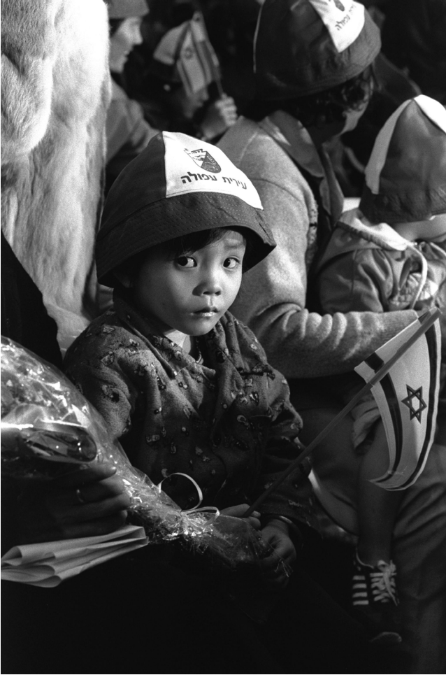
FIGURE 8. Vietnamese refugee child, wearing a kova tembel and holding an Israeli flag, at Ben Gurion Airport, January 1979.

but lacked the preferred whiteness implicit in the Zionist project. It would not be until the 1980s that Israel would engage in large-scale operations to bring Ethiopian Jews to Israel, such as Operation Solomon in 1991. Vietnamese Israelis therefore exist in an uneasy “third space” created by a “racial triangulation” of Israeli Jews and Arab Palestinians, as well as white Ashkenazi Jews and Black Ethiopian Jews—two binaries that admittedly erase those caught in between, such as Arab Jews, the Mizrahim. 50