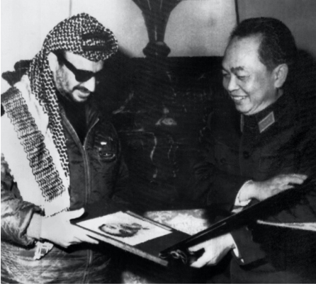
FIGURE 2. General Võ Nguyên Giáp shares photos of the establishment of the Vietnam People's Army with PLO leader Yasser Arafat during his visit to Hà Nội, March 1970.

Locating himself squarely in the “East,” in this poem Qasim subverts Western colonial distinctions between the “Far” and “Near” East and thus imagines stronger geopolitical connections between Vietnam and Palestine. The poem also posits Third World revolutionaries as historical actors capable of writing their own history and headlines through armed guerrilla warfare, instead of mere reactionaries to US-Soviet Cold War maneuvers.