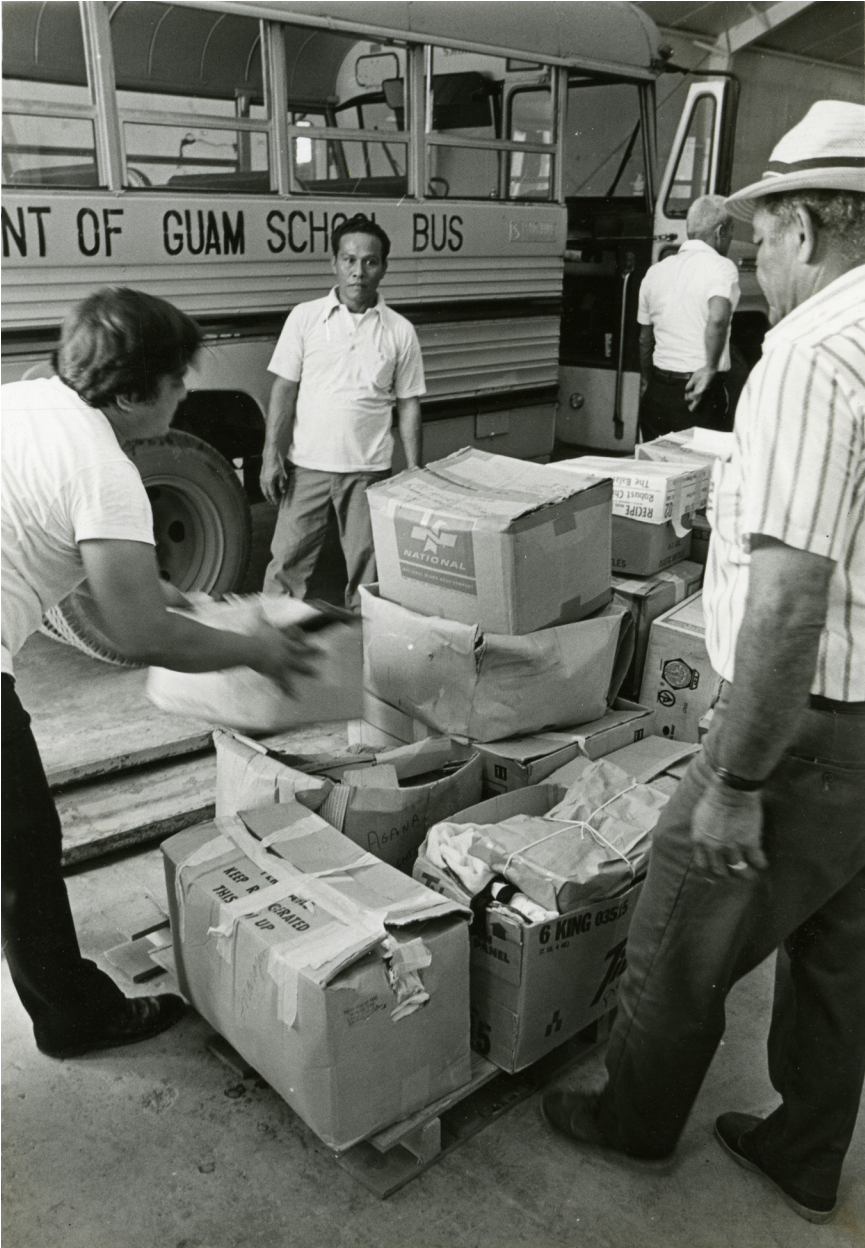
FIGURE 5. Guam school bus used in Operation New Life, 1975.