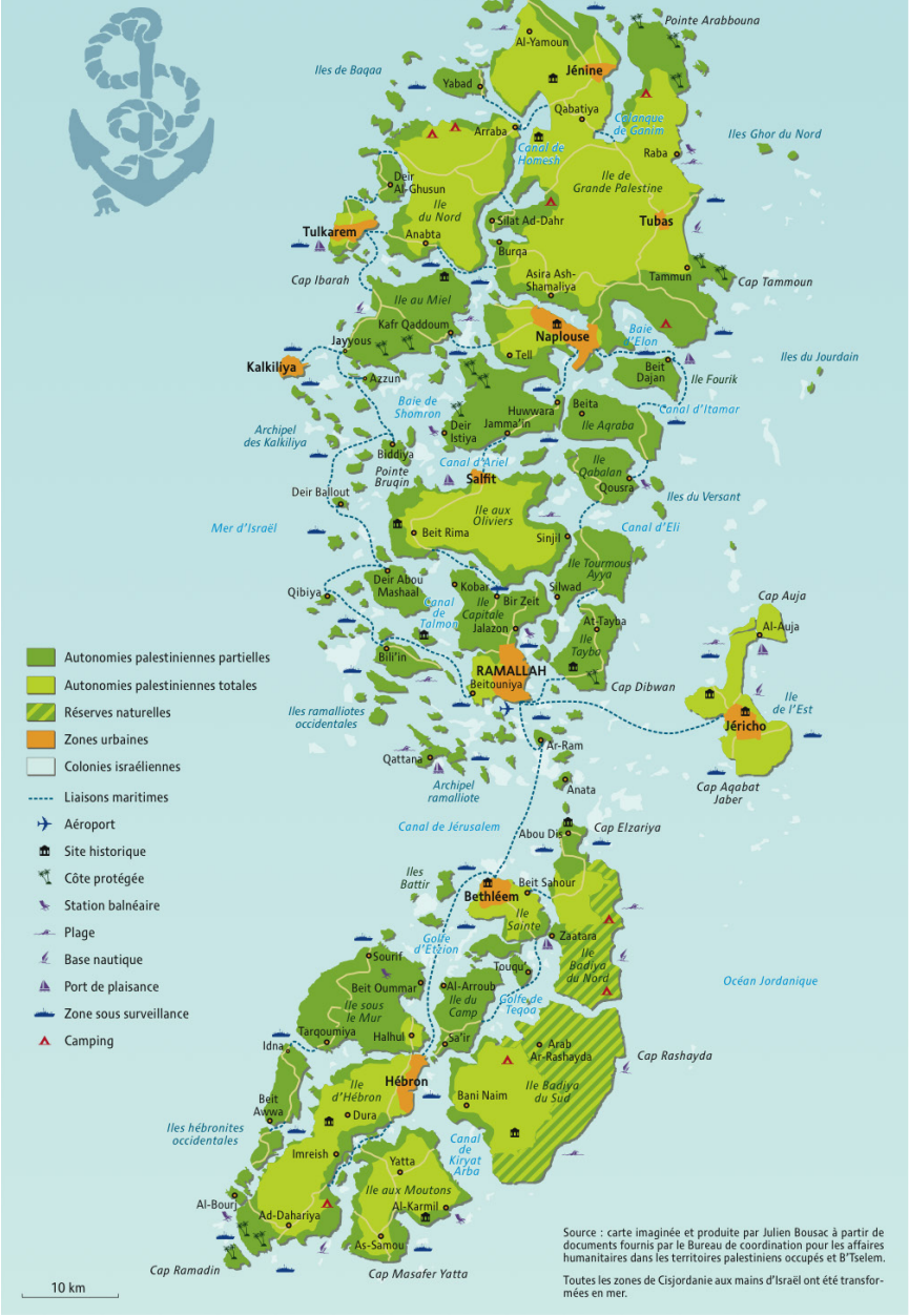
FIGURE 1. L'archipel de Palestine orientale, by Julien Bousac. Image courtesy of Julien Bousac.