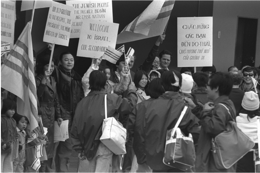
FIGURE 7. The second wave of Vietnamese refugees, from the freighter Tung An , marooned in Manila Bay, are greeted at Ben Gurion Airport by the first wave of resettled Vietnamese, January 1979.