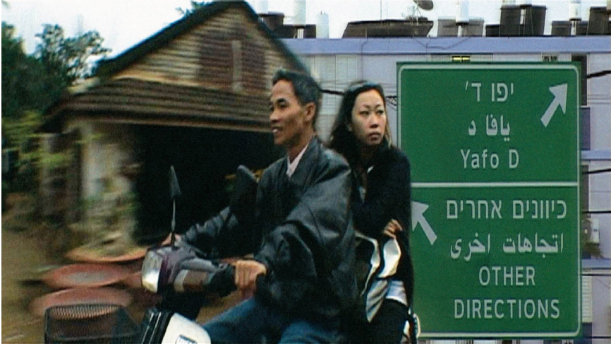
FIGURE 10. Film still from The Journey of Vaan Nguyen © Zygote Films.

Because very few viewers are fluent in both Hebrew and Vietnamese—even the Vietnamese Israelis in the documentary sometimes experience difficulty communicating across generation and language—subtitles are indispensable for understanding the film. For Hebrew-language audiences, the film needs to translate only the Vietnamese dialogue. For Anglophone audiences, in contrast, the film offers English subtitles for both the Hebrew and Vietnamese dialogue and, regrettably, does not distinguish between the two. Unless they can identify the auditory differences between Vietnamese, Hebrew, and their respective accented variations, Anglophone viewers may therefore miss the characters' constant linguistic negotiations. In sum, English subtitles mediate Anglophone viewers' understanding of the film: not only are they often inaccurate, but they also smooth out the grammatical inconsistencies and hesitant vocabularies of the Vietnamese Israelis, who communicate with one another without formal training in each other's native tongue. In essence, the film's English subtitles mask Vietnamese Israelis' everyday labor of translation in their quotidian interactions.