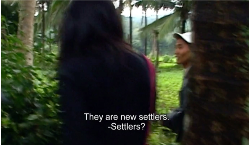
FIGURE 11. Film still from The Journey of Vaan Nguyen.

The word “settlers” in white text flashes across the screen twice—once for Hoài Mỹ’s assertion, and then again for Nguyen’s surprised follow-up question—more explicitly framing Jewish immigration to Israel-Palestine as part of the Zionist state’s structure of settler colonialism.