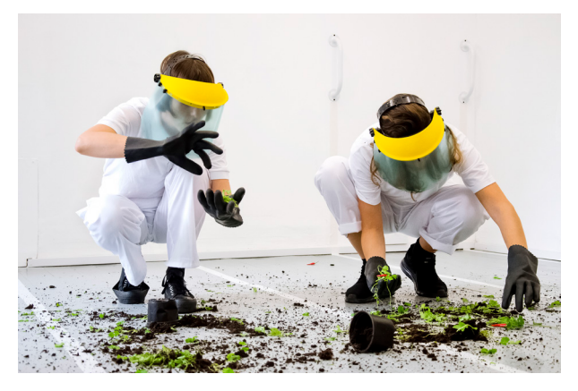
'Your Friendly Local'