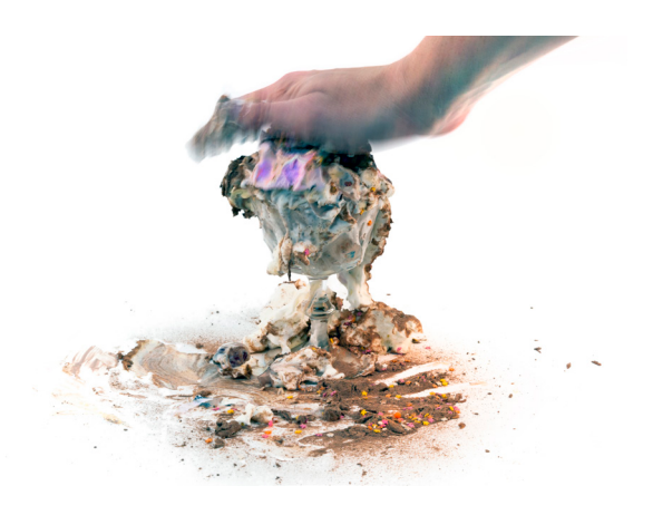
'Rock and Roll will never die', Kit Poulson & Benjamin A Owen, 2018

Another way of looking at it is that it is simply a relief on a hot day. But what a construction to bring that comfort.