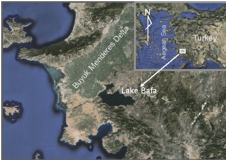
Figure 1 - Geographical location of the Lake Bafa Basin ( google earth image ).