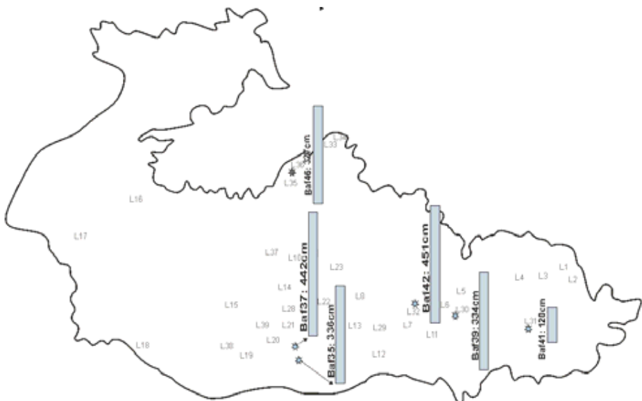
Figure 2 - L1-L39 indicate core locations (sediment-water interface short cores and upto 4.5m depth long piston sediment cores) of the entire project (I.U.BAP Project numbers: 28942; 17828) and studied cores BAF35 , -37, -39 -41, -42, -46.