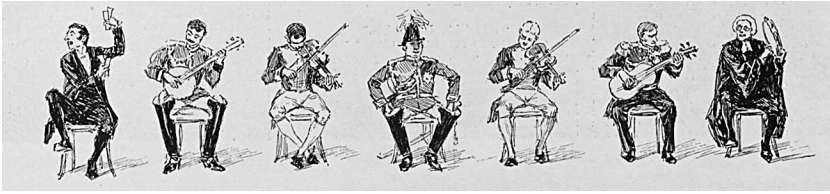
Fig. 4.1: Caricature of minstrel lineup in Utopia Limited . Lower segment of “Scenes from a performance of Gilbert and Sullivan’s ‘Utopia Limited’ at the Broadway Theatre in New York City.” Publication unknown; probably Harper’s Weekly , 1894. Thure de Thulstrup, artist.