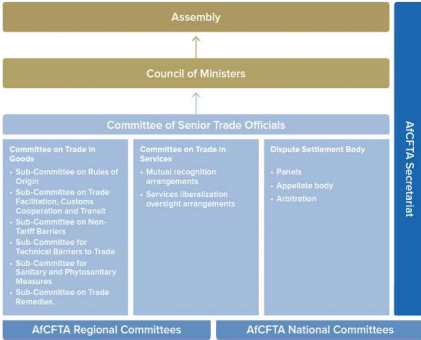
FIGURE 10.1 Institutional framework for implementing the AfCFTA