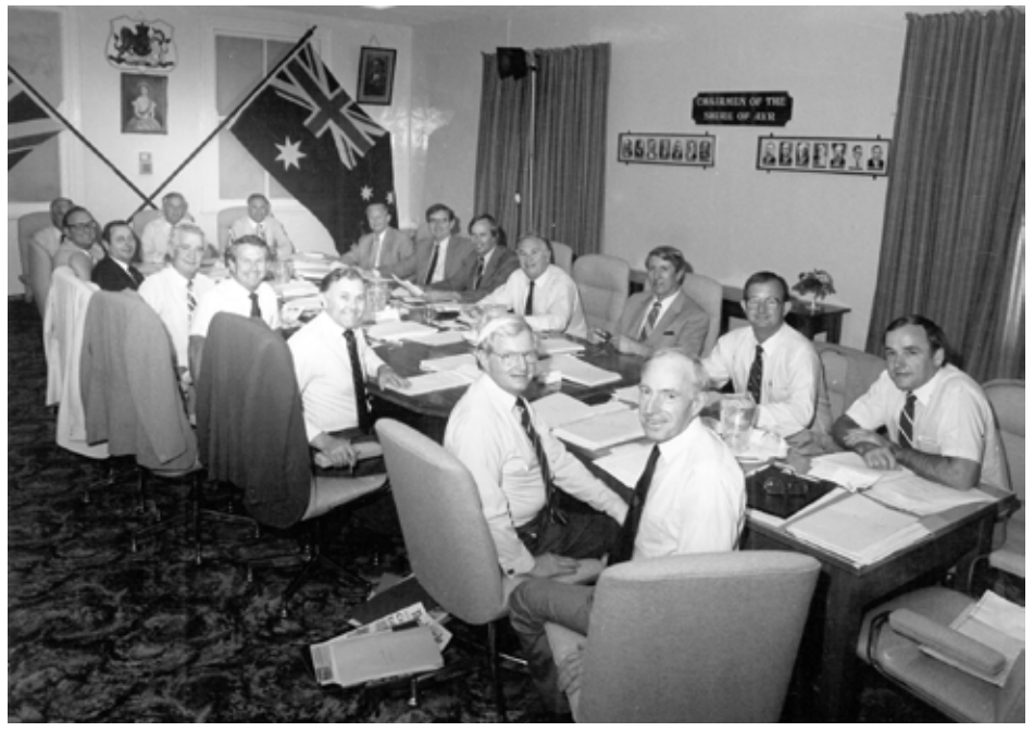
Image 16. The Seventh Bjelke-Petersen Ministry meeting at a country cabinet at Ayr, prior to the 1983 State election.