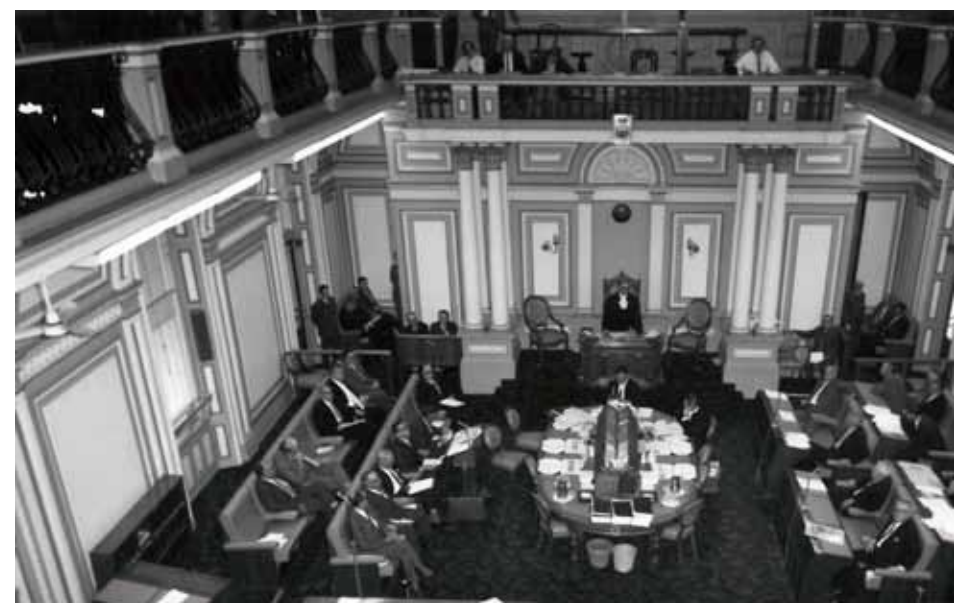
Image 11. The Queensland Legislative Assembly sitting in the early to mid 1970s, prior to the major restoration in the early 1980s.