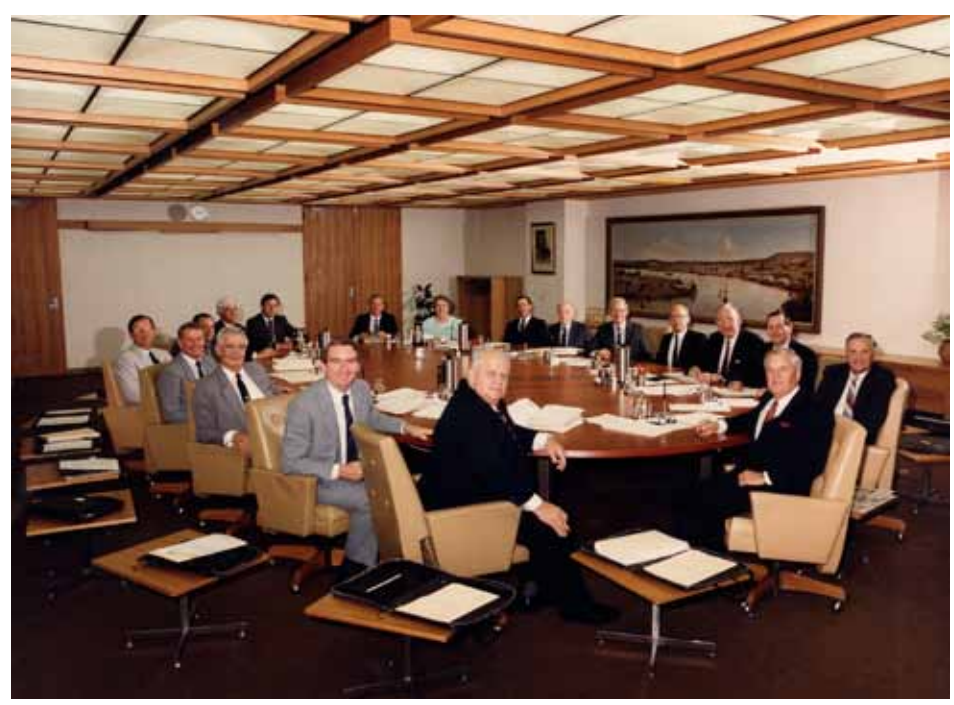
Image 19. The Ninth Bjelke-Petersen Ministry that lasted from December 1986 to December 1987.