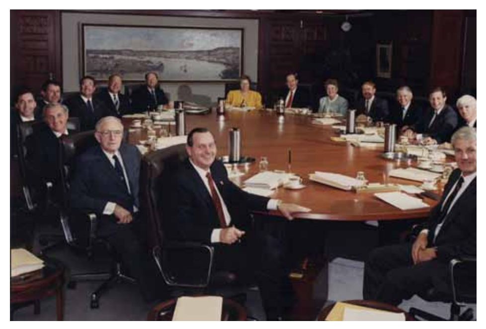
Image 23. The 18 member Cooper Ministry in September 1989, the first to contain two women cabinet members.