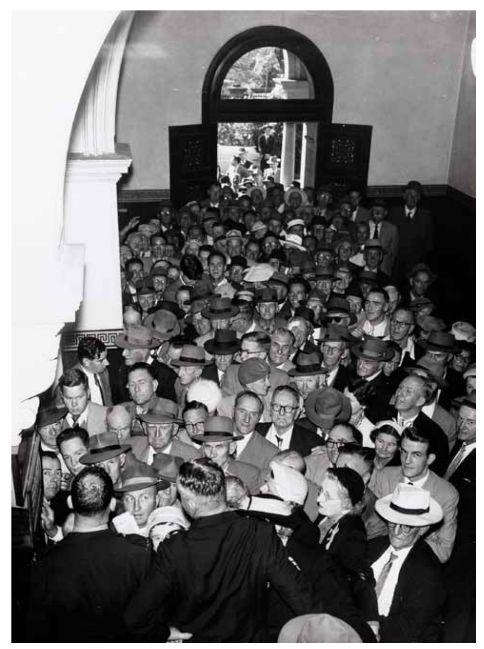
Image 3. Members of the public attempting to gain entrance to the public gallery to witness the fall of the Gair government in June 1957.