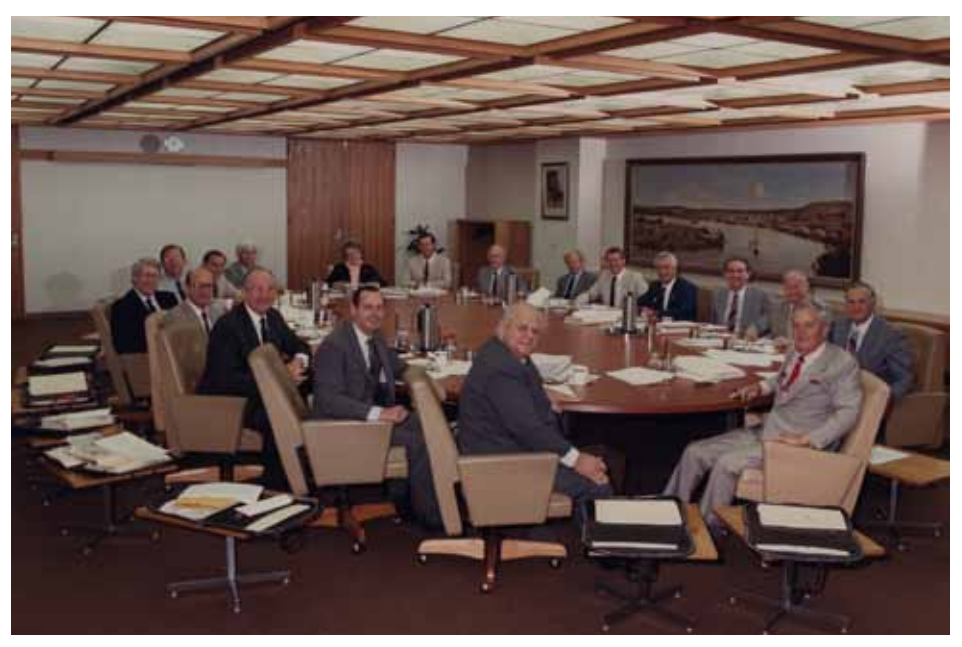
Image 18. The Eighth Bjelke-Petersen Ministry when the Nationals governed alone circa 1986.