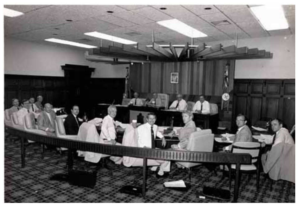
Image 15. The Seventh Bjelke-Petersen Ministry 1983, the so called 'Rump' Ministry composed solely of Nationals.