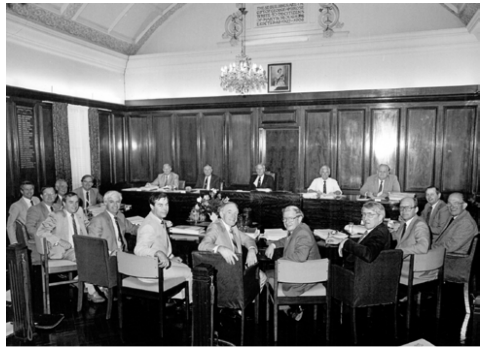
Image 17. A meeting of the Eighth Bjelke-Petersen Ministry at Maryborough circa 1984 or 1985.