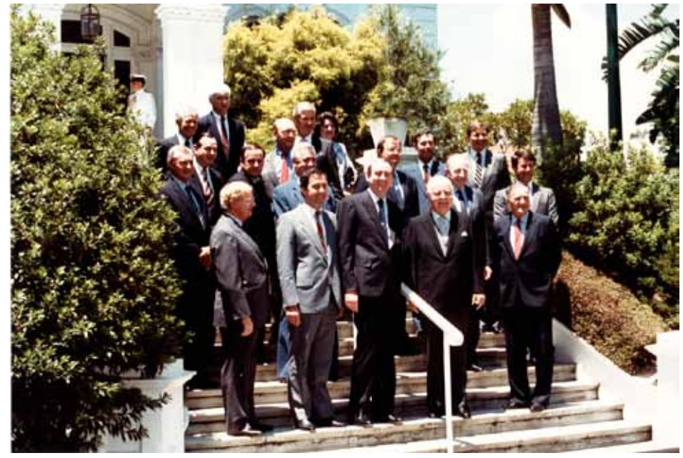
Image 21. The first Ahern Ministry after its swearing in with the Governor Sir Walter Campbell, December 1987.