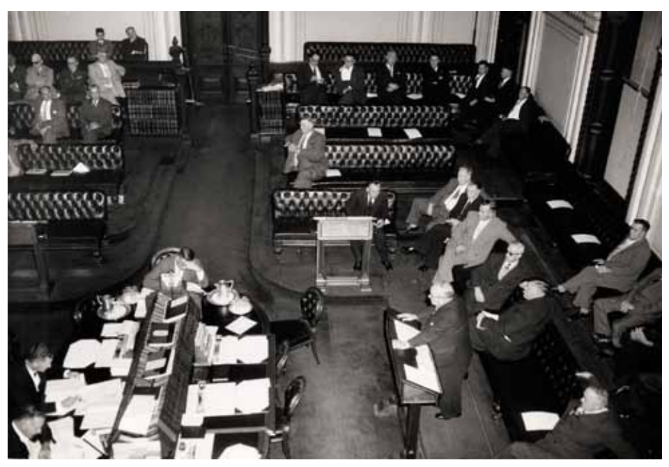
Image 1. The Premier, Vince Gair, standing in the foreground asking the House to vote supply in June 1957 before the fall of his government.