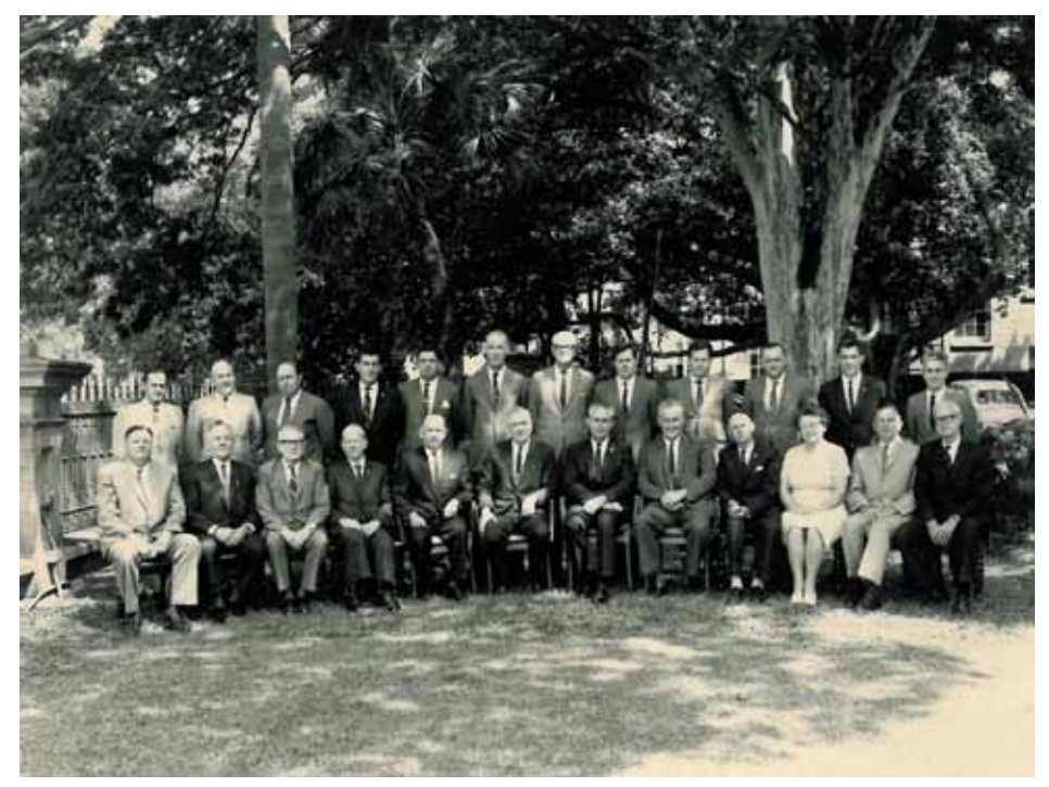
Image 10. The Opposition Leader, Jack Houston (seated centre), with some of the Opposition members circa 1971.