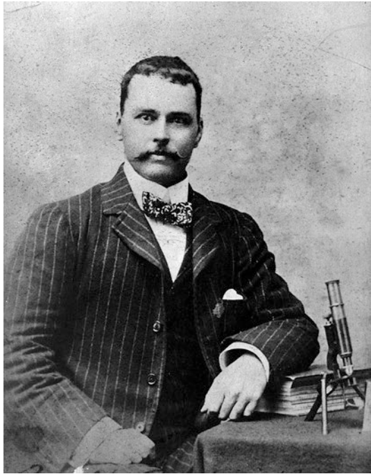
Fig. 1 Sir Ronald Ross with his microscope.

he saw, the second to write to his wife with the news, and the third to pen a poem that would define the moment for years to come. As he dissected the mosquito, he also ‘cut the Panama Canal’. 2 This was the moment that Ross conquered ‘million-murdering death’ and ‘la[id] one of the stones upon which w[ould] rest the everlasting bastions of a strong and vigorous Empire’. 3 Or so the story goes. This book is about the story of parasitology. It is about science and empire, and the stories we tell ourselves about science and empire . In the following pages, I explore how the material and imaginative architecture of imperialism produced tropical medicine, which, in turn, reimagined empire in its own image.