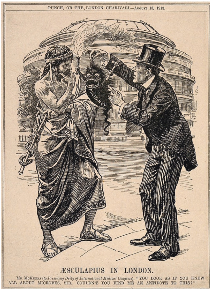
Fig. 1 Punch Cartoon featuring Reginald McKenna as British Home Secretary asking Æsculapius for help with the microbe 'Militancy'.