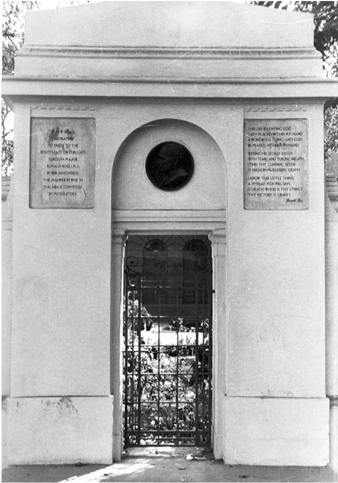
Fig. 2 Ross Memorial Gate in Calcutta.