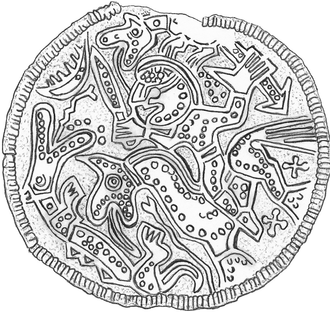
FIGURE 1.2 Bracteate from Gudbrandsdalen, Oppland, Norway [after Hauck 1985, 1,3, 77, 65b], ©2019 Drawing by Nina Zerkich.

times. 98 Surely such occasions often involved ceremony and heroic exposition. If ever we would expect monster stories to have been current in Germanic Europe, it would have been then. To the period of production and circulation of the D-bracteates, therefore, it is possible to look for the origin of the Beowulf poem. 99 Chadwick thought Beowulf derived from “stories ... preserved by recitation in a more or less fixed form of words” that were “acquired [by the poet] before the end of the sixth century.” 100