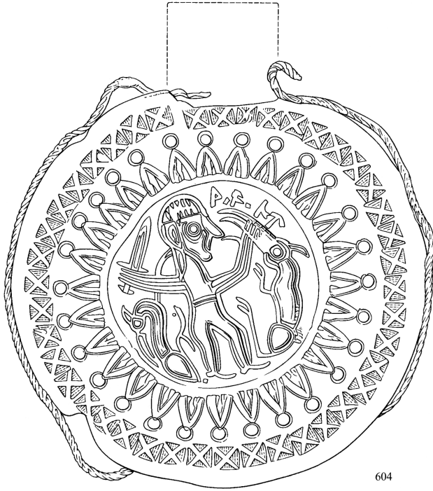
FIGURE 1.1 Bracteate from Binham, Norfolk, England [after Axboe, with Behr and Düwel, "Katalog der Neufunde," Taf. 66]