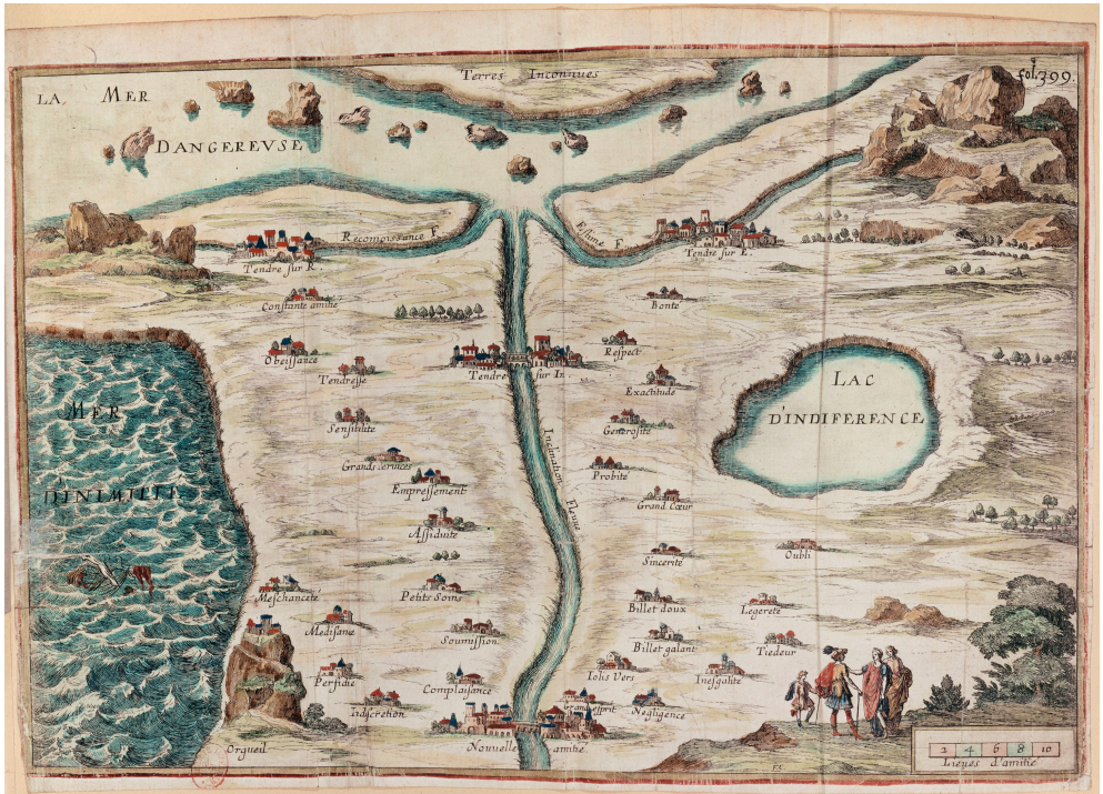
FIGURE 15.1 Gravure: la Carte de Tendre , Paris, BNF (1654).

Love], 42 where “les plaisirs succèdent souvent aux douleurs, on se console facilement” [pleasure often follows sorrow, one is easily consoled], 43 and where they might have left Monsieur de Clèves resting in peace on (or under) the broad and lovely Plaine d'Indifférence [Plain of Indifference] and taken up residence in the village of Feu déclaré [Passion Declared], where “[o]n les prendrait pour être des gens fort vertueux, car ils ont toujours sur le teint la rougeur