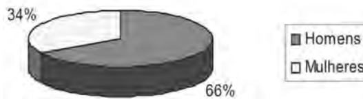
Figure 6.2: Percentage of personnel engaged in research by gender