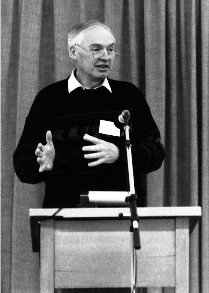
Figure 14: Robert O'Neill speaking at the Salzburg Seminar, 1994.