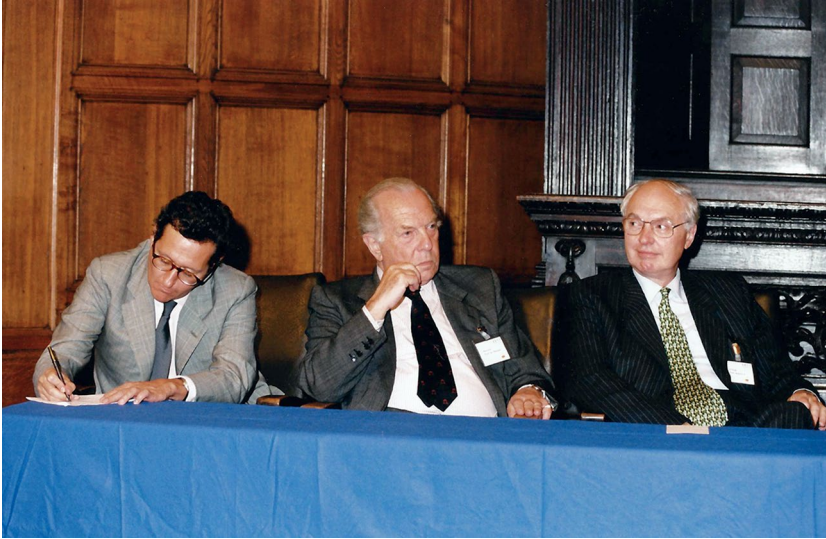
Figure 17: At the Fiftieth Anniversary Conference of the IISS, Oxford, 1998.