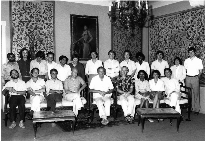
Figure 6: IISS/ACA 'New Faces' Conference, Bellagio, Italy, July 1984.