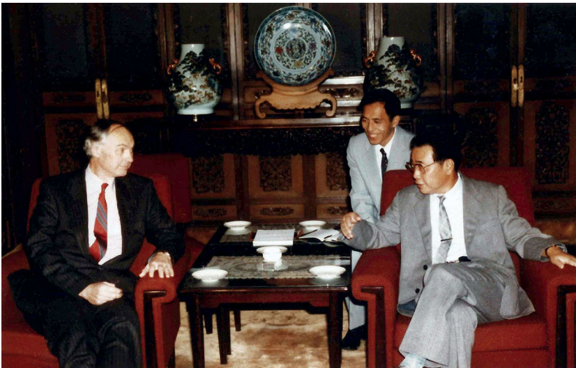
Figure 9: Robert O'Neill with Deputy Premier Li Peng, Beijing, September 1986.