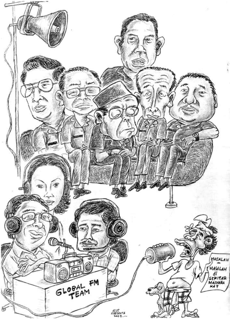
The Balinese radio station Global FM presents itself as the mediator of dialogue in the public sphere, 2001