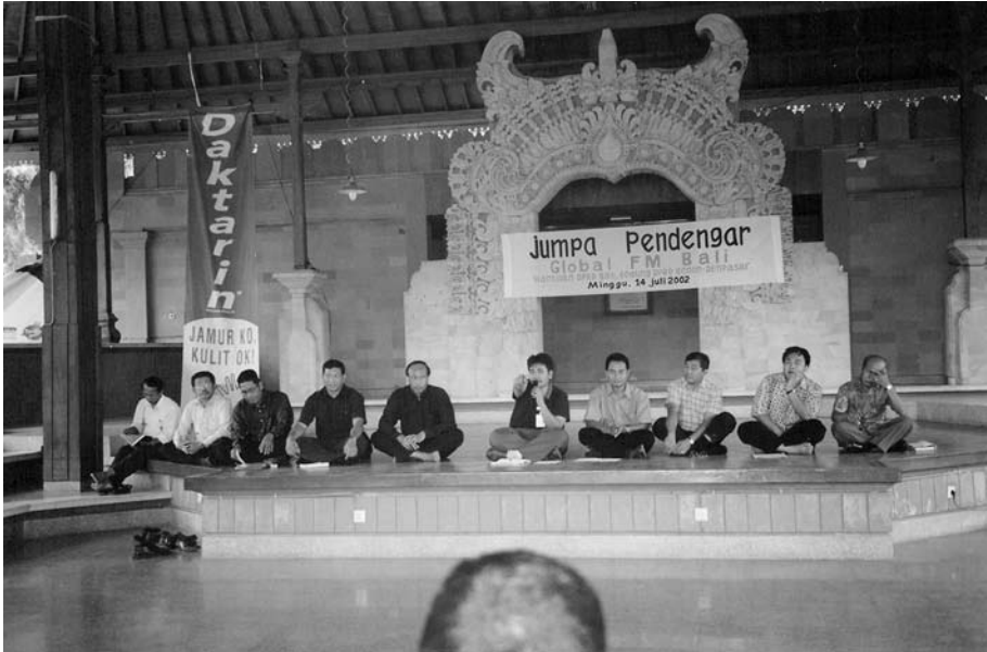
The Global FM invites the audience for discussion during the 2002 'Jumpa pendengar' event