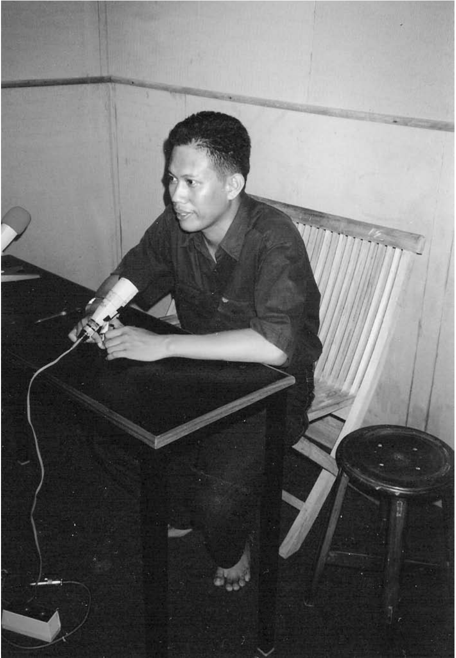
The Indonesian media scholar and radio journalist Masduki, 2001