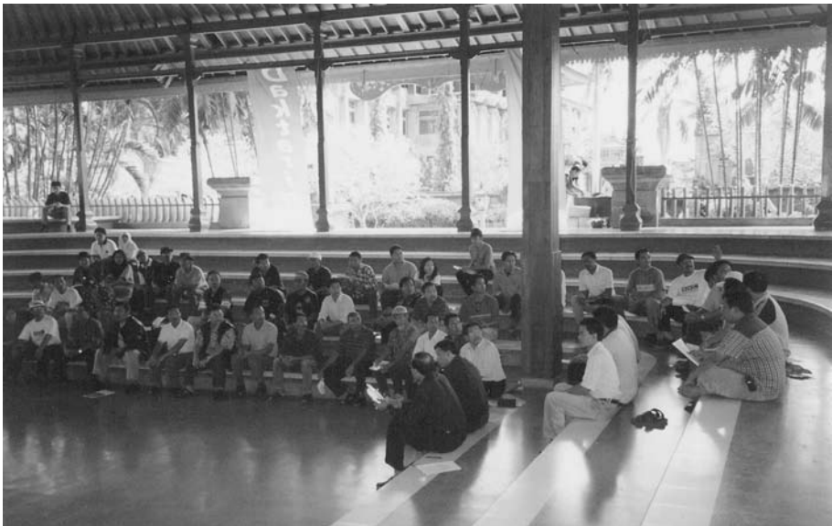
The audience participating in Global FM's 2002 'Jumpa pendengar' event