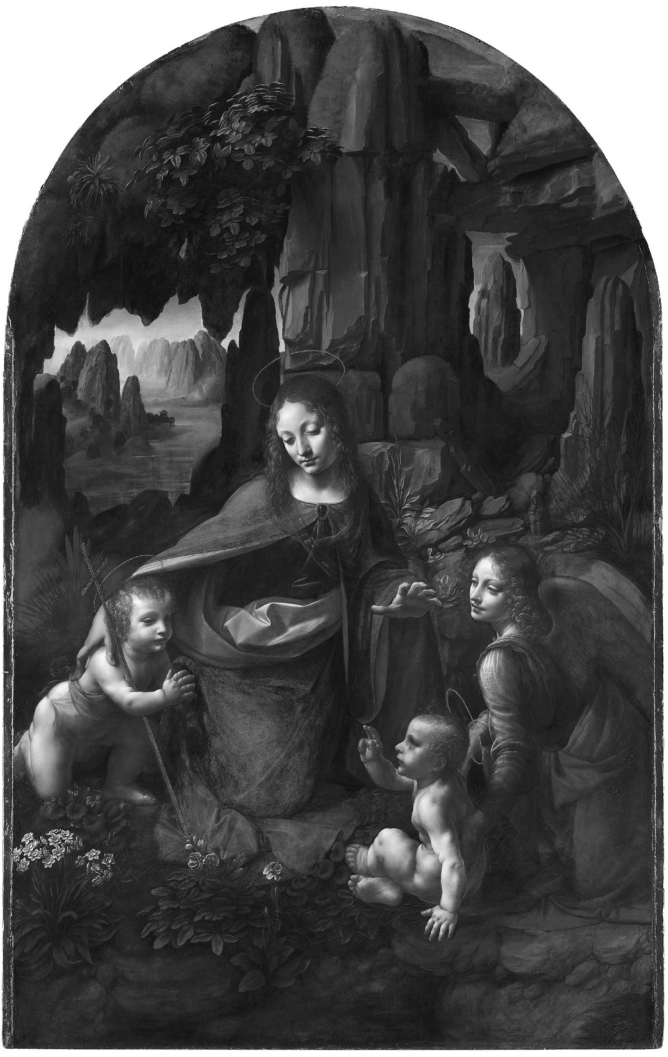
Figure 3 . Leonardo da Vinci, The Virgin of the Rocks (about 1491/2–9 and 1506–8), National Gallery, London.

the question of whether gender is distributed as two separate kinds or as one. An answer perhaps lies in the other doubling so conspicuous that it has come to name the paintings, the rocks.