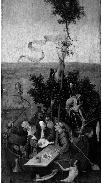
Fig. 1. Hieronymus Bosch, Ship of Fools (1490–1500)