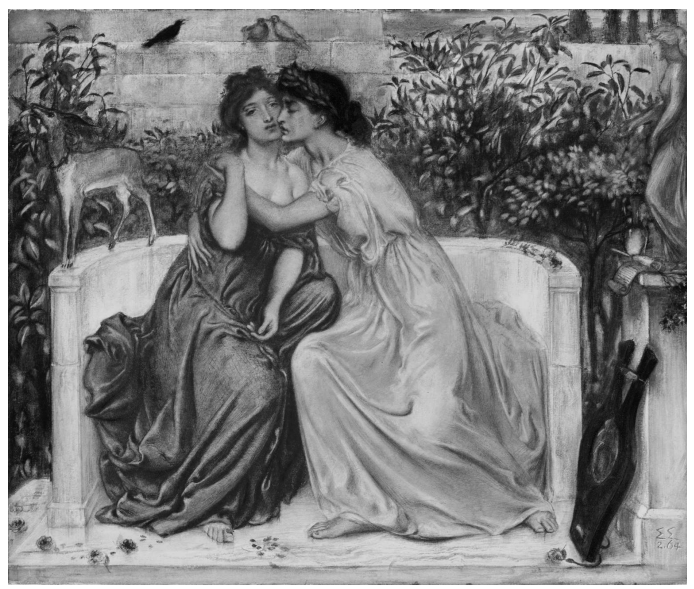
Figure 1 . Simeon Solomon, Sappho and Erinna in a Garden at Mytilene (1864)

this was a world of fluid possibilities." If so, why did such fluidity come to a halt, what boundary did Solomon violate that kept this artwork from public display? He "attracted sustained criticism of 'unwholesomeness' or 'effeminacy," we are finally told. For what? This image?