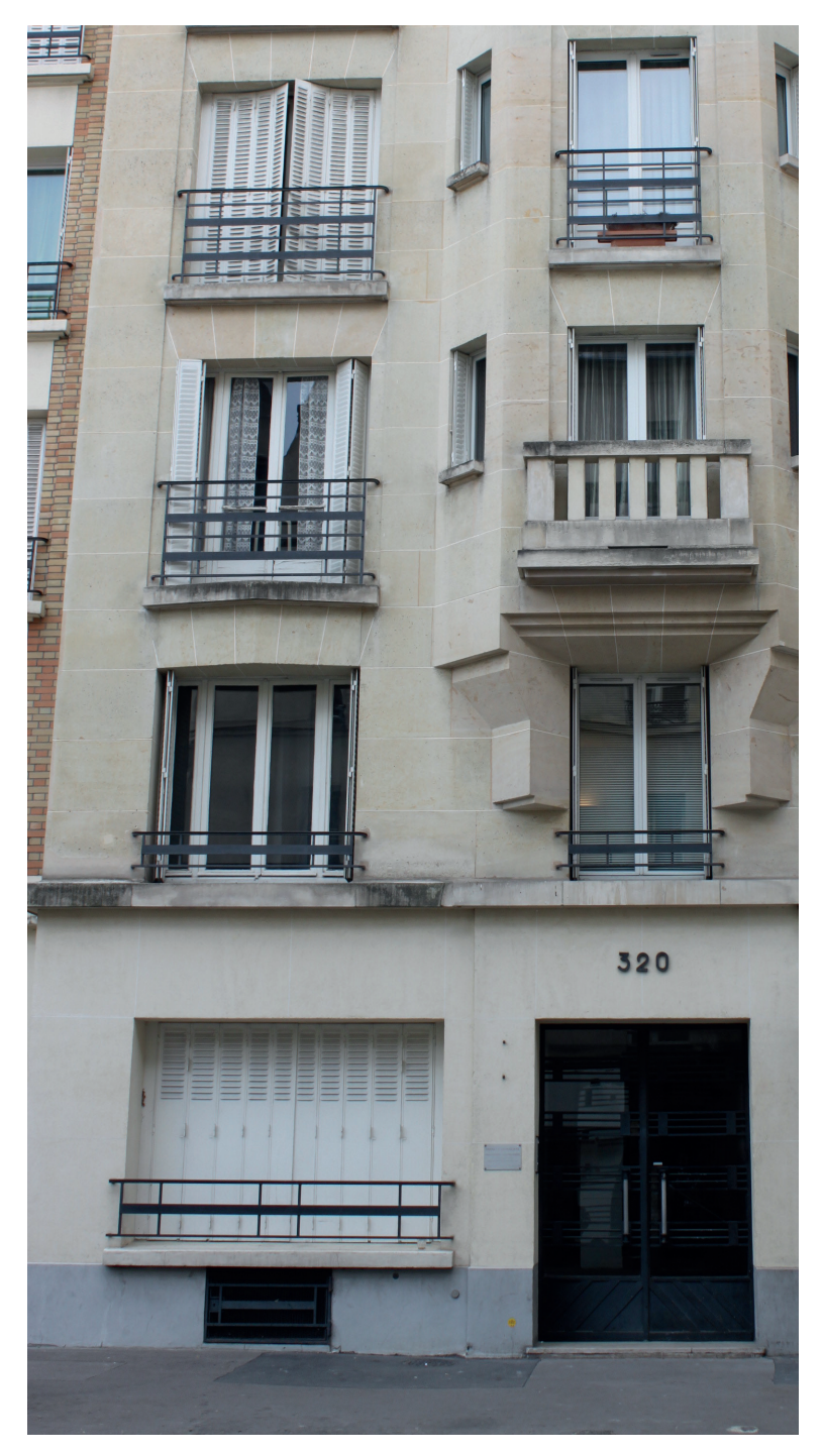
320 rue St Jacques from the street (present day).