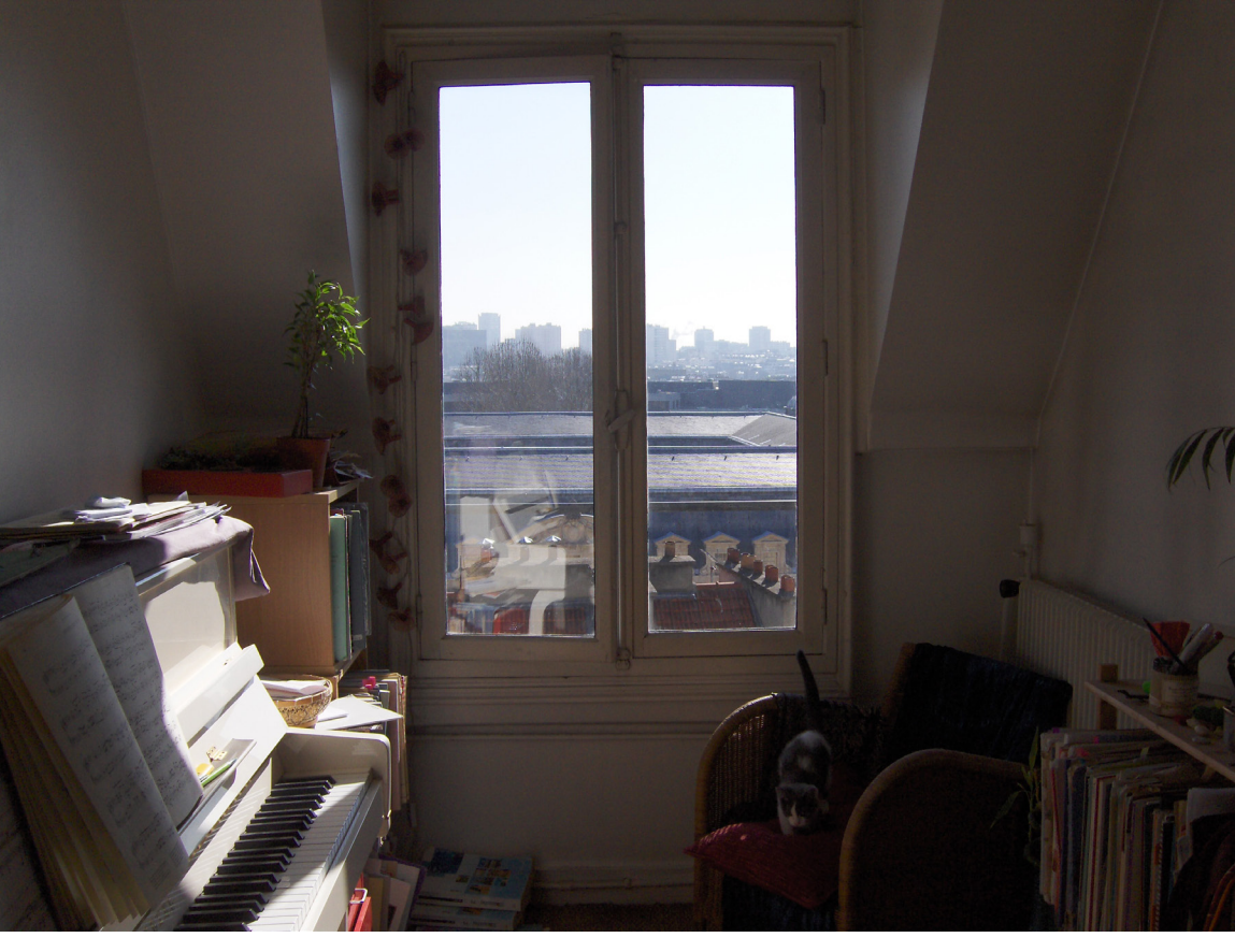
Inside 320 rue St Jacques (present day) .