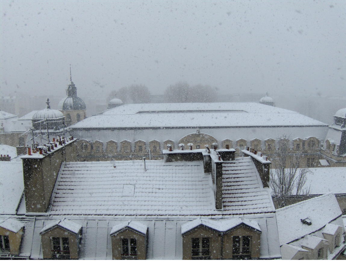
View from 320 rue St Jacques in winter .

Had some hot chocolate with Jacqueline Piatier (room 5).<sup>180</sup> Cold. Darned. [Monsieur Blum dead – note made 25.7.43]