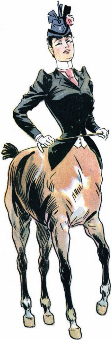
Figure 3. From "Fashion's Fil- lies—A Fancy for Horse Show Week," drawn by C.J. Taylor, Puck , November 18, 1901.