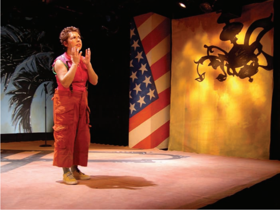
Carmelita Tropicana onstage in With What Ass Does the Cockroach Sit?