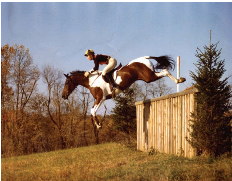
Figure 5. On Poltroon on the cross-country course at the Radnor Horse Trials, 1977.