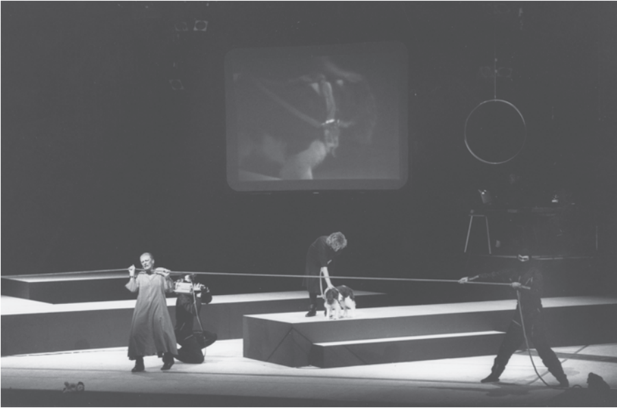
The Others , live performance.