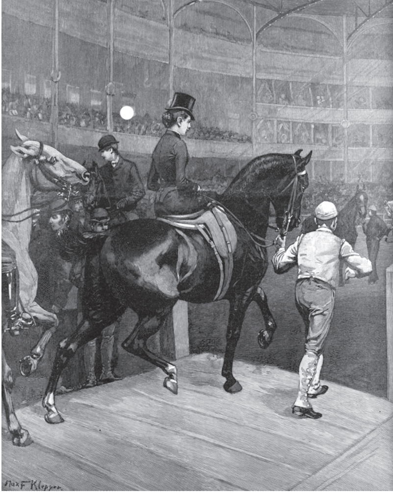
Figure 2. "Entrance of Saddle Horses," drawn by Max F. Klepper, Harper's Bazaar XXXV: 1822 (November 21, 1891): cover.

doing and even more willing than riders astride to go with rather than force the horse's movements. From men's perspective, women seemed mysteriously able to meld with horses and get them to do their bidding even absent the right leg. In this caricature from Puck (fig. 3), the illustrator draws the logical, if ironic and wonderfully queer, extension of women's apparently extraordinary communion with the horse. This is a communion achieved