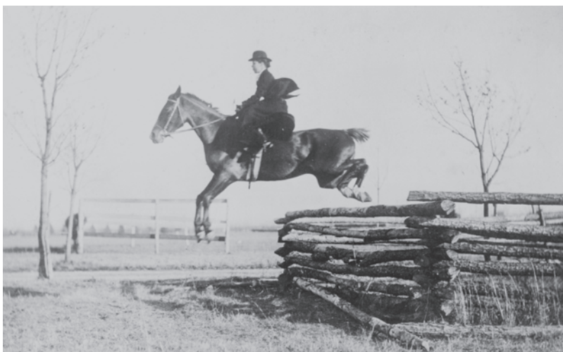
Figure 6. Lady jumping side saddle, c. 1900. The Valentine Museum, Richmond, Virginia.