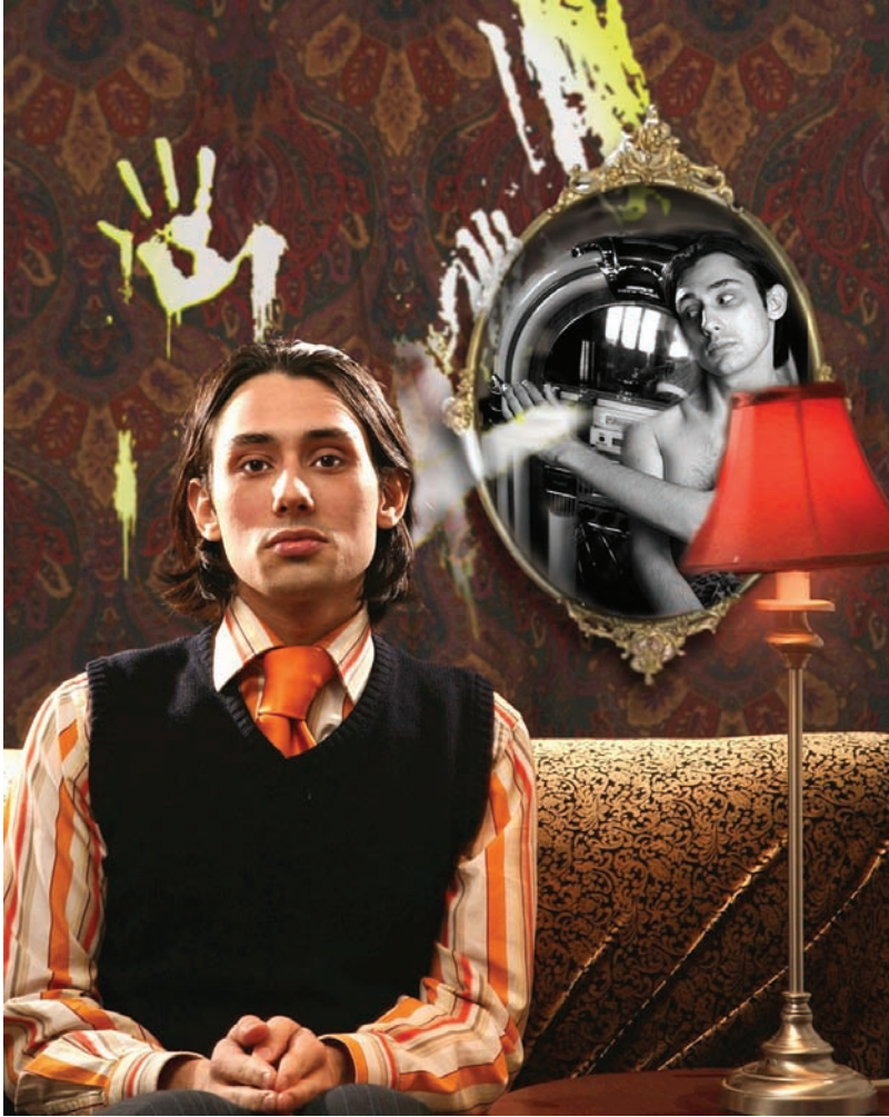
Promotional image for performances of Cat Lady and Human Jukebox . Image by John Moran and Hank Hivnor.

to create a void, a momentary evacuation of meaning where something unpredictable might happen. A vacancy might be created and God might show up to fill it. Who knows?