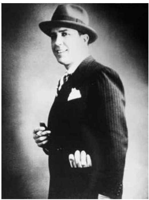
3 & 4 Carlos Gardel in rural and urban attire.