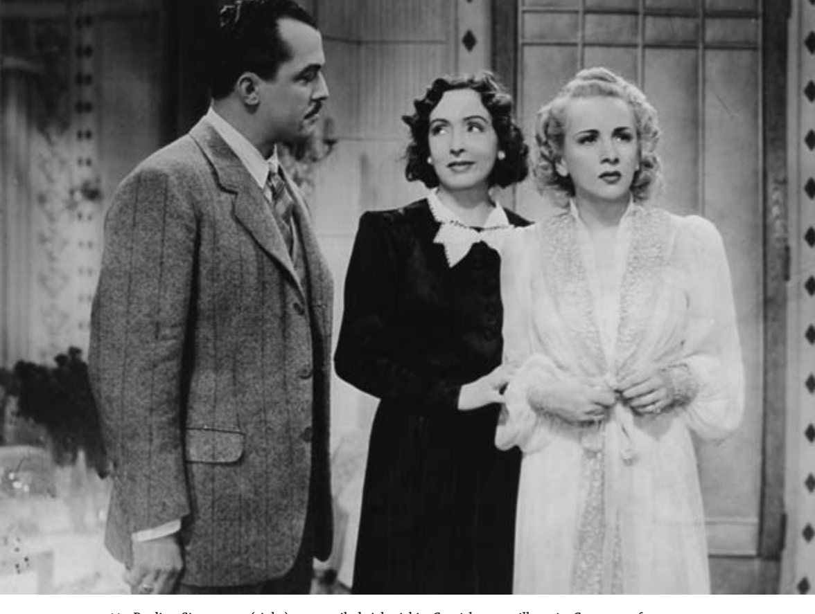
11 Paulina Singerman (right) as a spoiled rich girl in Caprichosa y millonaria.

adventures and eventually fall in love. Upon arrival in the city, their union is threatened, but in the end, love overcomes all obstacles. Despite these similarities, however, Romero's film is not merely a remake with a little local color. On the contrary, La rubia del camino breaks with its Hollywood precursor in several significant ways. As interclass romances, both films seek to reconcile rich and poor. Yet for Romero, working within well-established Argentine cultural conventions, the elite woman and working-class man reflect a series of binary oppositions that are either muted or absent altogether in Capra's film. In this vision, the rich are also foreign, modern, and urban, while the poor are national, traditional, and rural. These oppositions effectively widen the gulf that separates rich and poor, undermining the film's capacity to generate a unifying national myth.