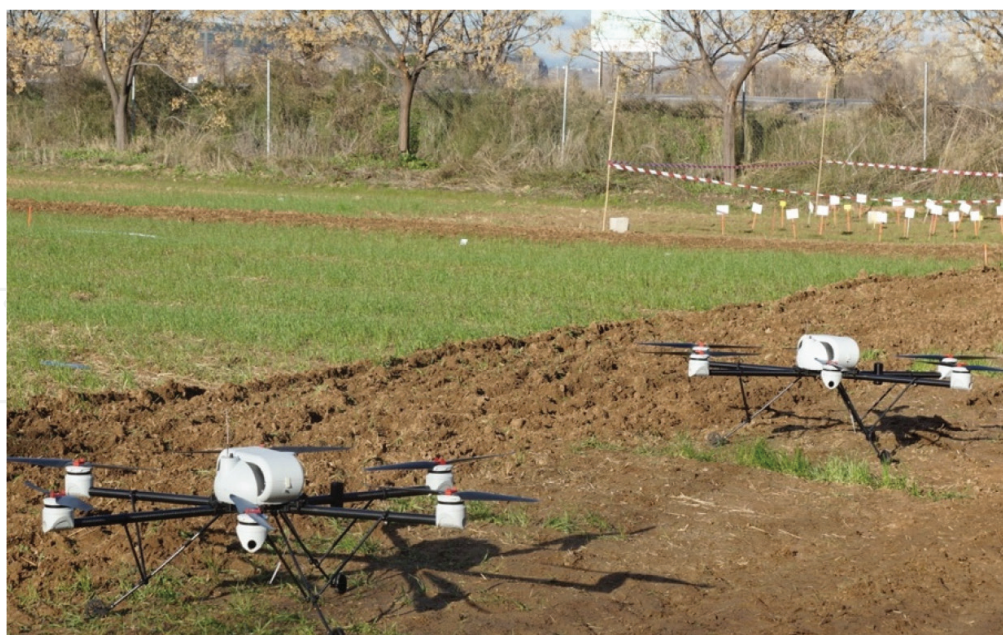
Figure 2. Aerial units of RHEA project.

The drones were equipped with two high-resolution cameras ( 4704 \times 3136 ) mounted on a gimbal system. A multi-spectral device that includes visible and near infrared (NIR) channels was selected to maximize the robustness under different light conditions. Moreover, in order to preserve the complete colour information, the solution uses a coupling of two commercial still cameras: one of them modified to provide the NIR channel. The flights were performed with an elevation of 60 m to obtain a resolution of 1 cm per pixel with each image covering approximately 40 \times 30 m and overlapping 60% with the consecutive ones.