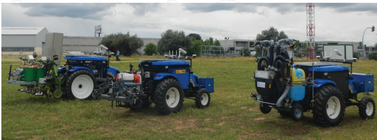
Figure 1. Ground units of RHEA project.

Usually, weeds are not uniformly spread over the fields but are located in patches. For this reason, the first step of the mission is to obtain high-precision aerial images to locate the patches in the field. The location of the patches will allow defining optimal paths for the tractors. This task requires a thorough planning of the flights, which was our main task in this project. Several area coverage planning techniques were applied taking into account spatial and temporal requirements, in order to generate optimal and safe flight plans for the drones. A complete description of the aerial mission can be found in Refs. [102, 103].