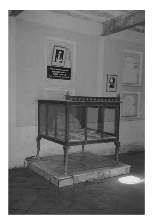
Figure 1.2 Throne (masnad) of Nizām al-Mulk at Nawkhanda Palace, Awrangabad.

Neither Shāh Palangpōsh nor Shāh Musāfir were literary-minded theoreticians of even the most modest kind, and their importance for our understanding of the Sufi