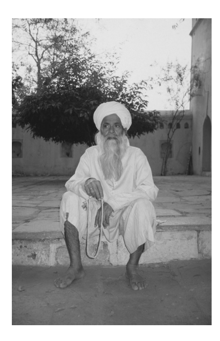
Figure 4.2 A Sufi pilgrim at the shrine of Nizām al-dīn Awrangābādī.