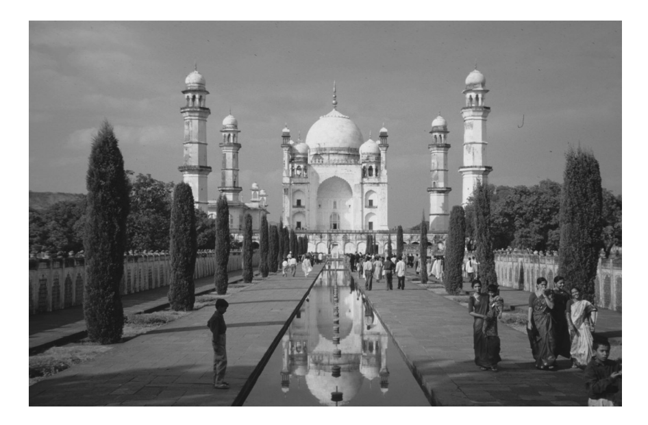
Figure 1.1 The mausoleum of Awrangzeb's wife (Bibi ka Maqbara) in Awrangabad.

Deccan (Figure 1.1). However, imperial and sub-imperial patronage led to the construction of numerous other buildings across the city, from a royal palace designed after the models of the 'red forts' of Delhi and Agra to aristocratic mansions, markets, mosques and eventually shrines for the new city's emergent Sufi saints. In 1667, during the early years of Awrangzeb's reign, the French traveller Jean de Thevenot stayed in Awrangabad and penned a memorable description of its early cityscape. After pouring praise upon the recently completed mausoleum of the emperor's wife, Thevenot went on to record his other impressions of the city.