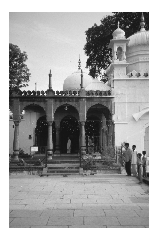
Figure 2.1 Panchakkī, the shrine of Shāh Musāfir and Shāh Palangpösh.

The tradition of Shāh Palangpōsh and Shāh Musāfir also maintained its position of early prominence in the city during the eighteenth century. Shāh Musāfir's successor Shāh Mahmūd oversaw the expansion of the shrine to the degree that it acquired much of the surrounding property along the riverbank beneath the city walls (Figure 2.1). Yet with their own gateway in the city walls, the Panchakkī saints' position as spiritual gatekeepers to the city at large seems to have been regarded more