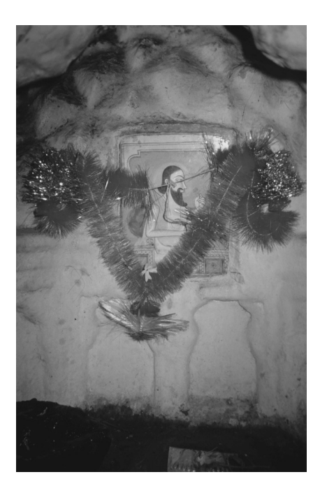
Figure 5.1 Miniature painting of Shāh Nūr at the math of Mānpūrī in Dawlatabad.

arose over the future management of the shrine that would continue for the remainder of the century. While there were personal dimensions to the dispute, including petty rivalries between a new Muslim middle class in Awrangabad and the respectable families of old, the dispute was in essence a structural one. As such, it reflected debates that had existed in the Sufi tradition for centuries about the right to inherit the charisma of a deceased master via ties of either blood or initiation. Modernizing trends in the administration of Haydarabad had meant that by the early twentieth century these old debates were being trumped by the emergence of rule by committee. Given the role of the government in the shrine's administration under Shams al-dīn, it was therefore only a small step to replace him after his death with an eight-member management committee.<sup>10</sup>