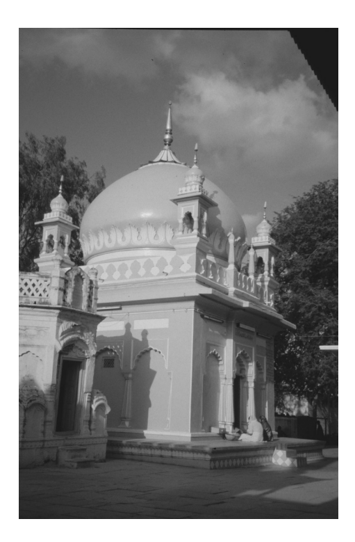
Figure 4.1 The mausoleum of Nizām al-dīn Awrangābādī.

coincidence of Dussehra and Muharram.<sup>10</sup> Considering the long tradition of the common celebration of 'Ashūra, the tenth day of the month of Muharram, by both Hindus and Muslims in the Deccan, these administrative policies had great significance.