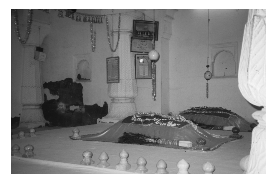
Figure 2.2 The tombs of Shāh Musāfir and Shāh Palangposh.

as Fazl al-dīn.<sup>42</sup> The shrine was also described by Sabzawārī at this time as a centre of pilgrimage for travellers from beyond the city.<sup>43</sup> Such visits may well have coincided with the celebration of the death anniversary of Shāh Musāfir and Shāh Palangpōsh, which was celebrated throughout this period. A document referring to expenses at the 'urs in 1186/1772 of 678 rupees suggests that the anniversary was celebrated on a lavish scale.<sup>44</sup> This line of sajjāda nashīns continued through four more successors, all of whom were buried in the forecourt of Shāh Musāfir's mausoleum.