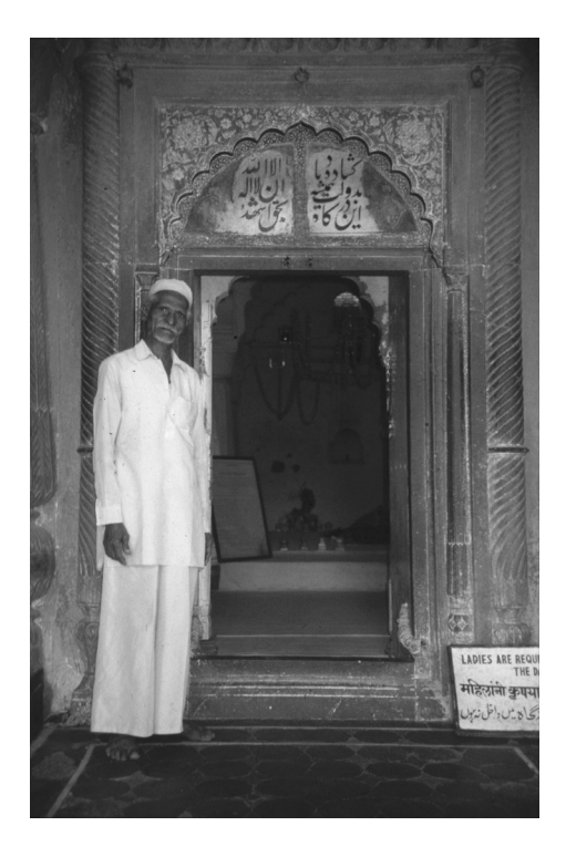
Figure 3.1 Shrine attendant (khādim) before the tomb of Shāh Musāfir.

Aside from this learned role, Panchakkī had also come by this period to act as a vivid architectural reminder of the city's glorious Muslim past. Continuing to reap the financial rewards of the shrine's early endowments, the sajjāda nashīns of Panchakkī evidently still received sufficient income from the shrine's landholdings to maintain the costly delights of fountains and festive lighting ( chirāghānī ) mentioned by visitors. It also seems likely that dervishes continued to reside in its khanaqah at the sajjāda nashīn 's expense. Panchakki was thus able to find a role as the epitome of the shrunken city's Mughal past and its more cultivated traditions of Sufi piety.