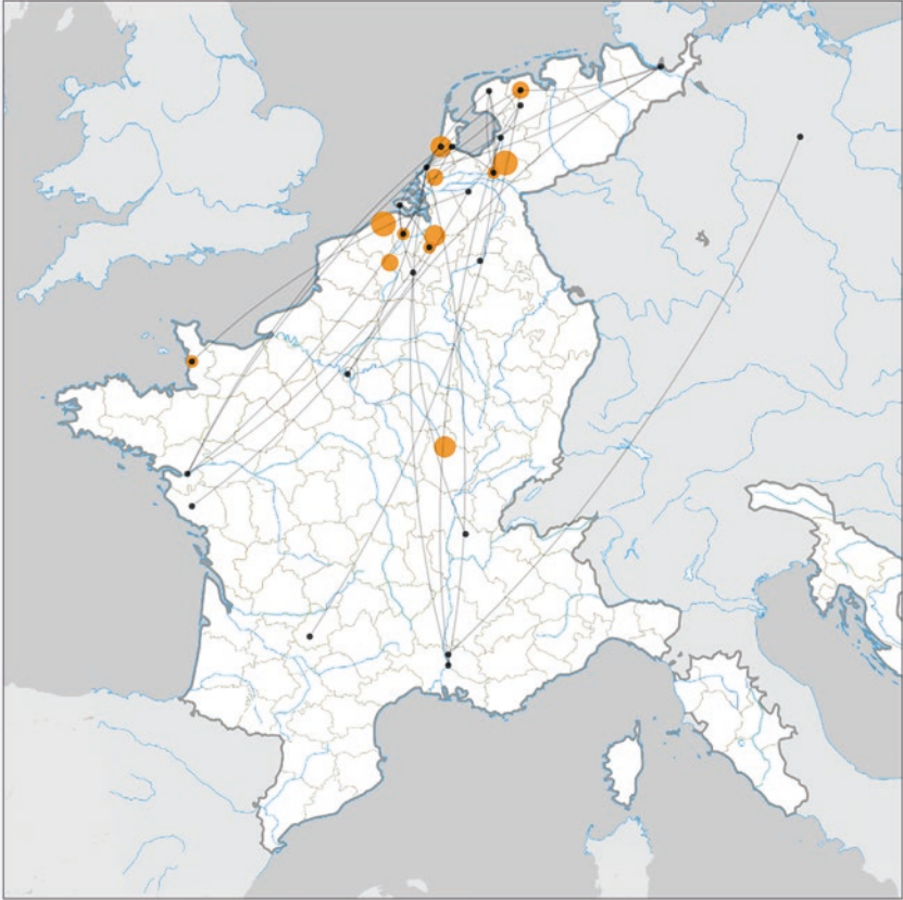
Map 5.1 Circulation of the Napoleonic prefects in the Dutch departments

Celles and De Stassart controlled the densely populated western parts of the Netherlands. Prefects of Dutch descent were generally not mobile; they seldom traveled further than two departments. Hultman was the exception to the rule, having a continuous and mobile Napoleonic career.