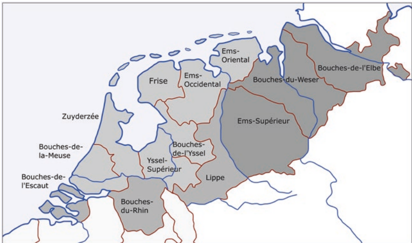
Map 1.1 Administrative division of the Dutch and Northwest German departments

Not all territories part of the départements de la Hollande were actually Dutch. Ems-Oriental (the present-day region of Ostfriesland) was a former Prussian province that had been incorporated into the Kingdom of Holland in 1807. Nevertheless, this ‘Dutch’ department fell under the Imperial Court in Hamburg. Furthermore, the lands that would later make up the Lippe department were initially part of three adjacent Dutch departments, thus part of the départements de la Hollande . But resistance from the local elite in Münster led to the creation of a separate German-speaking Lippe department, not under the supervision of the French in Amsterdam or Hamburg (more on this in Chap. 5 ). Nevertheless, some actors within the Empire (for instance, the gendarmérie , and to a certain extent the