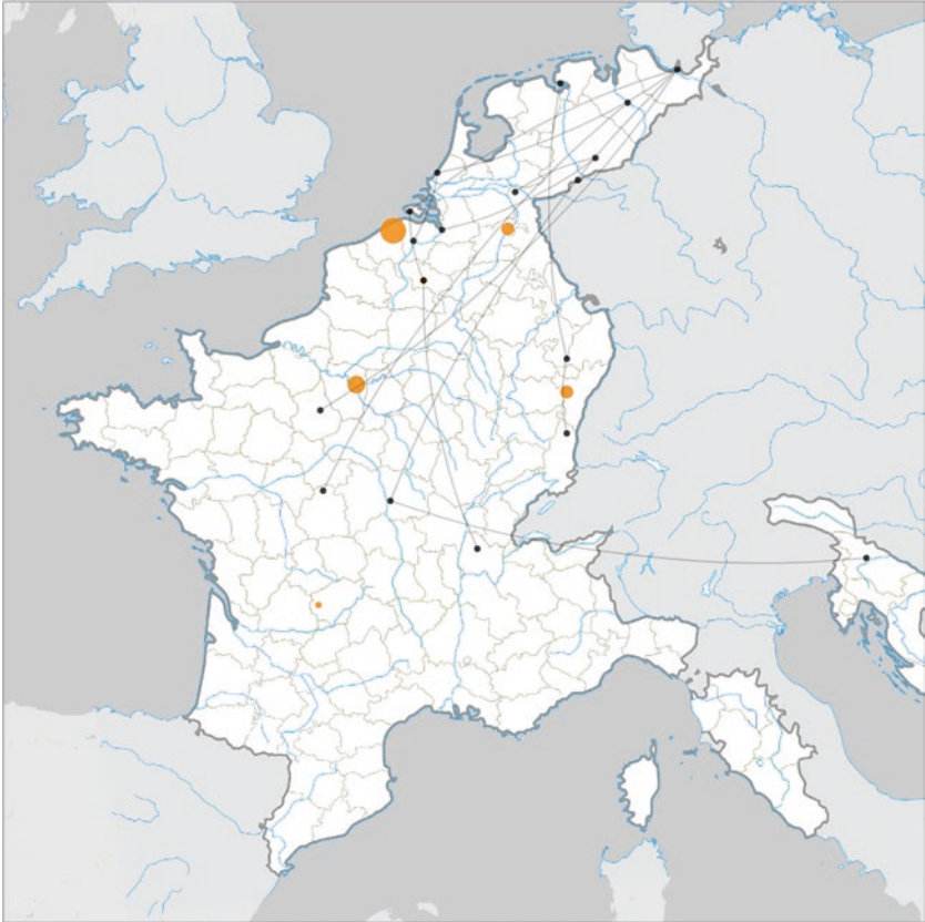
Map 5.2 Circulation of the Napoleonic prefects in the Northwest German departments

officials in the Dutch departments and those in the German departments will become even more apparent in the next chapter on the subprefects.