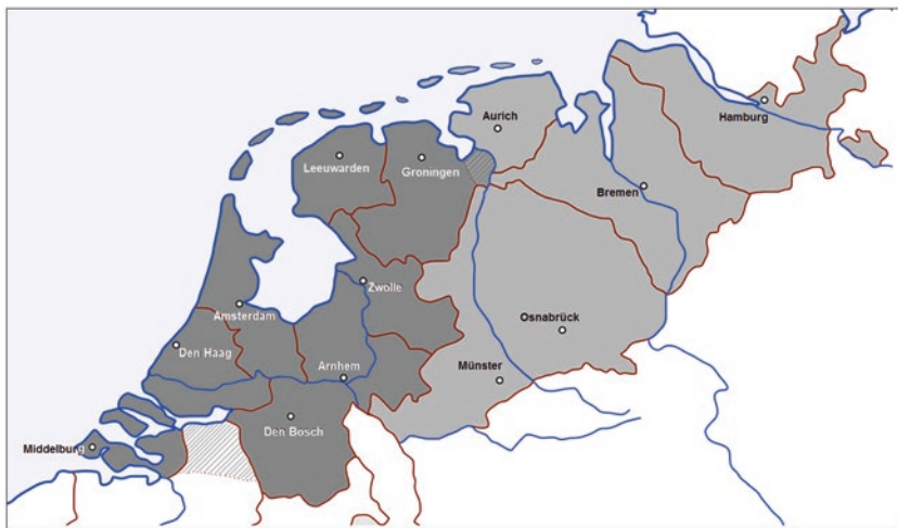
Map 1.2 ‘Dutch’ and ‘German’ departments as defined in this study, with préfectures (departmental seats of government)

as inlijving / Einverleibung (incorporation) or bezetting / Besetzung (occupation). Here, I differentiate between ‘conquest’, ‘incorporation’, and ‘integration’.