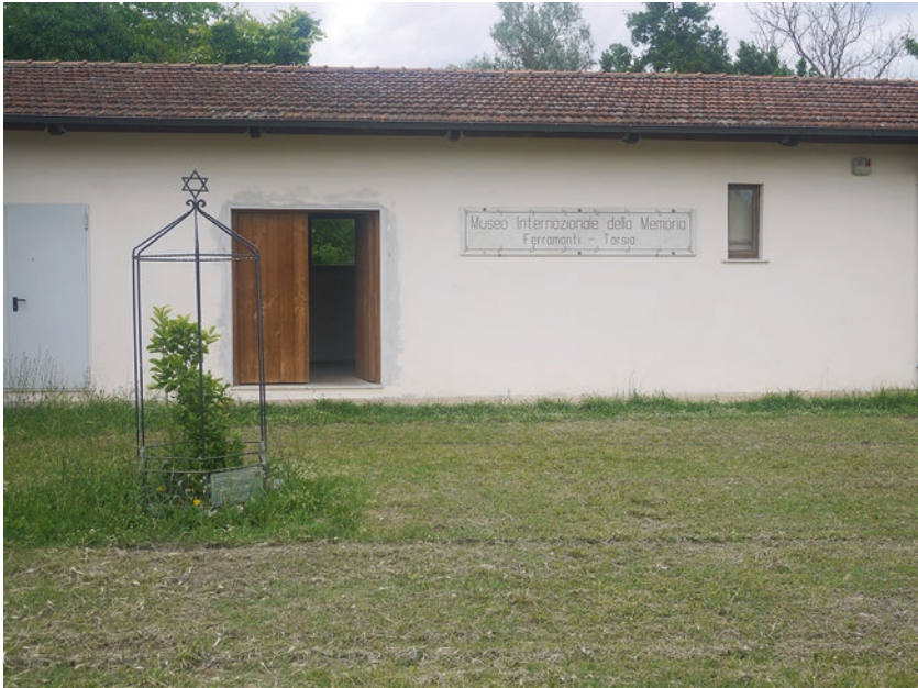
Fig. 4.7 The Museum of Memory on the site of the Ferramonti camp, Tarsia, Italy, May 2018 (cl. Marc Brightman)

‘countermonument’, which ‘does not console or reassure—it does not heal. On the contrary, it “torments” its neighbours’ (James E. Young, in Homans 2000: 22–23) with the reality of death at the threshold of Europe. But there are reasons for thinking that its role is more ambivalent. The annual celebration of the Liberation at Ferramonti portrays the concentration camp as a relic of resistance, rather than of oppression, in its own right. The reason for this is that the concentration camp was not a site of extermination; nor was it, in practice, a site for deportation. It was designed to be a holding center for Jews and other minorities and political prisoners from all over the continent, who were supposed to be deported to Nazi death camps. The camp officials are said to have continually put off German requests to deport interns of Ferramonti to Germany. It was the first concentration camp to be liberated by the Allies in 1943, and in contrast to what they would find further north, it looked to them more like a village than a prison (it had synagogues, a hospital, school and a