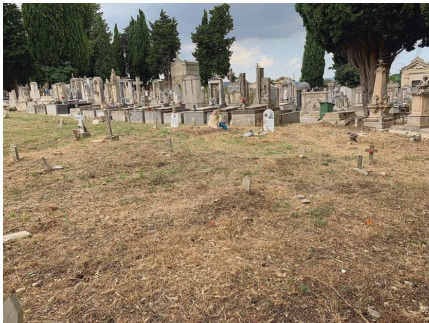
Fig. 4.5 Graves of unidentified migrants, victims of the 3 October 2013 wreck, Palazzolo Acreide, Italy, July 2019

time by the Italian Ministry of the Interior and the Region of Calabria. The initiative is intended to provide a burial place for unidentified or unclaimed human remains recovered in Italian and international waters, which have hitherto been distributed among municipal cemeteries across Sicily and Calabria, sometimes in special extensions of the existing burial ground. It is meant to resolve the practical problem of giving a dignified burial to human remains after an often lengthy administrative process. During our meeting in late 2018 in a scrubby grove filled with ancient olive trees, on the slopes below the hilltop town, which is to be the site of the migrants' cemetery, the mayor of Tarsia Roberto Ameruso and the civil rights campaigner Franco Corbelli, who conceived and promoted the project, gave an impassioned performance, placing great emphasis on the concept of dignity—Corbelli sees the cemetery as 'restoring dignity to those who have lost their lives'. With relentless energy compensating for his diminutive appearance, Corbelli insistently set out his vision of a