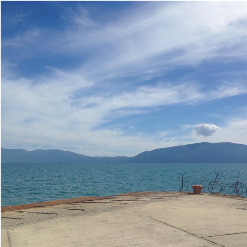
Fig. 4.1 The boarding dock of the Kateri i Radës at Vlora, which became the site of the annual commemoration of the Otranto Tragedy. Vlora, Albania, 2019

how the 57 coffins that were buried in Vlora merely contain seaweed or that the body in the coffin had been irreparably damaged and tormented. As expressed in the inscriptions on some of the tombstones by their missing relatives (see Fig. 4.1), those buried in the cemetery are still suffering in the sea (Figs. 4.2 and 4.3).