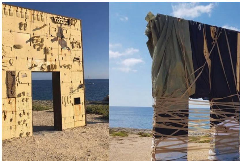
Fig. 2.1 Gate of Europe, before and after the symbolic closure on June 3, 2020.