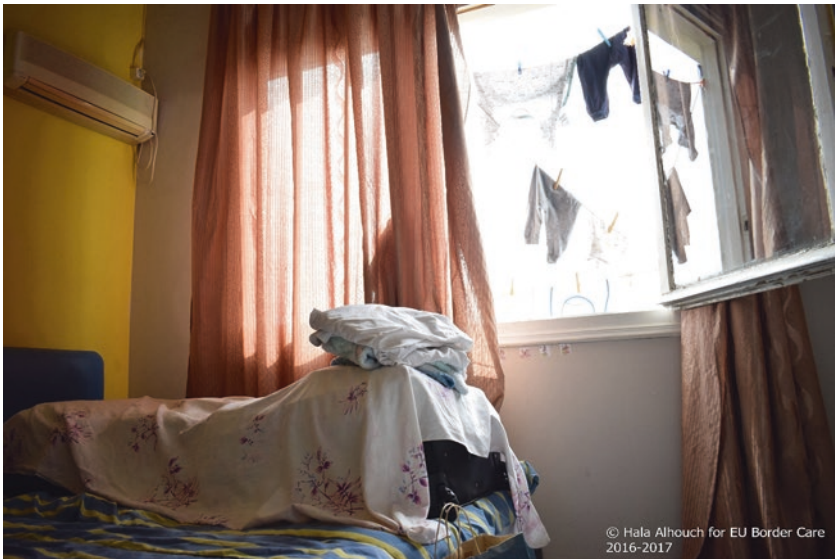
Fig. 3.1 The living space of a Syrian family of five placed by the UNHCR in a NGO-administered hotel in downtown Athens. Their suitcases, covered yet ready to use, evince the unpredictability of their journey and overall circumstances, which impacted the maternity care pregnant refugees received

The desk where Voula is seated faces the room's entrance. To her right, along the wall, pregnant women close to term lie on reclining beds