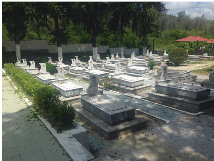
Fig. 4.2 Part of the Vlorë cemetery dedicated to the victims of the Kateri i Radës wreck, Vlorë, Albania, May 2019